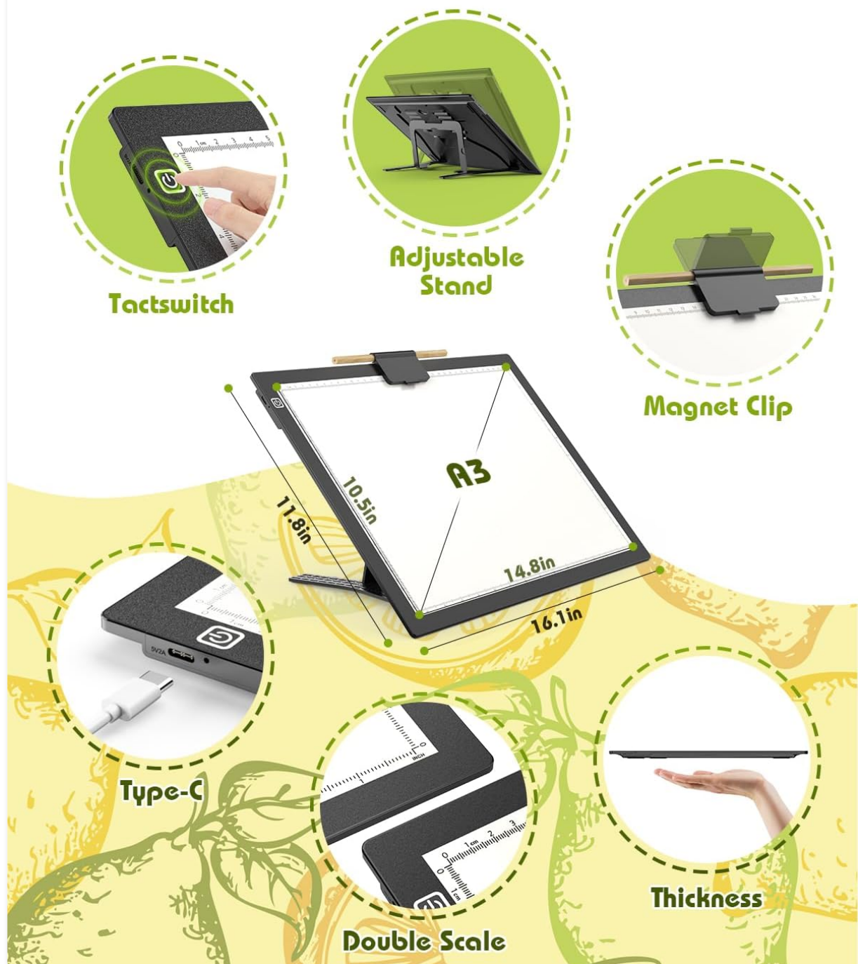
Figure 4: Key features include the tactswitch, adjustable stand, magnetic clip, Type-C port, and precise rulers.