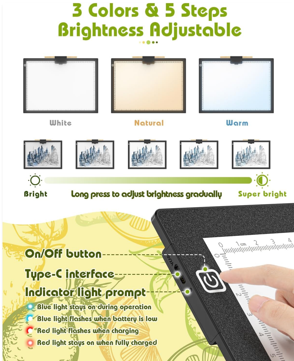
Figure 3: Controls for power, brightness, and color temperature are conveniently located on the side.