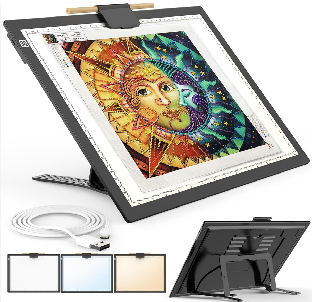
Figure 1: KACOLA A3 Rechargeable Light Board with its adjustable stand and included accessories.