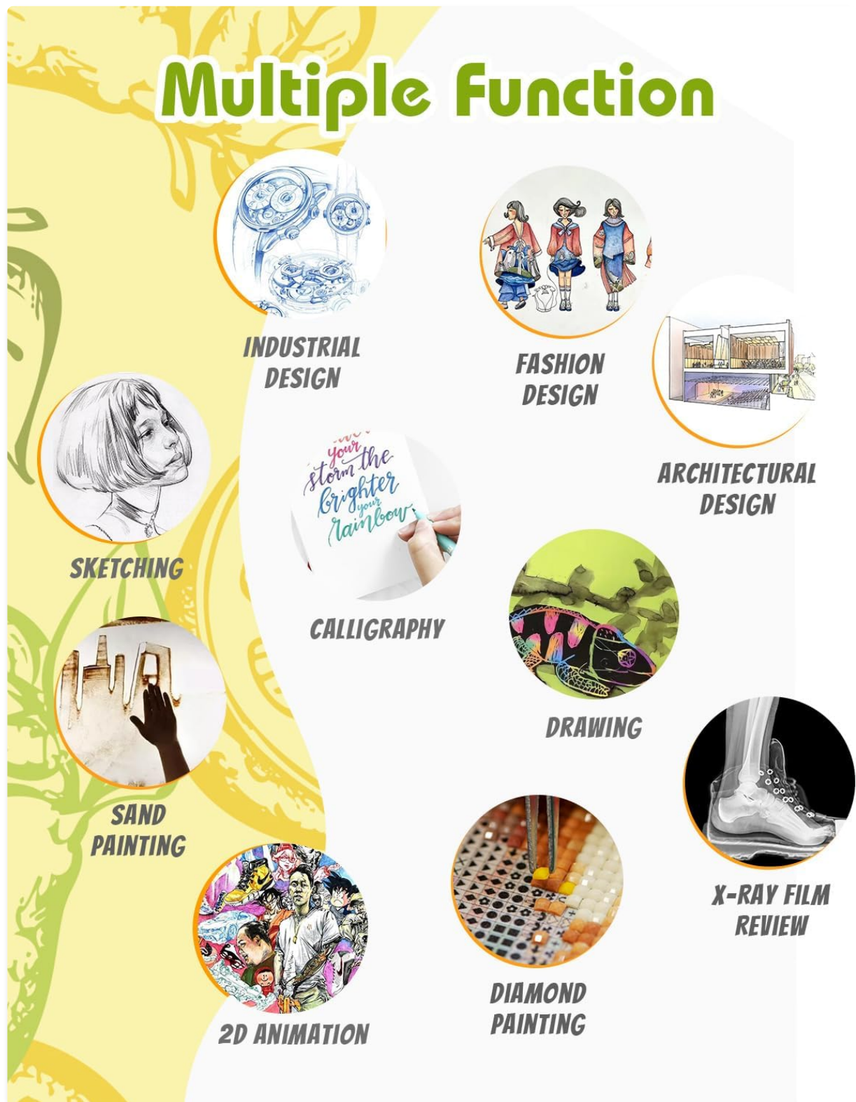
Figure 5: The light board supports a wide array of creative and professional applications.