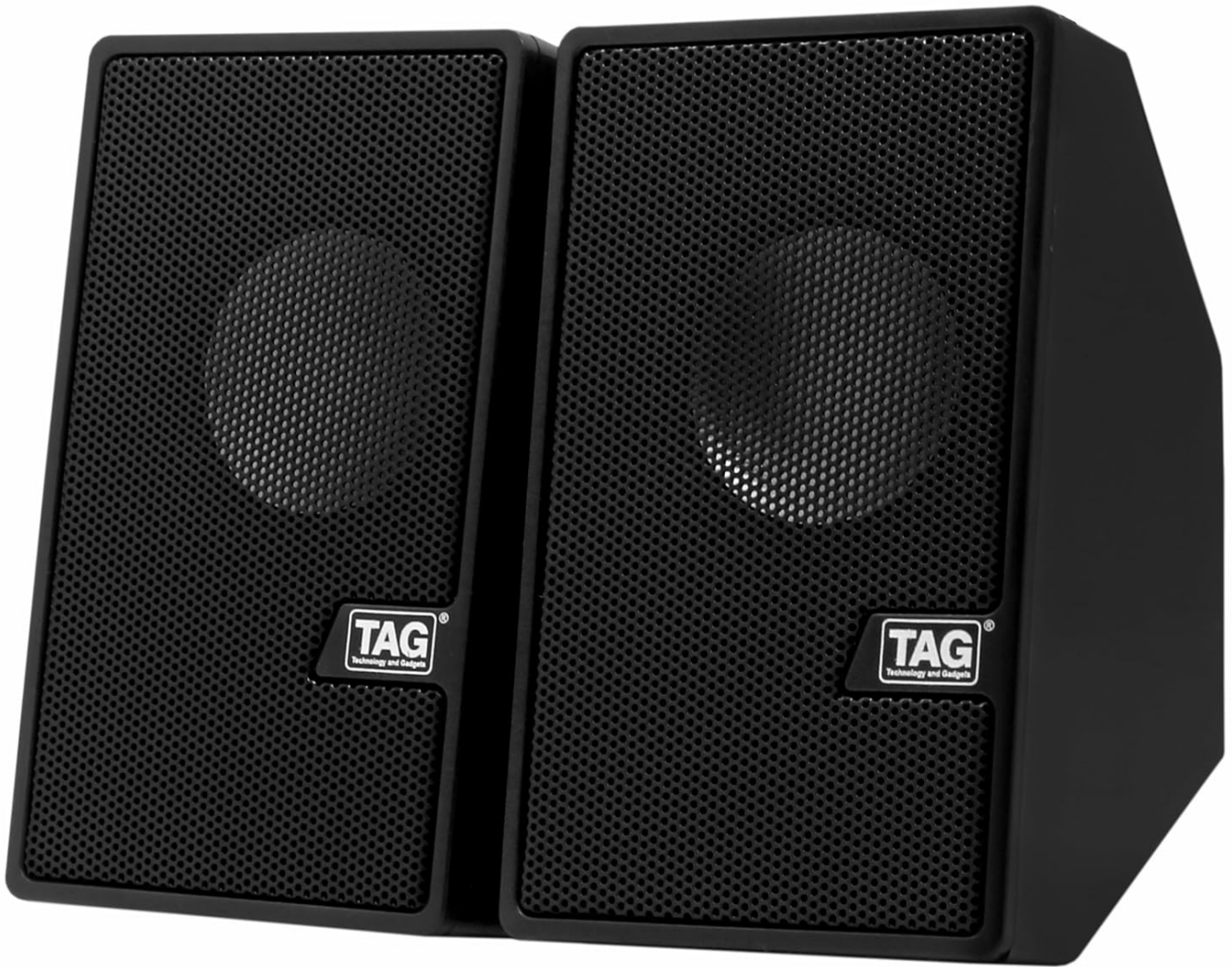
Image 1.1: Front view of the TAG DP-500 Stereo 2.0 Multimedia Speakers.