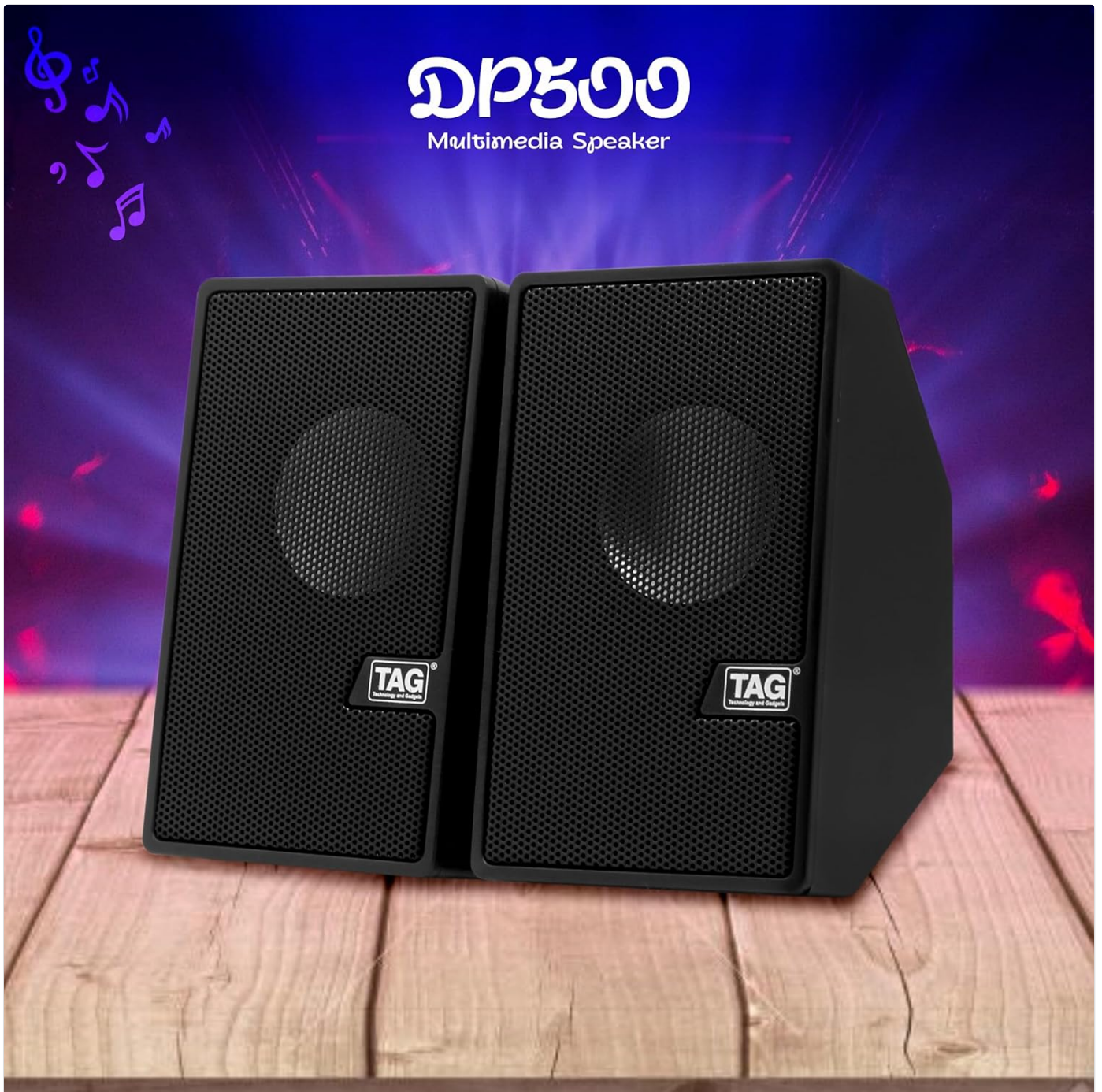
Image 2.1: The TAG DP-500 Multimedia Speakers in a typical usage environment.