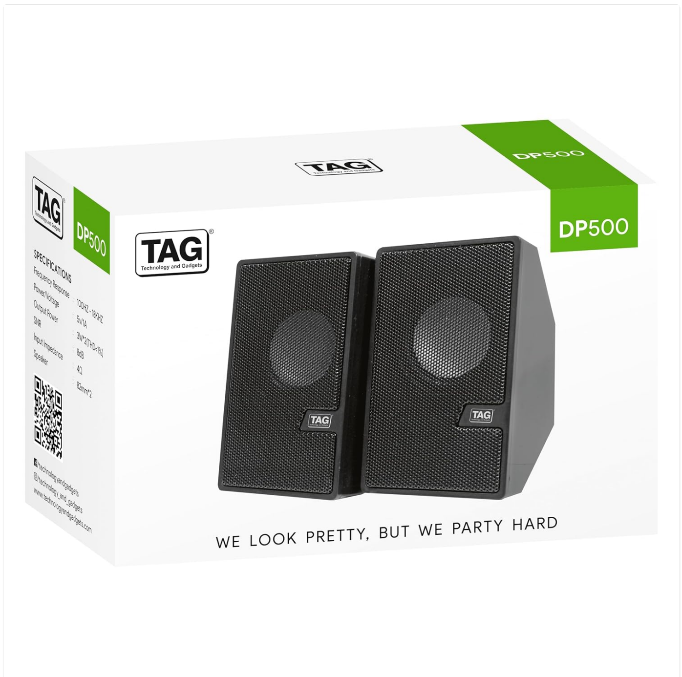
Image 3.1: The TAG DP-500 speakers shown with their retail packaging.