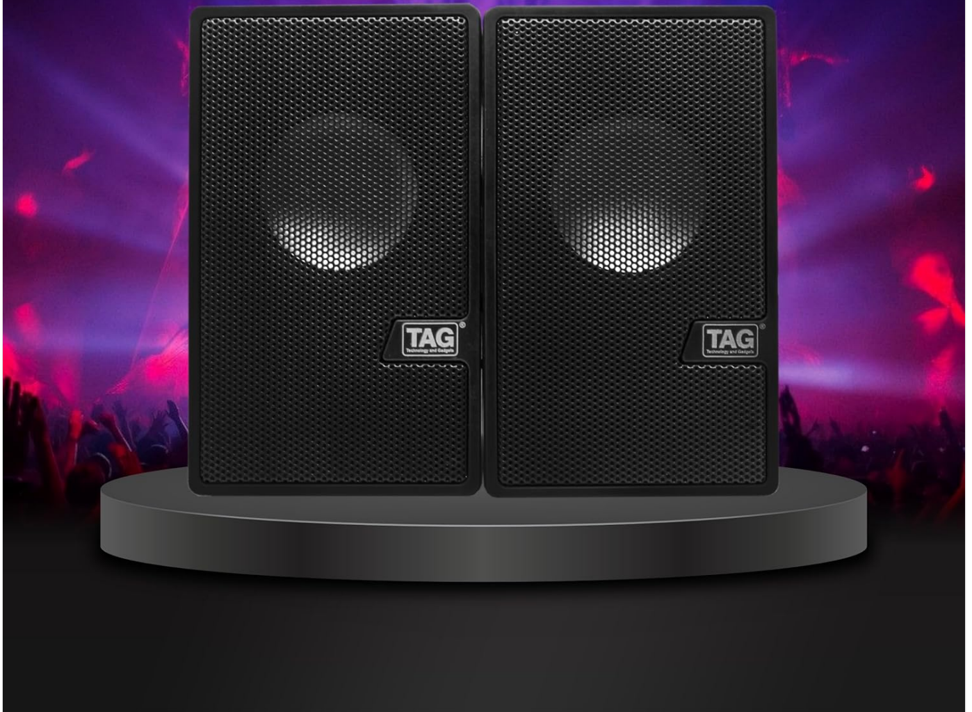
Image 2.3: The TAG DP-500 speakers positioned to emphasize their crystal clear sound output.