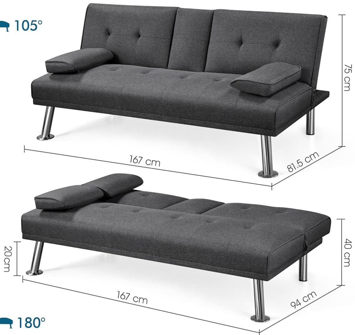
Image 6.1: Detailed dimension diagram of the Yaheetech Convertible Sofa Bed in both its upright (105°) and fully flat (180°) configurations, including length, width, and height measurements.