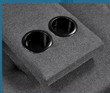
Drop-down Cup Holders