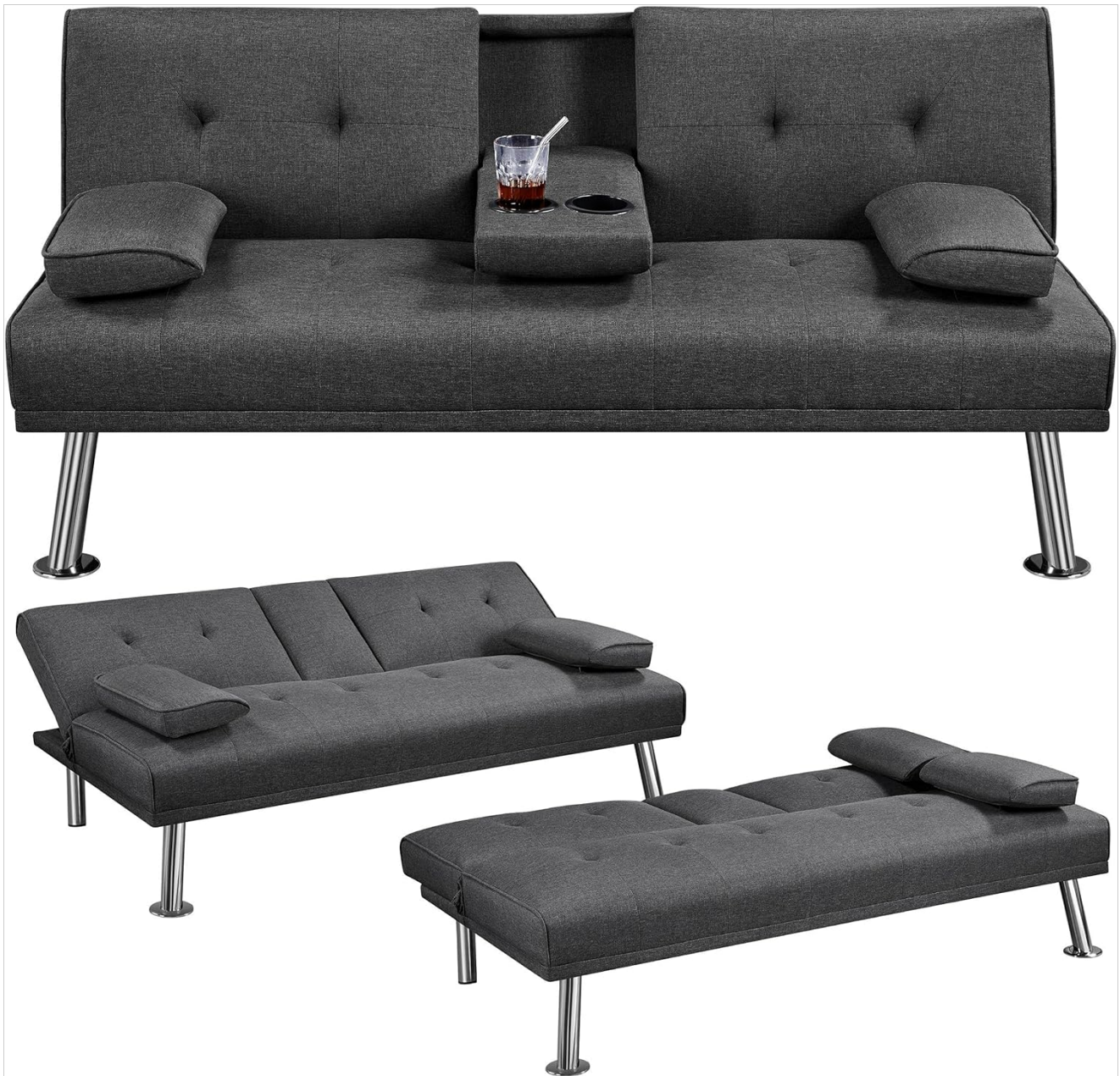
Image 1.1: The Yaheetech Convertible Sofa Bed shown in both its upright sofa configuration and fully reclined bed configuration, highlighting its dual functionality.