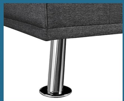
Chromed Metal Legs