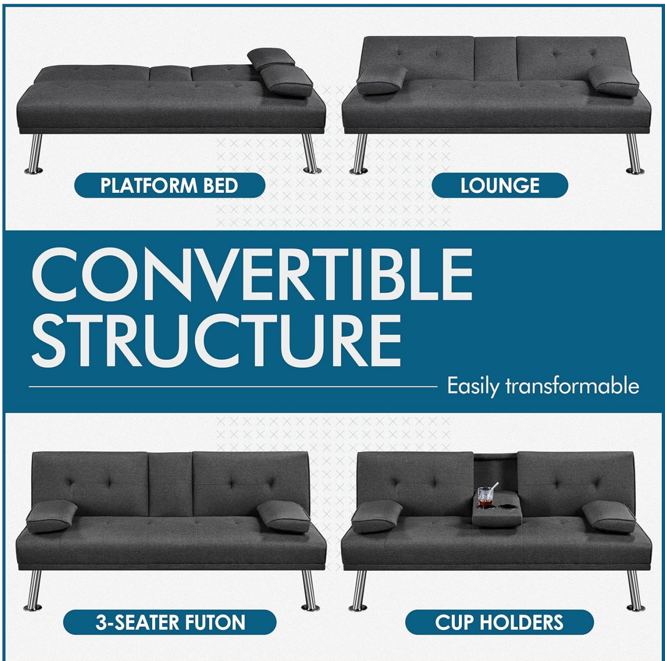
Image 3.2: This image demonstrates the versatile convertible structure, showing the sofa in platform bed, lounge, 3-seater futon, and 3-seater futon with cup holders configurations.