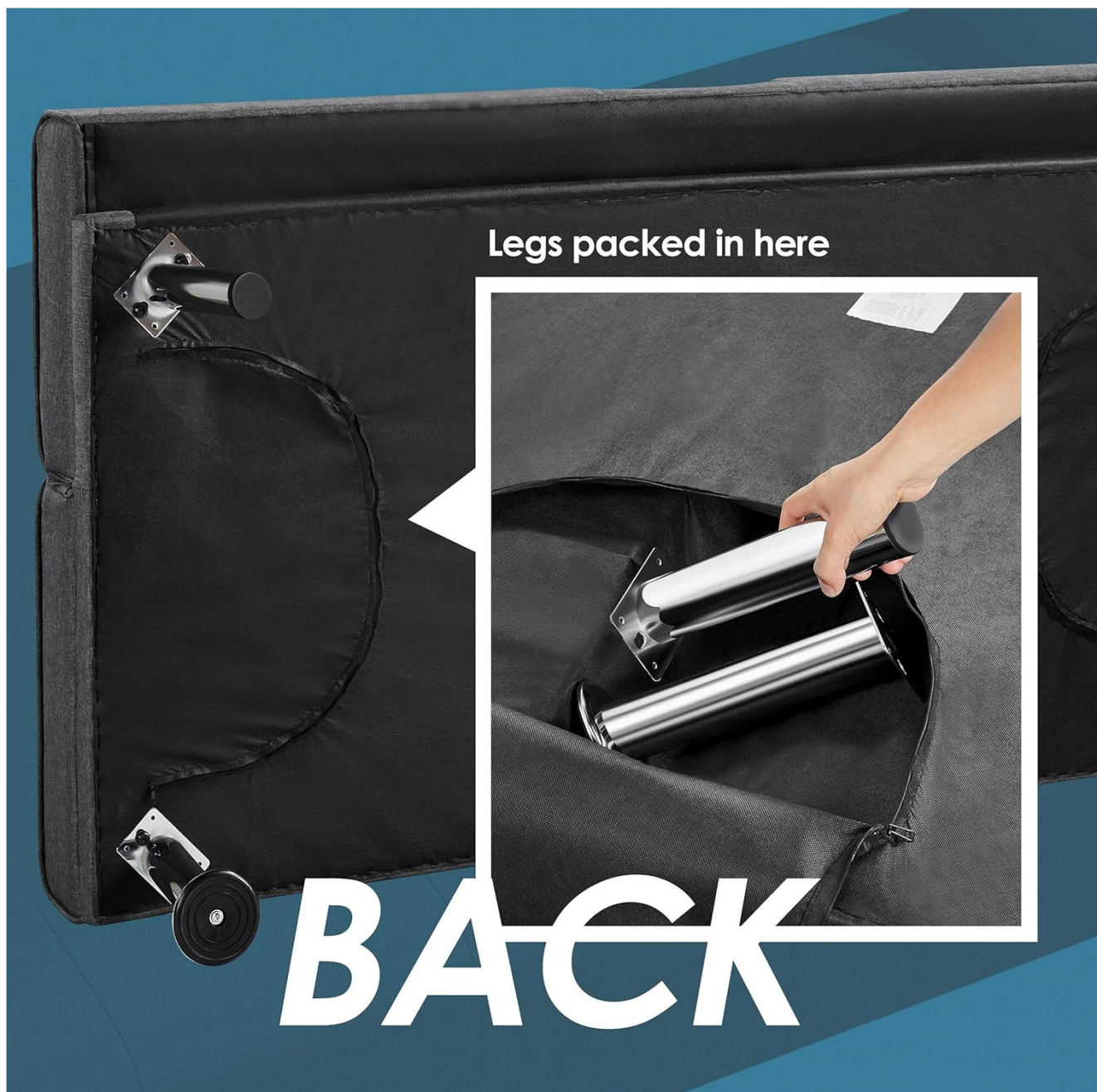
Image 2.1: The underside of the sofa bed, illustrating the zippered compartment where the metal legs are securely stored for shipping.