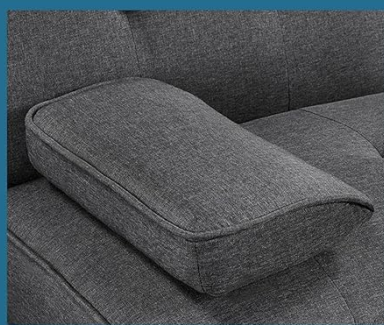
Comfy Throw Pillows