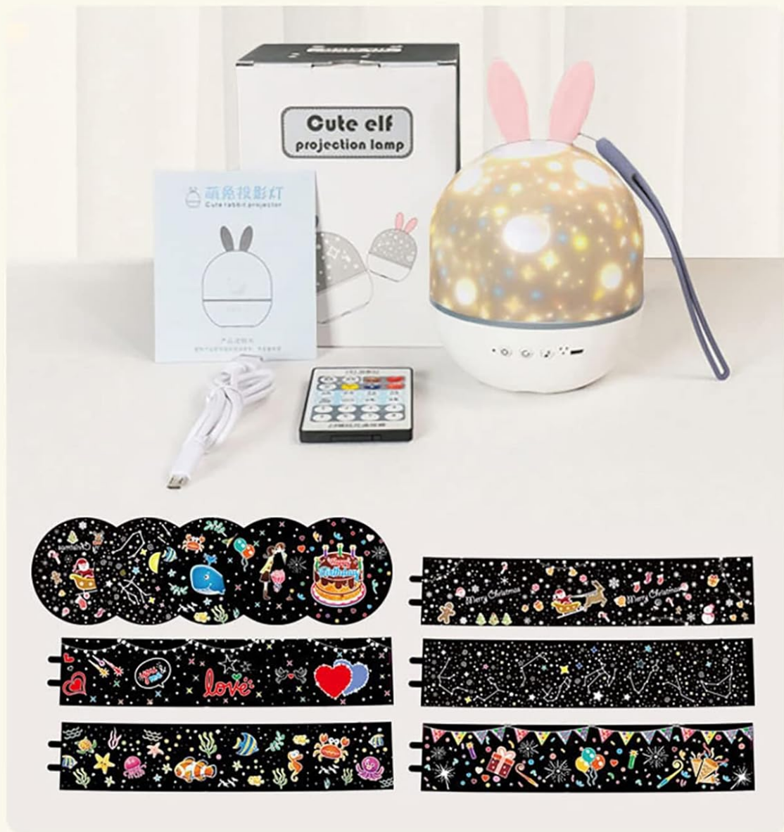
Image: The complete set of items included in the package, featuring the main lamp unit with rabbit ears, a remote control, a USB charging cable, and multiple interchangeable projection films.