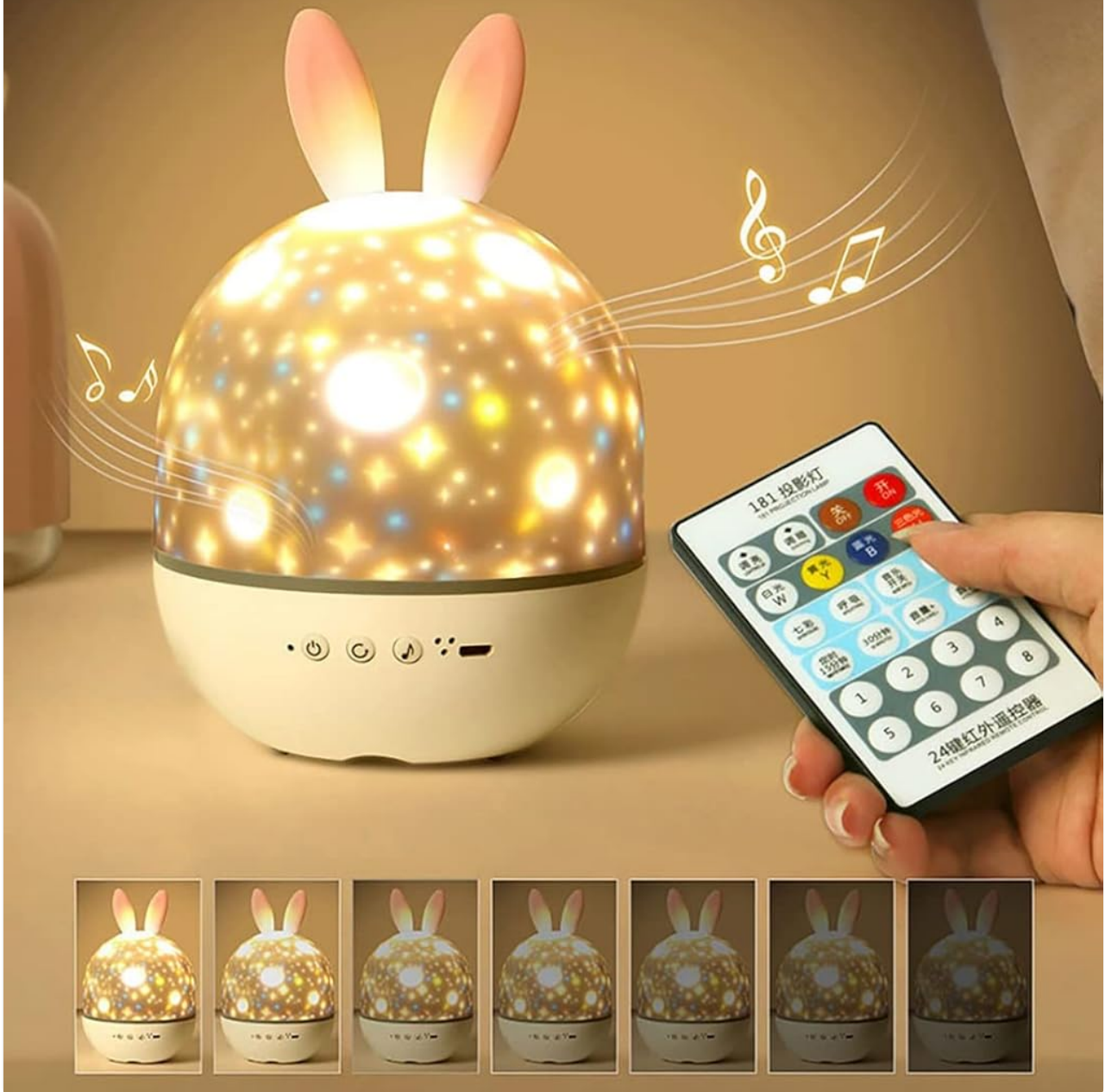
Image: The remote control, featuring various buttons for comprehensive control over the lamp's functions, including power, light colors, brightness, music, and rotation.

Multi-level light color and brightness can be adjusted at will