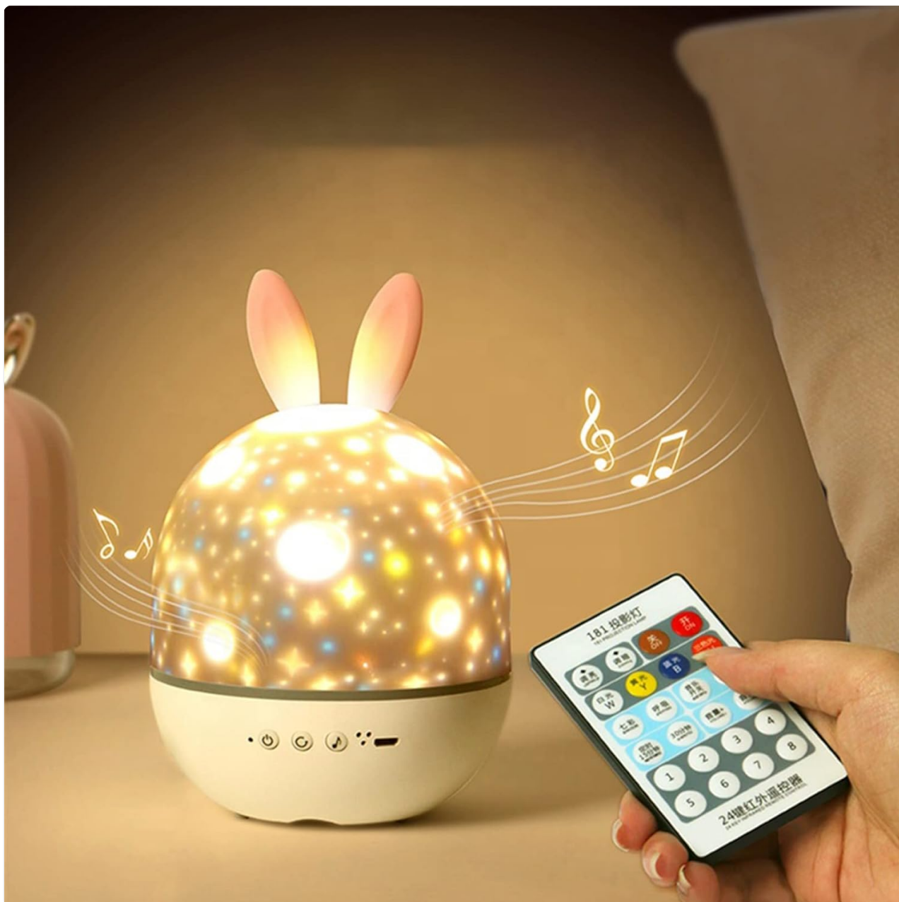
Image: The TTiiLoe projection lamp, featuring distinctive rabbit ears, actively projecting a dynamic starry sky pattern. A hand is shown holding the remote control, demonstrating user interaction.

base or the corresponding button on the remote control.