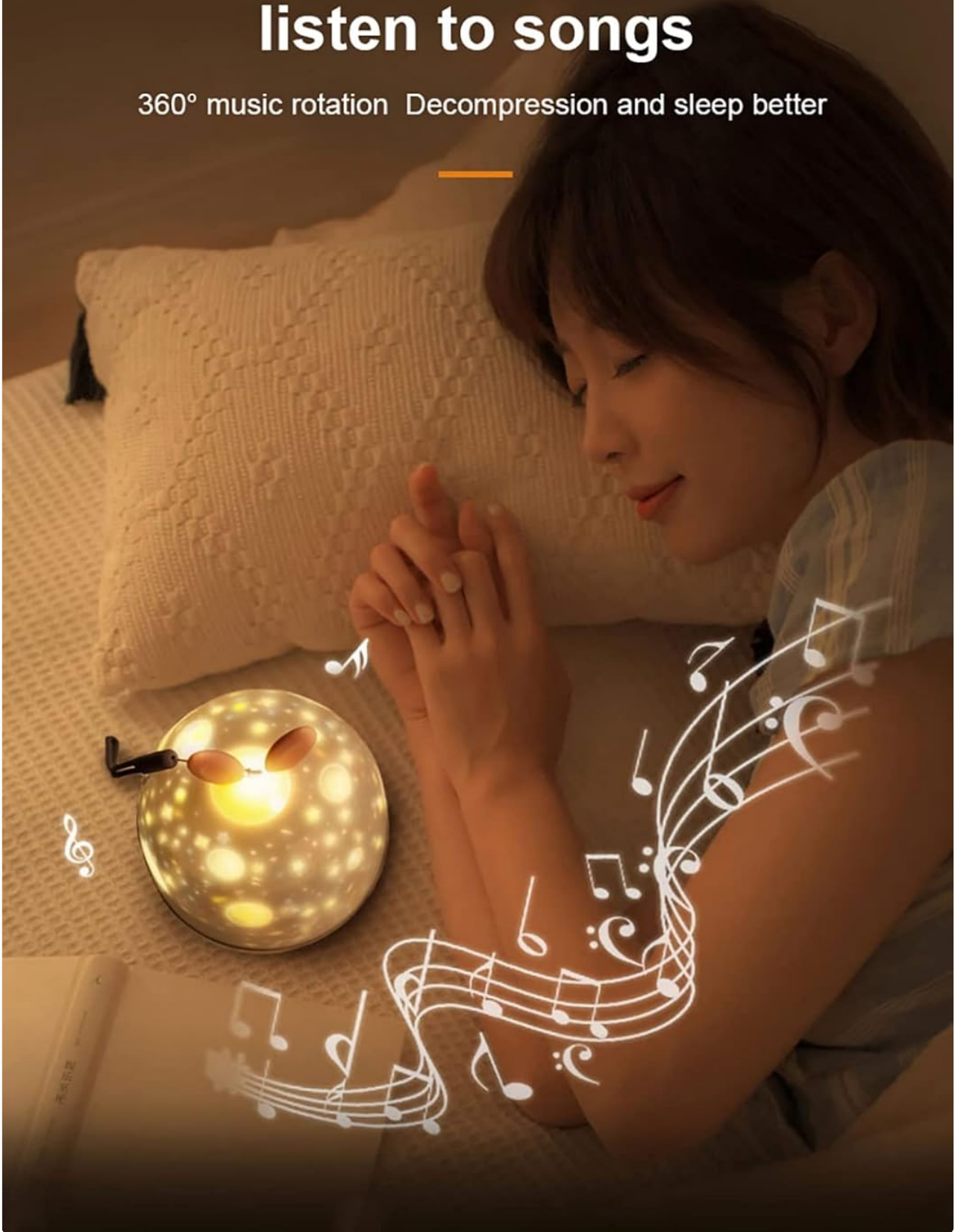
Image: The projection lamp serving as a night light on a bedside table, with musical notes depicted around it, illustrating its integrated music playback capability for a calming environment.

360° music rotation Decompression and sleep better