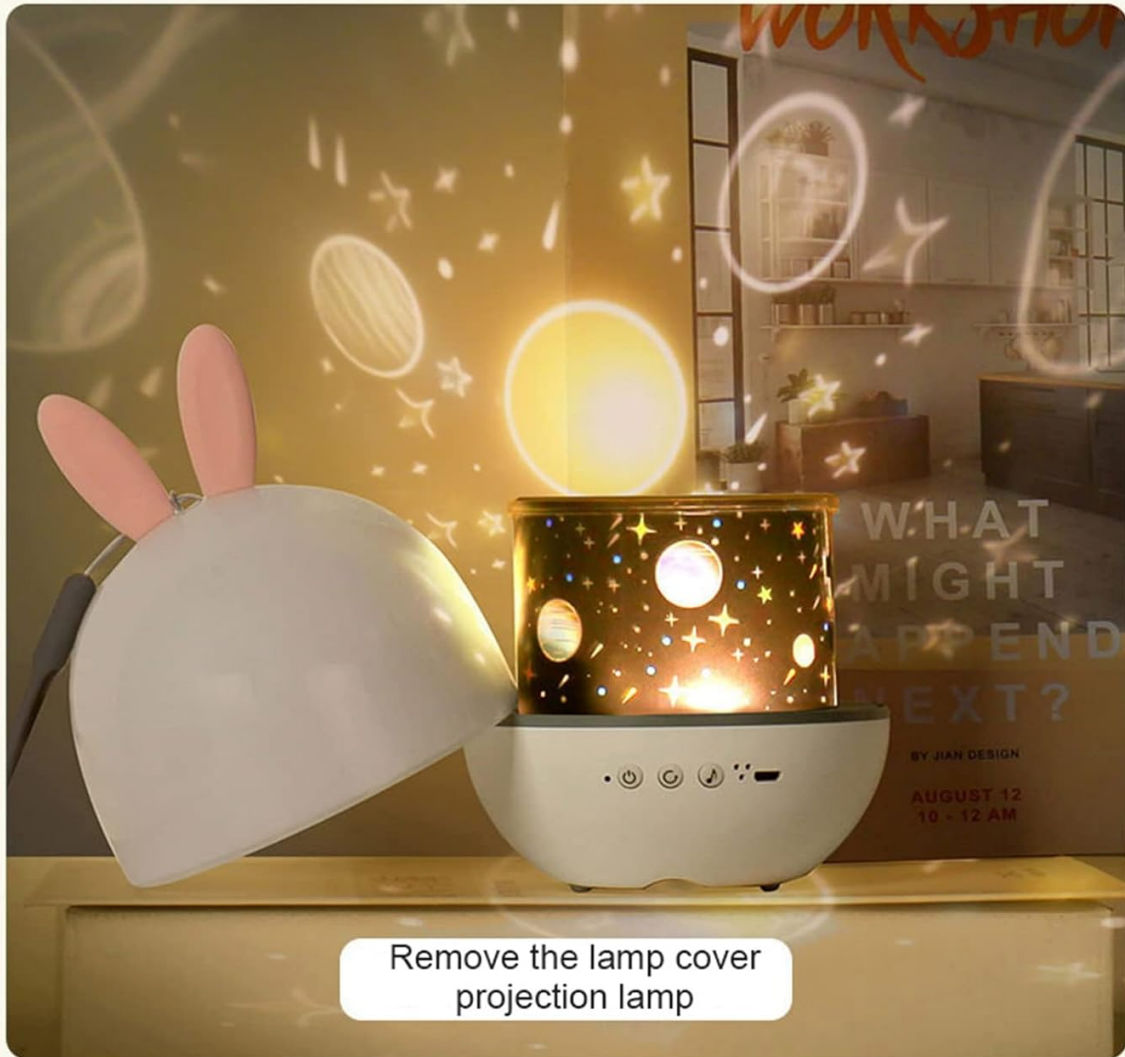
Image: The lamp is depicted in two configurations: with the white dome cover on, functioning as a gentle night light, and with the cover removed, actively projecting patterns onto a nearby surface.

Simple operation to transform in one second