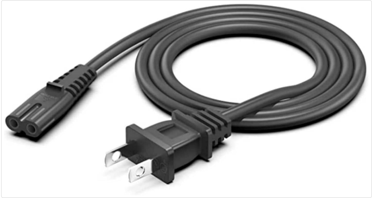
Image 3.1: AC Power Cord. This image shows the detachable AC power cord that connects the adapter to the wall outlet.