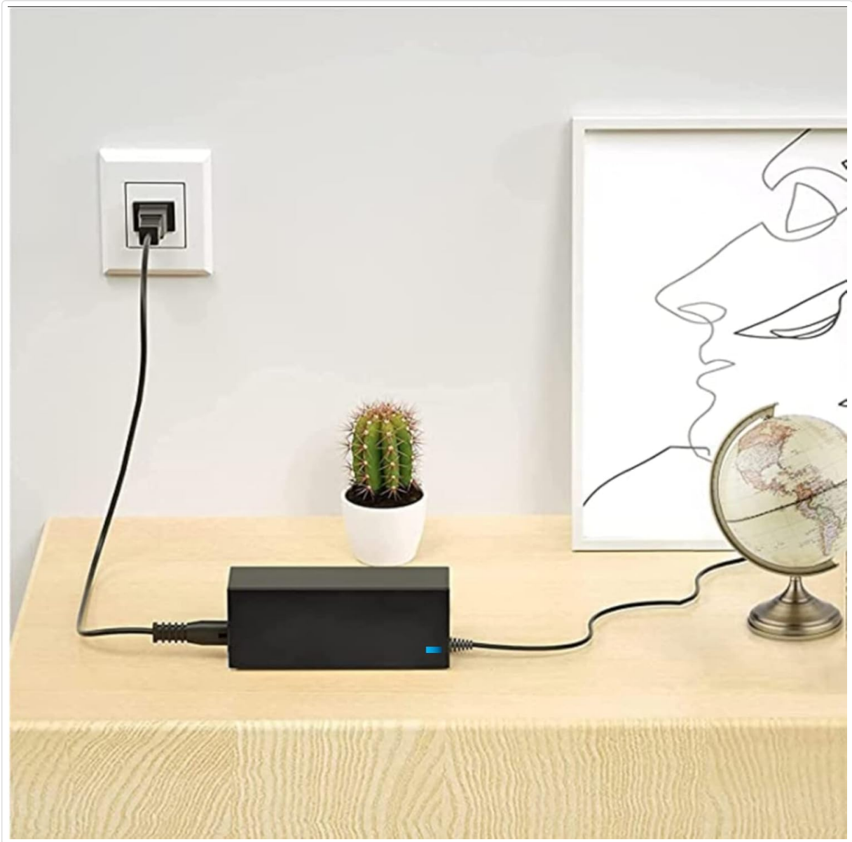
Image 4.1: Adapter in Use. This image demonstrates the power adapter connected to a device and plugged into a wall outlet.