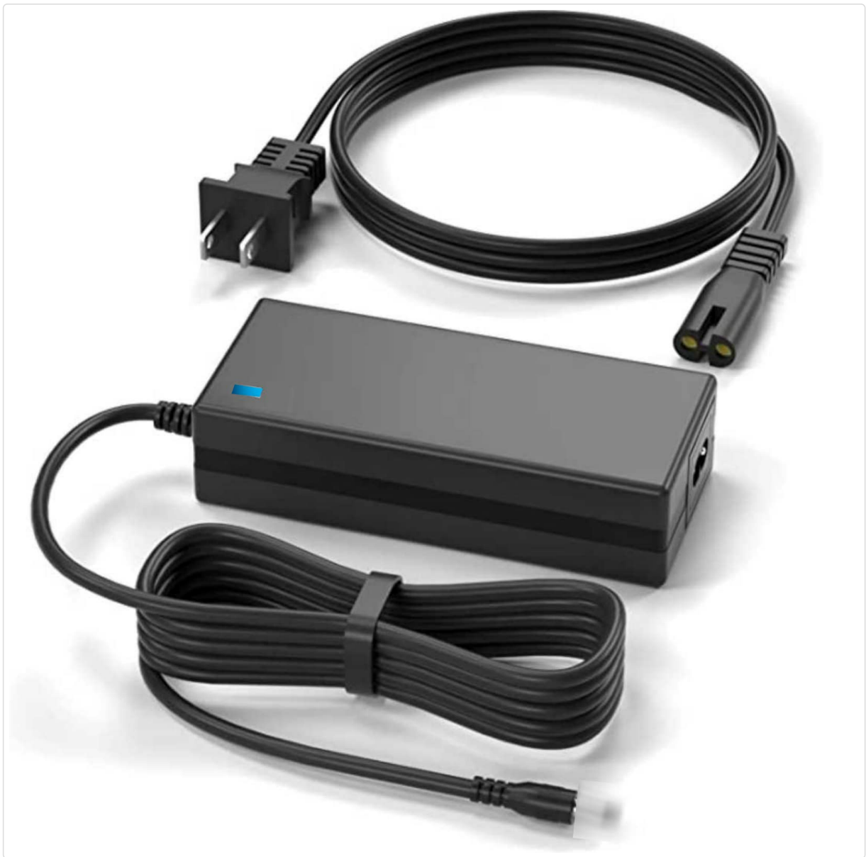
Image 1.1: Onerbl Power Adapter. This image displays the main power adapter unit with its attached DC output cable.