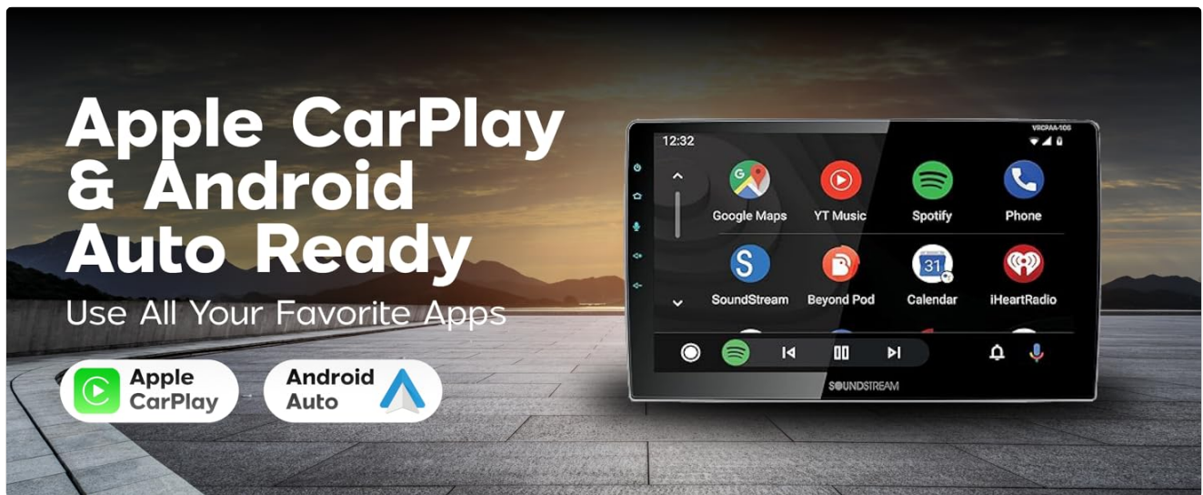
Image: The 10.6-inch floating touchscreen displaying both Apple CarPlay and Android Auto interfaces, highlighting app icons for phone, music, maps, and messages.

Your browser does not support the video tag.