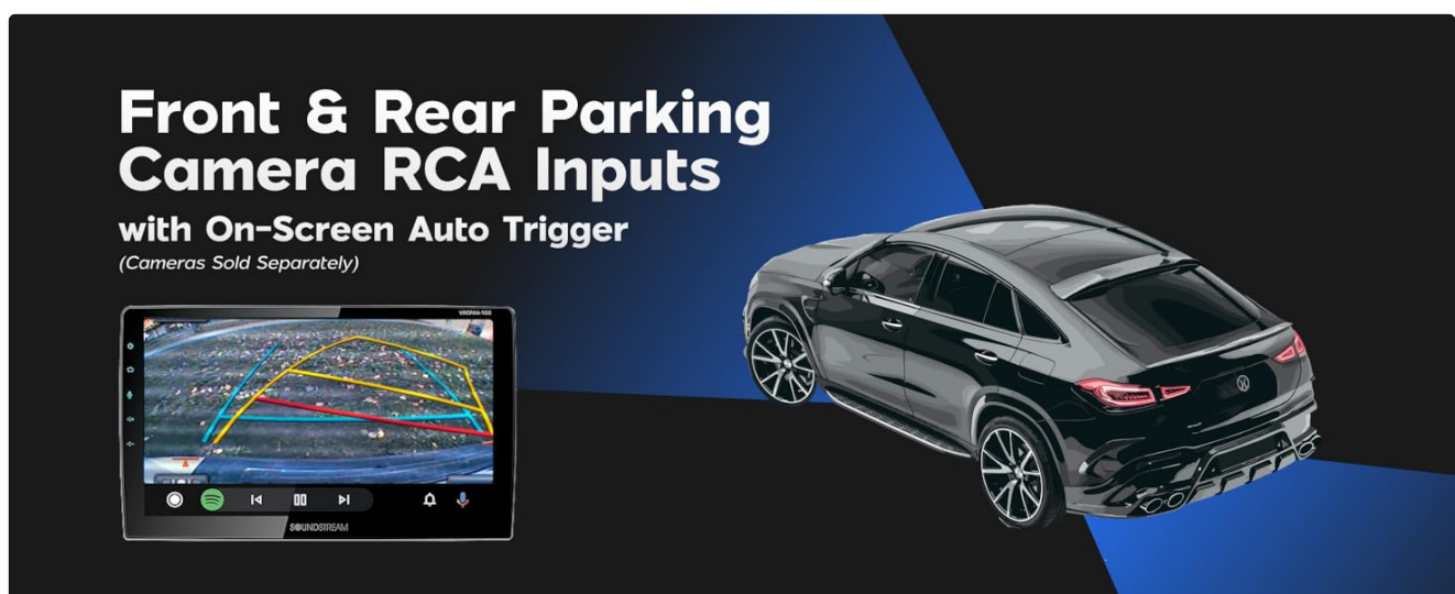
Image: The car stereo display showing the front and rear parking camera RCA inputs feature, with a visual representation of a car and parking assist lines.

Connect compatible front and rear cameras (sold separately) to the dedicated RCA inputs. The unit will automatically switch to the rear camera view when the vehicle is in reverse, providing parking assistance. The front camera can be accessed manually or configured for automatic display in certain scenarios.