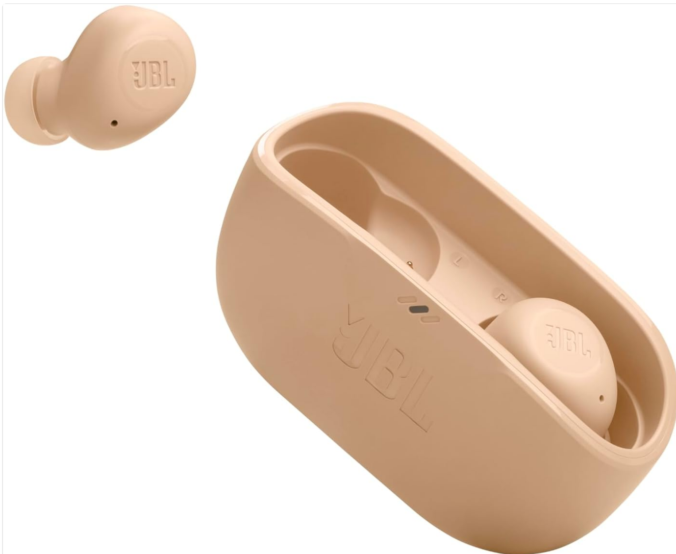
Image: JBL Vibe Buds True Wireless Earbuds in beige, shown with the charging case.