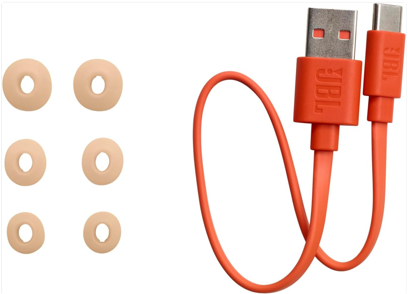
Image: Eartips and charging cable included with JBL Vibe Buds.