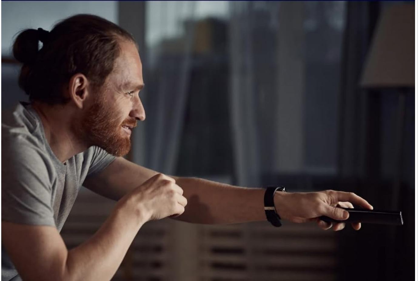
Image Description: A person is shown holding a remote control, focused on a television screen that is not fully visible. Text on the image promotes "Fast and Easy Search" and instructs users to "Search by title, actor or director to see where to stream your favorite shows for free or at the lowest price," demonstrating the TV's content discovery feature.

Search by title, actor or director to see where to stream your favorite shows for free or at the lowest price.