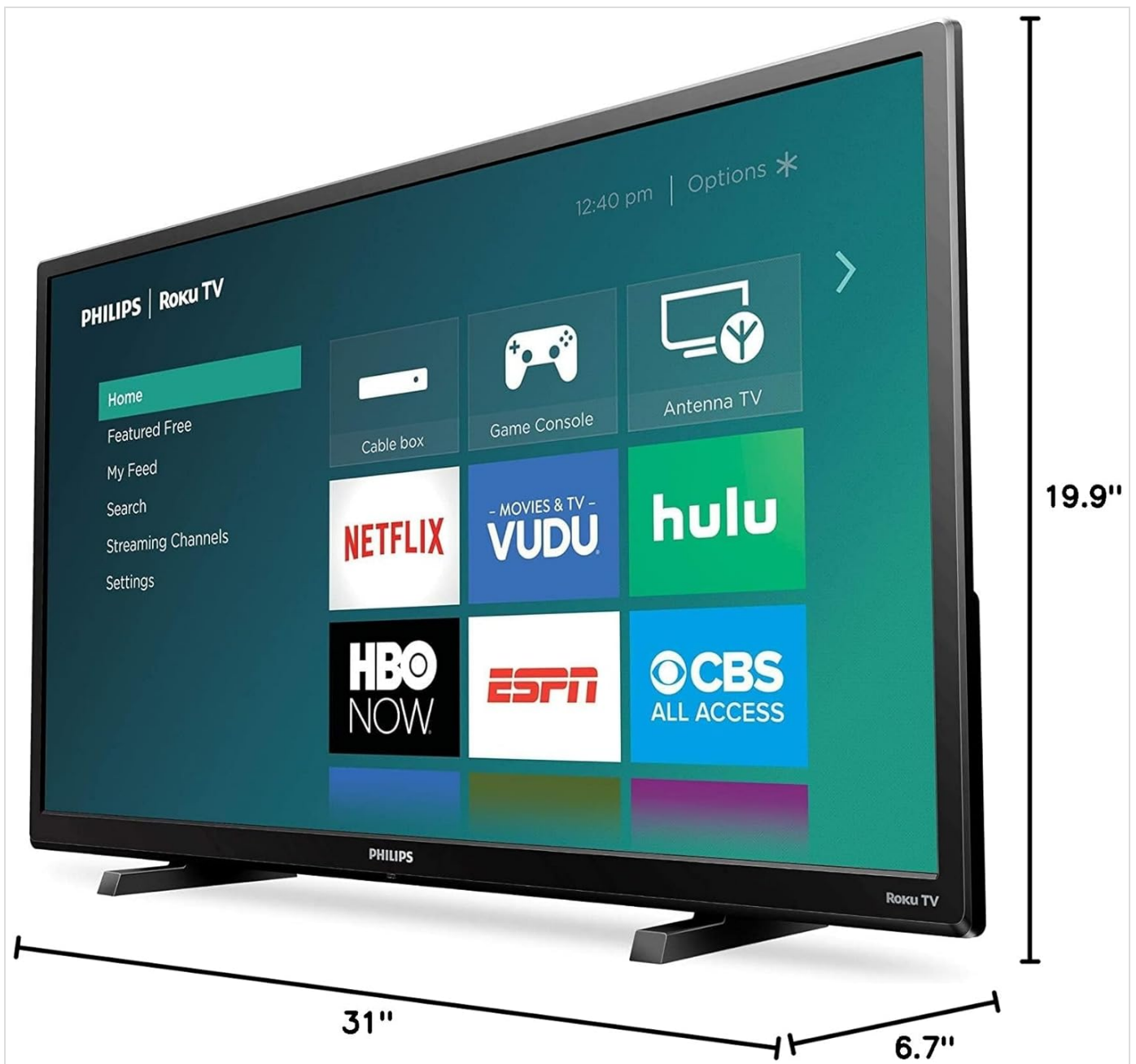
Image Description: A Philips Roku TV is shown with its physical dimensions clearly marked. The width is indicated as 31 inches, the height as 19.9 inches, and the depth as 6.7 inches, providing a visual reference for the TV's size.