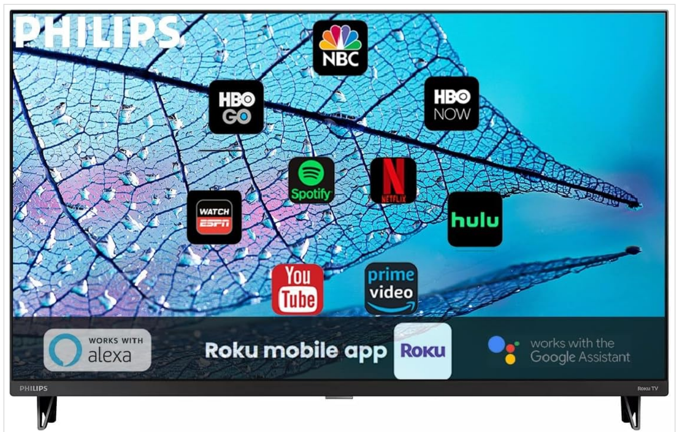
Image Description: The main screen of the Philips Roku TV, showing a vibrant background with water droplets on a leaf. Various streaming application icons are overlaid, including Netflix, HBO GO, YouTube, Prime Video, Hulu, and NBC. Logos for 'Works with Alexa' and 'Works with Google Assistant' are visible at the bottom, indicating smart home compatibility.