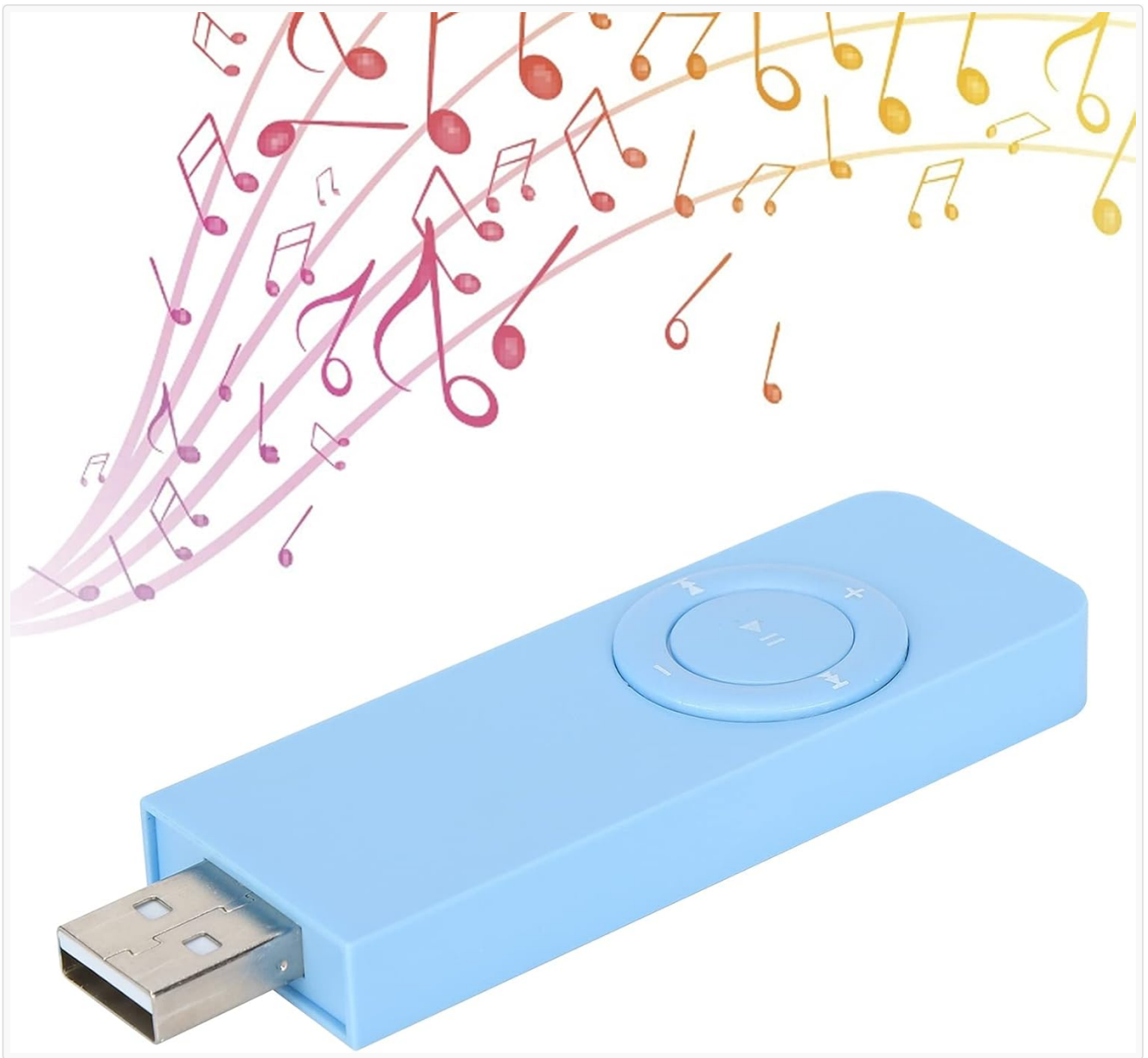
Image: Front view of the MP3 player, highlighting the circular control pad. This includes buttons for Play/Pause, Next Track, Previous Track, Volume Up (+), and Volume Down (-).