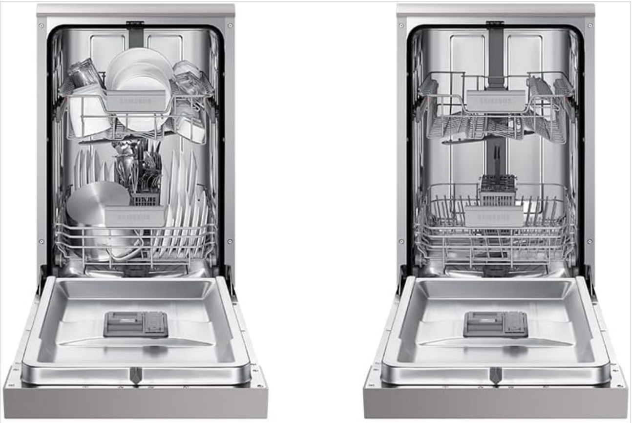
Figure 3: Interior view of the dishwasher with empty racks, showing the flexible loading options.

One of the key features is its quiet operation, producing less than 47 decibels, ensuring minimal disturbance in your home environment.