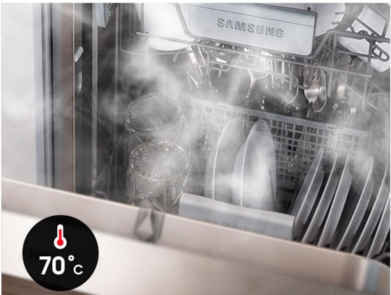
Figure 7: The interior of the dishwasher during a Hygiene cycle, showing steam and the 70°C indicator.