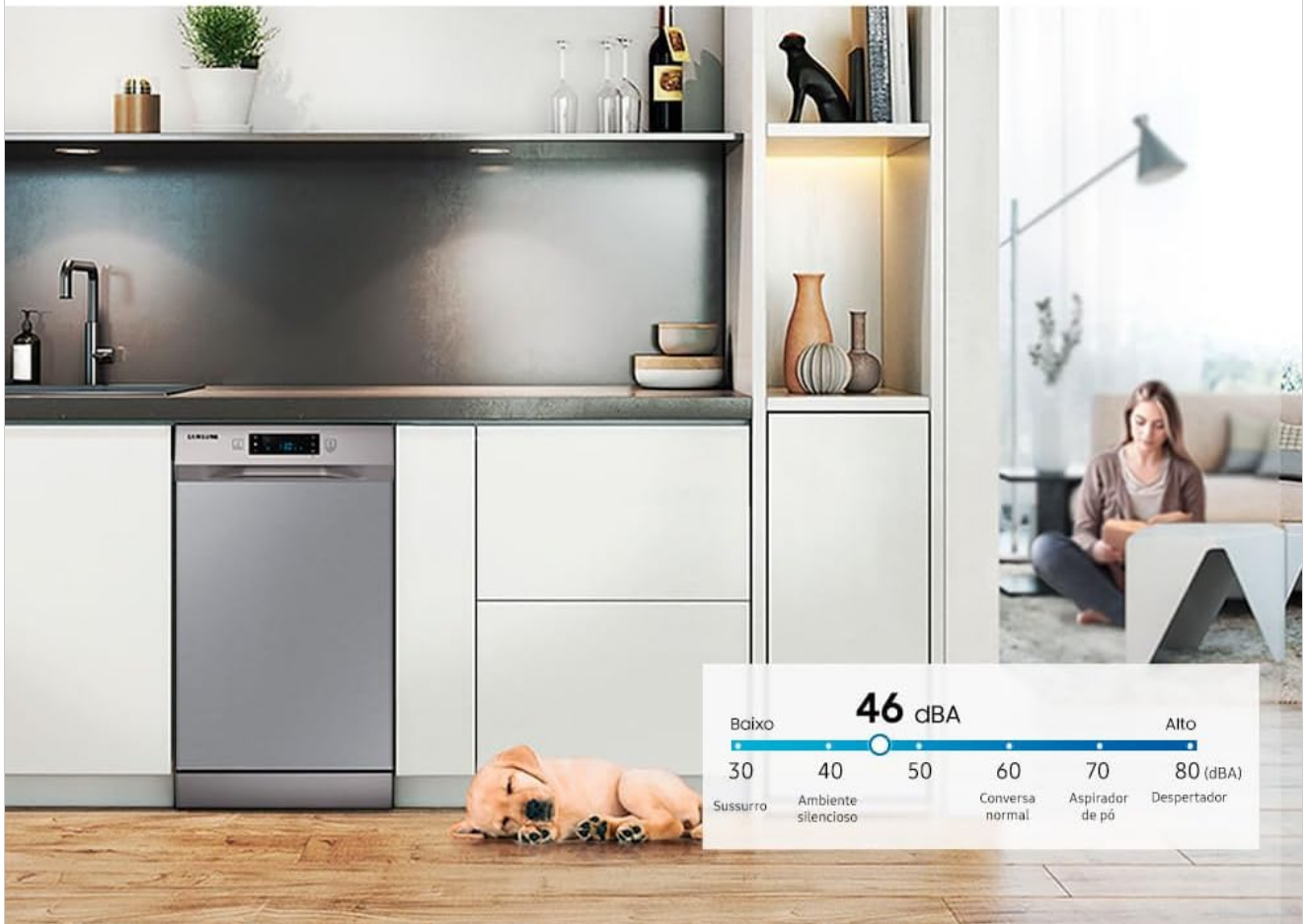
Figure 4: The dishwasher integrated into a kitchen, illustrating its low noise level during operation.

The dishwasher also includes an automatic door opening feature for quick and efficient drying.