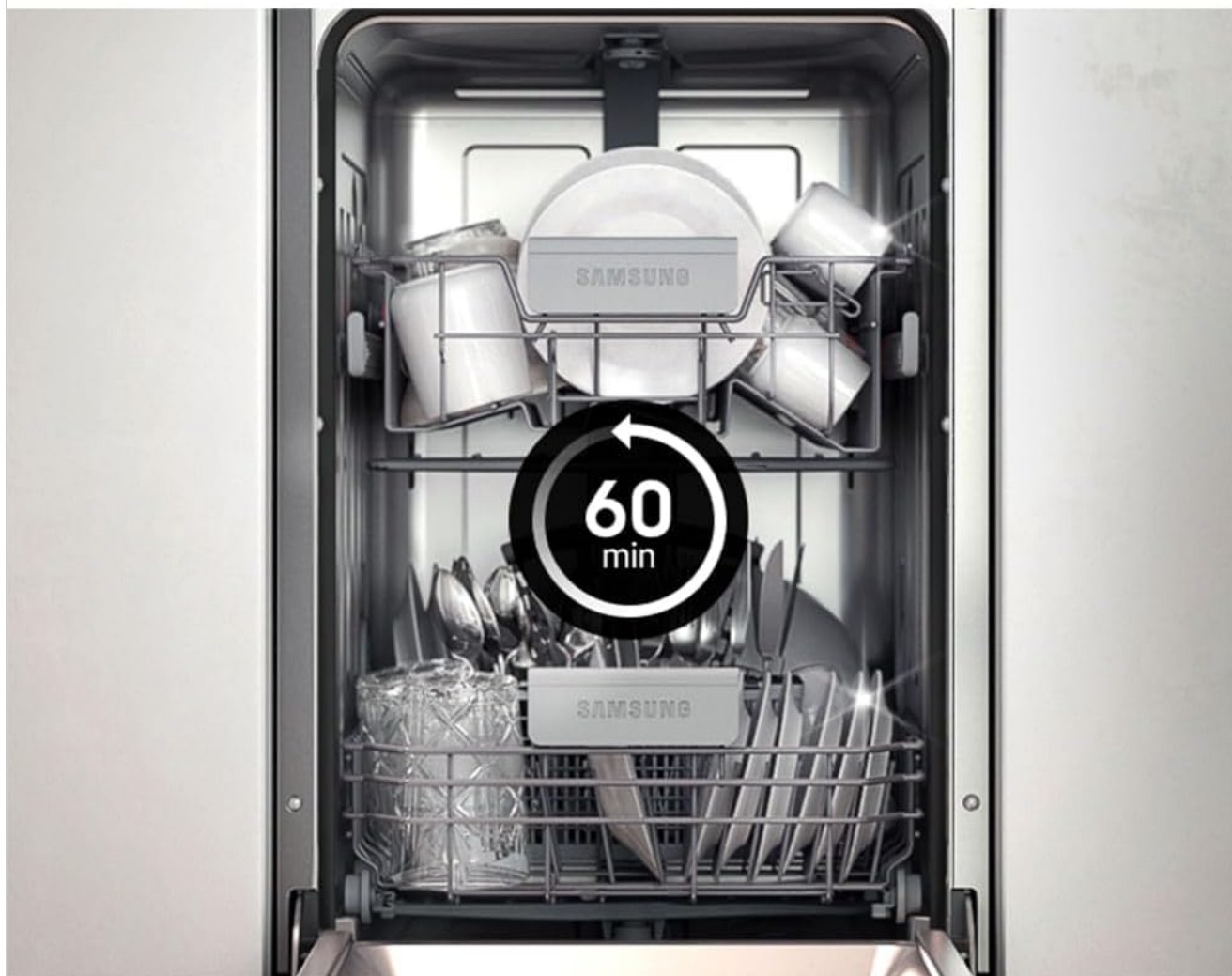
Figure 9: The dishwasher interior indicating the 60-minute Express Cycle for quick washes.