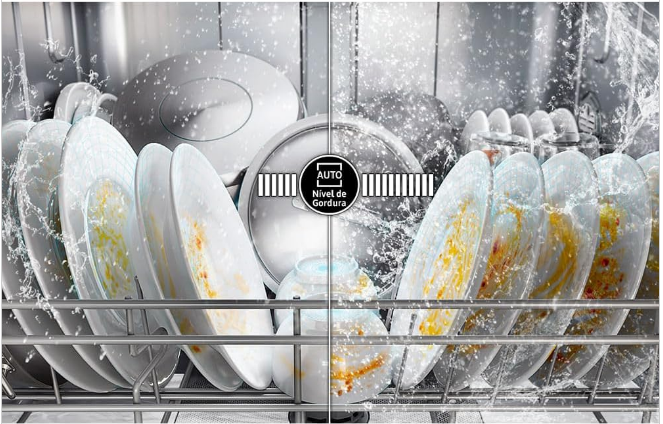
Figure 8: Visual representation of the Auto Cycle function's effectiveness on soiled dishes.