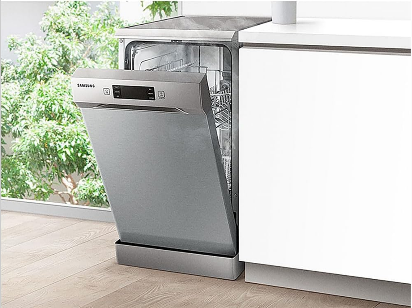
Figure 5: The dishwasher door opening automatically to facilitate drying after a cycle.

The flexible interior allows for easy height adjustment of the upper rack, making space for taller items in the lower rack.