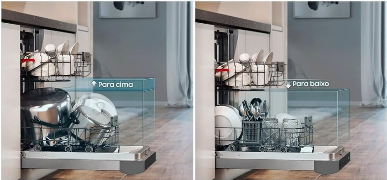
Figure 6: Illustration of the adjustable height feature for the dishwasher racks.