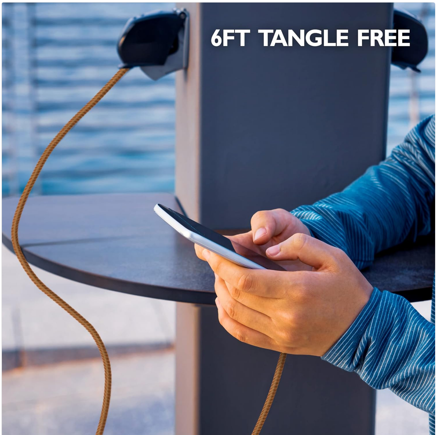
Image: A person using the Celltronix 6FT cable to charge their phone from an outdoor charging station, demonstrating its length and tangle-free design.