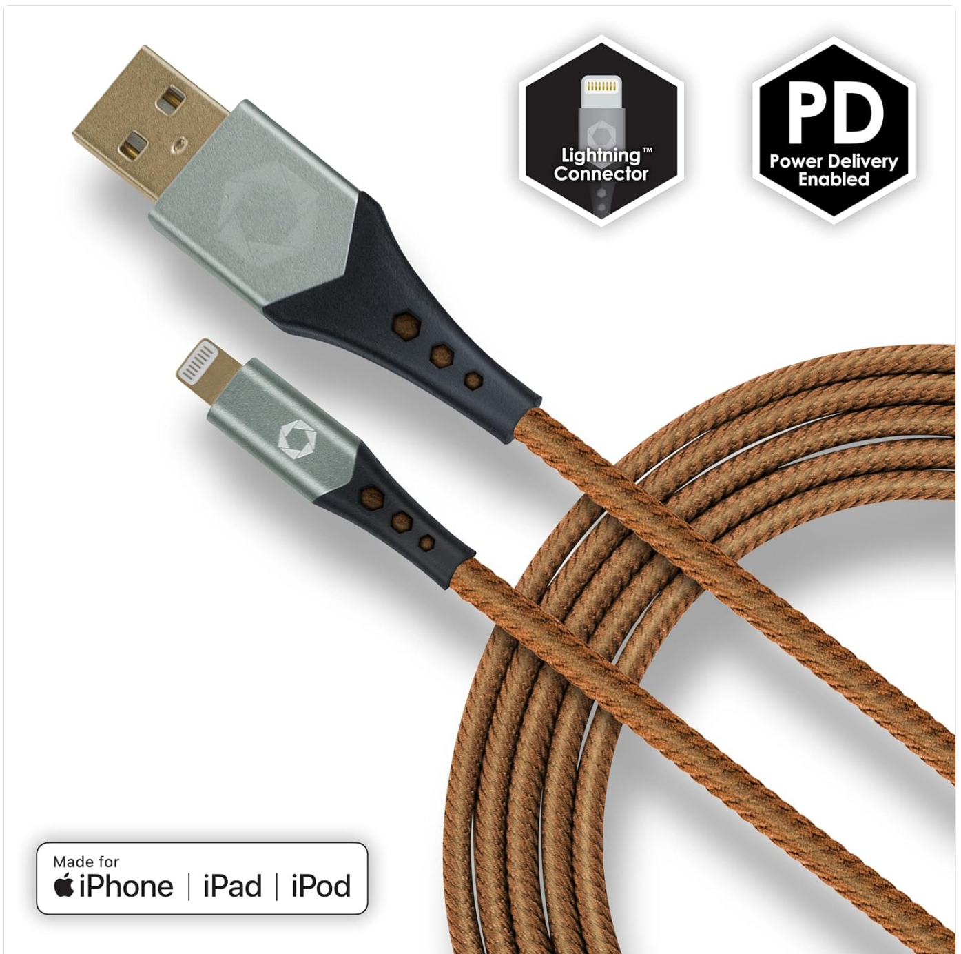
Image: A close-up view of the Lightning and USB-A connectors of the Celltronix cable, showing their design and the braided cable.