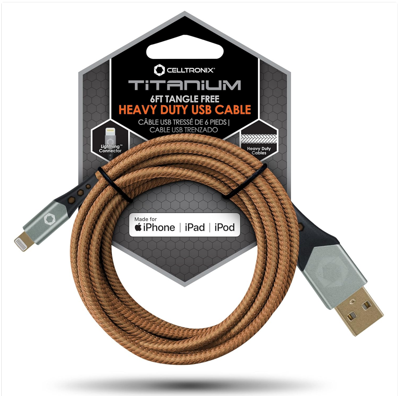
Image: Celltronix Titanium 6FT USB to Lightning Cable in its retail packaging, highlighting its key features and Apple MFi certification.