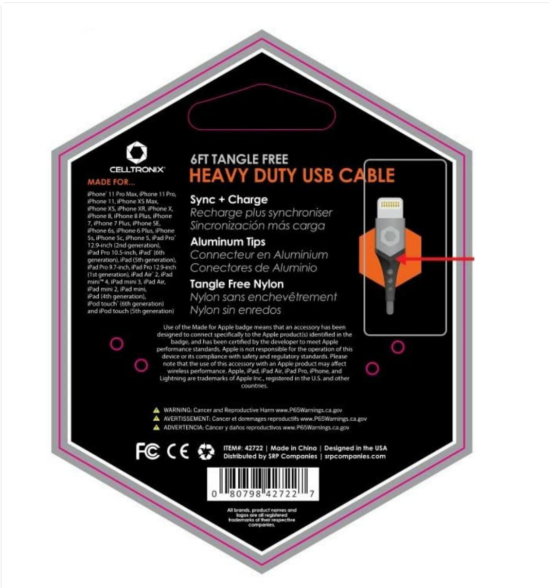
Image: The back of the Celltronix cable packaging, displaying compatibility information, features, and regulatory warnings, including the UPC.