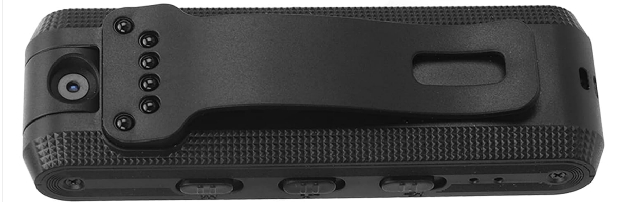
Figure 7: The portable design with a back clip allows for versatile attachment options.