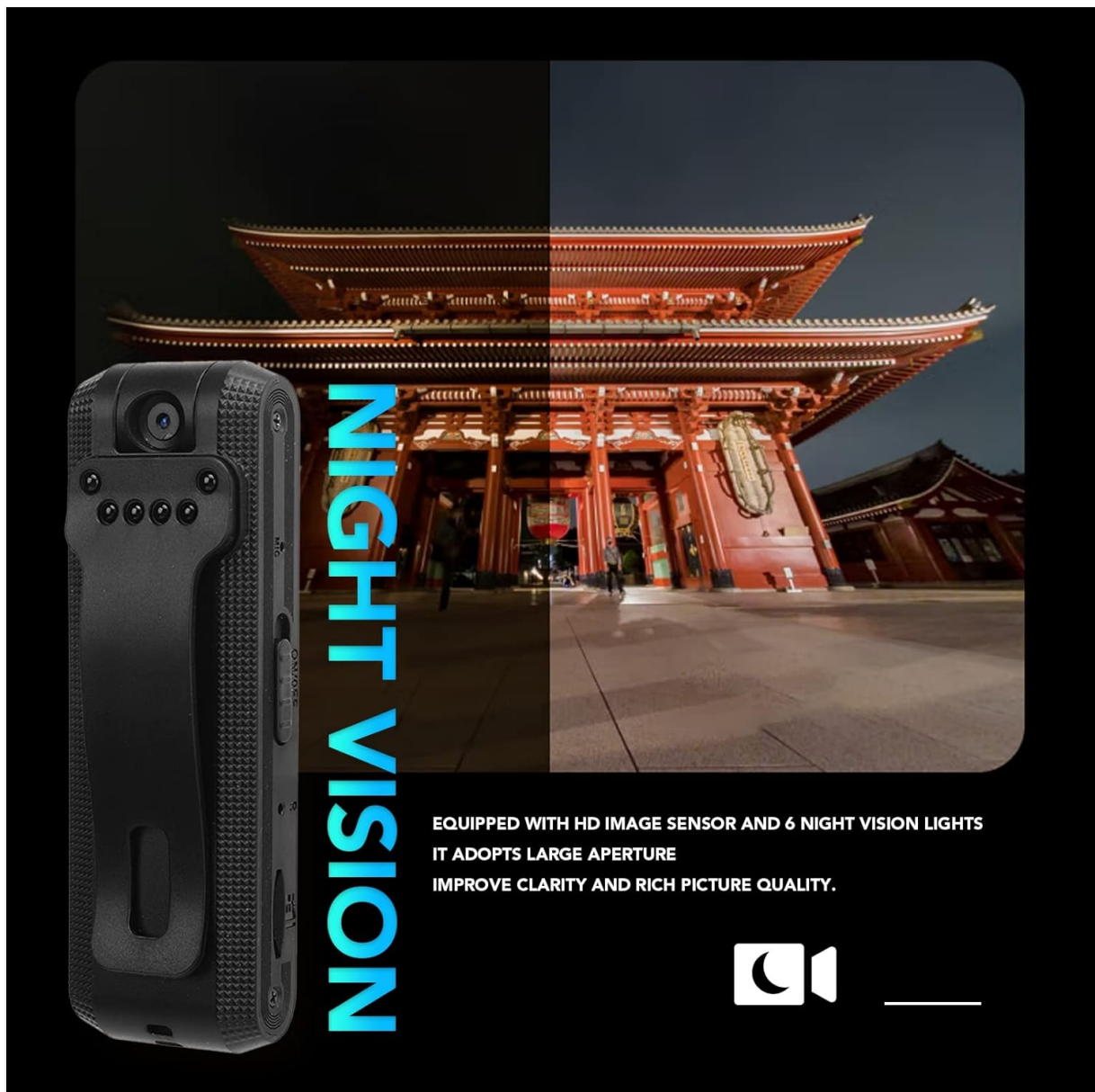
Figure 5: Night vision capability enhances recording in dark environments.

Your browser does not support the video tag.