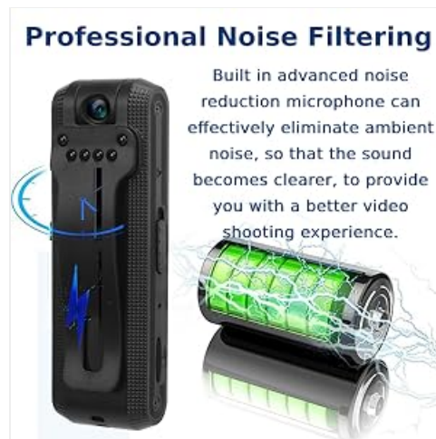
Figure 4: The camera features simple one-button operation for recording and photo capture.

With the camera powered on, press the Power Button once to begin video recording. The indicator light will change to indicate recording is in progress. Press the Power Button again to stop recording and save the file.