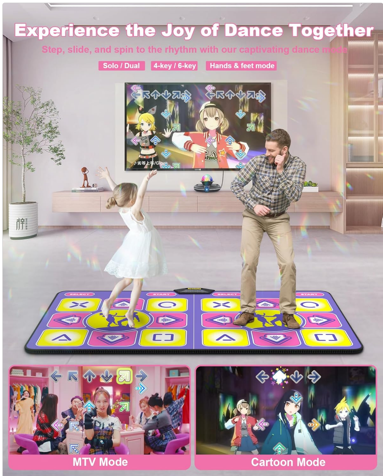
Figure 4.1: Demonstrating the dual dance mode with on-screen prompts.

Video 4.1: Aceluffy PEVA Dance Mat for Kids Girls Boys. This video showcases various dance modes and features of the dance mat, including different game styles and user interaction.