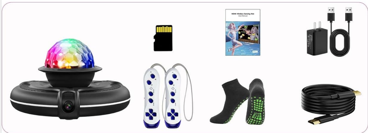
Figure 3.2: Detailed view of the items included in the Acelufly A870II Dance Mat package.