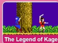
The Legend of Kage