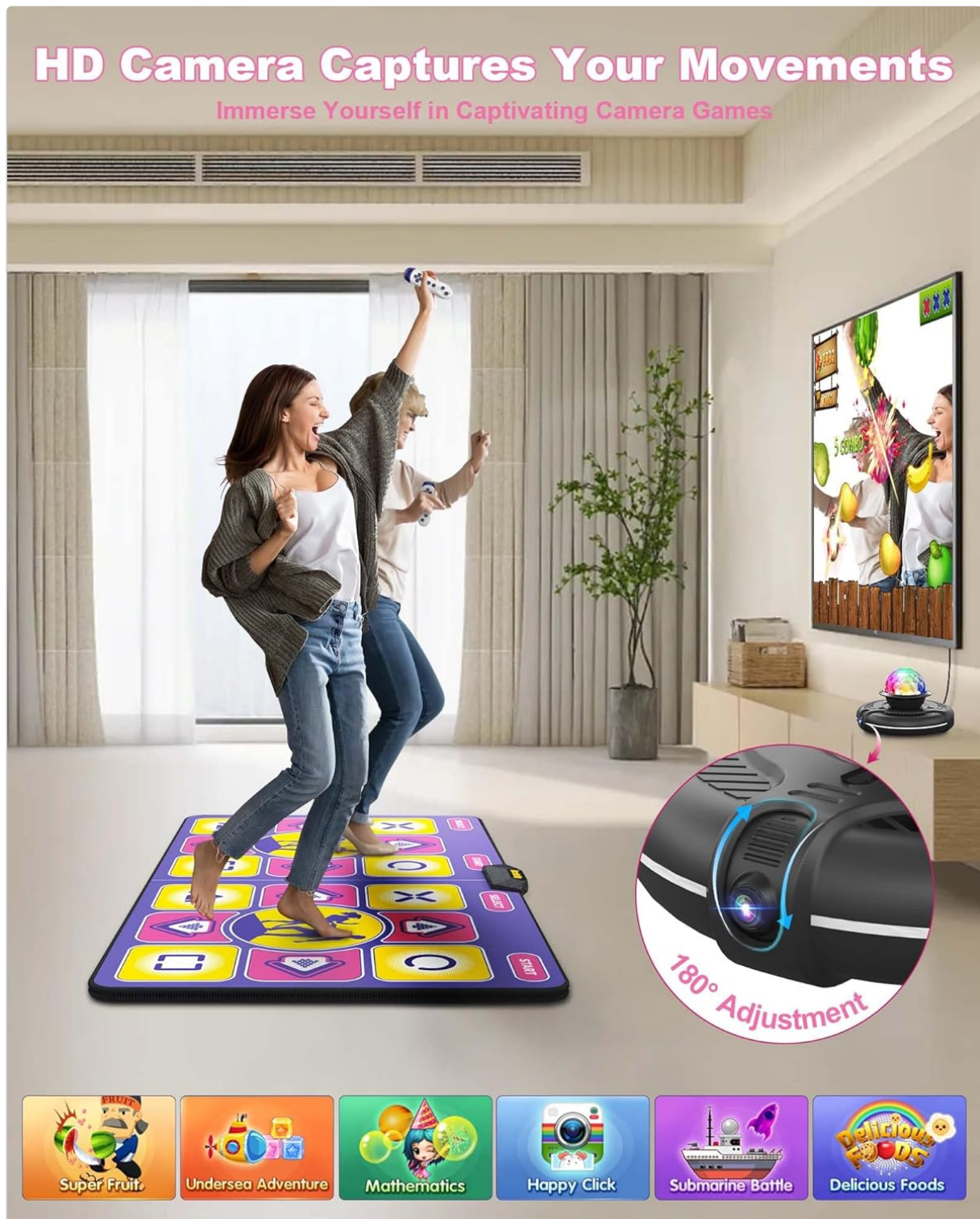
Figure 4.2: Users engaging with camera-based games, demonstrating the motion-sensing capabilities.

Video 4.2: Acelufly PEVA Dance Mat for Kids. This video highlights the camera games feature, showing children interacting with virtual elements on screen.