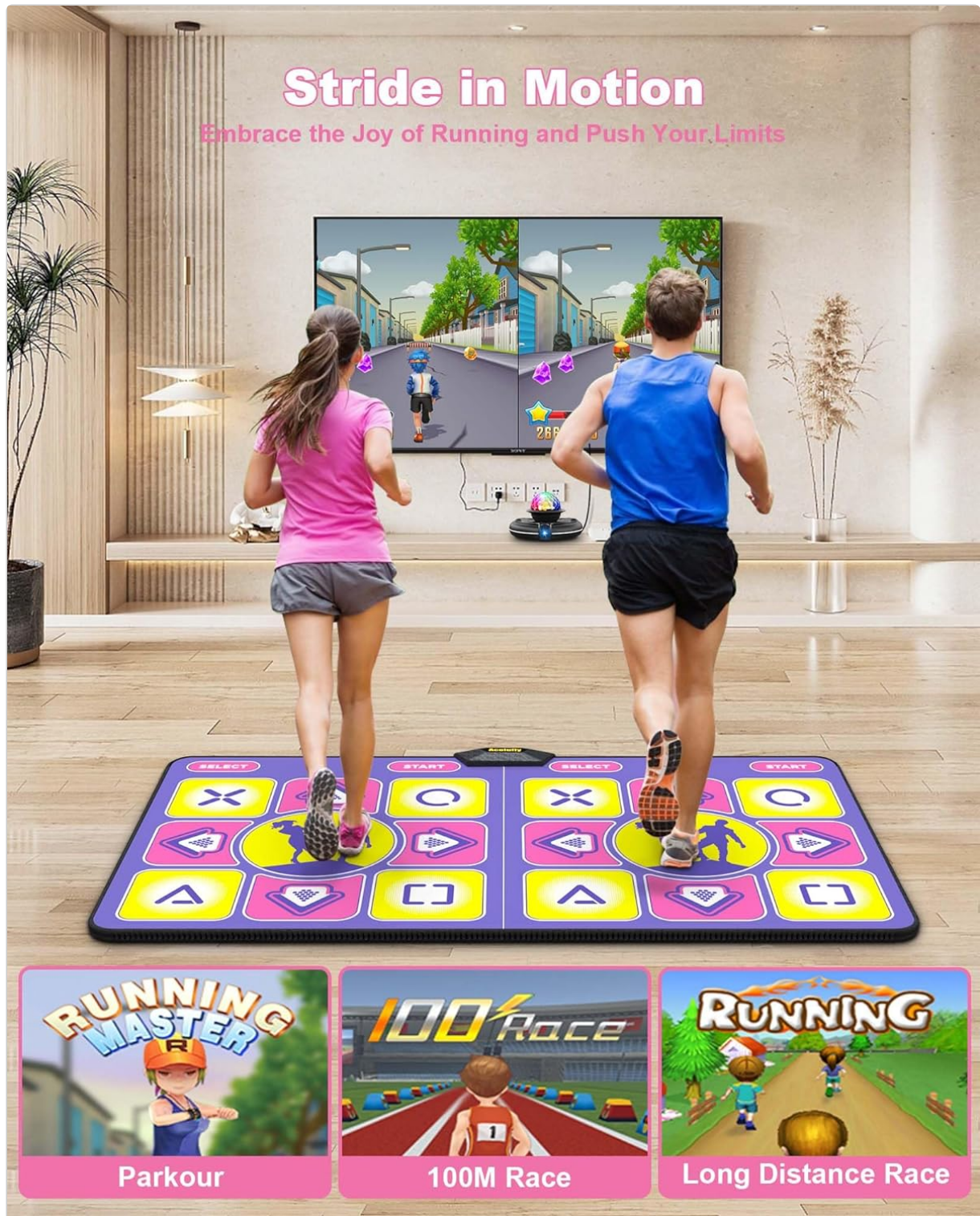
Figure 4.3: Users participating in a running game, utilizing the mat for physical exercise.