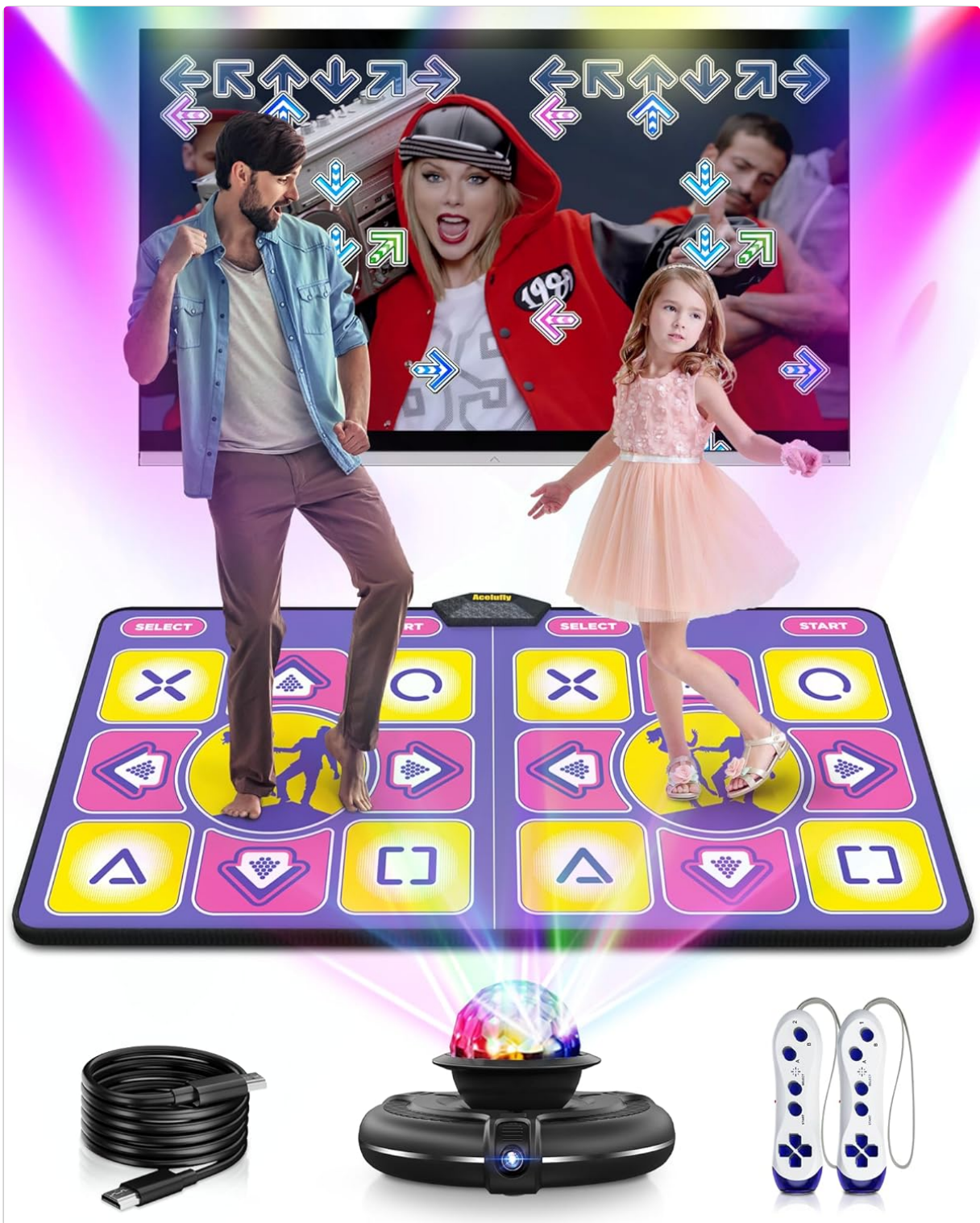
Figure 3.1: Overview of the Aceluffy A870II Dance Mat and its components, ready for setup.