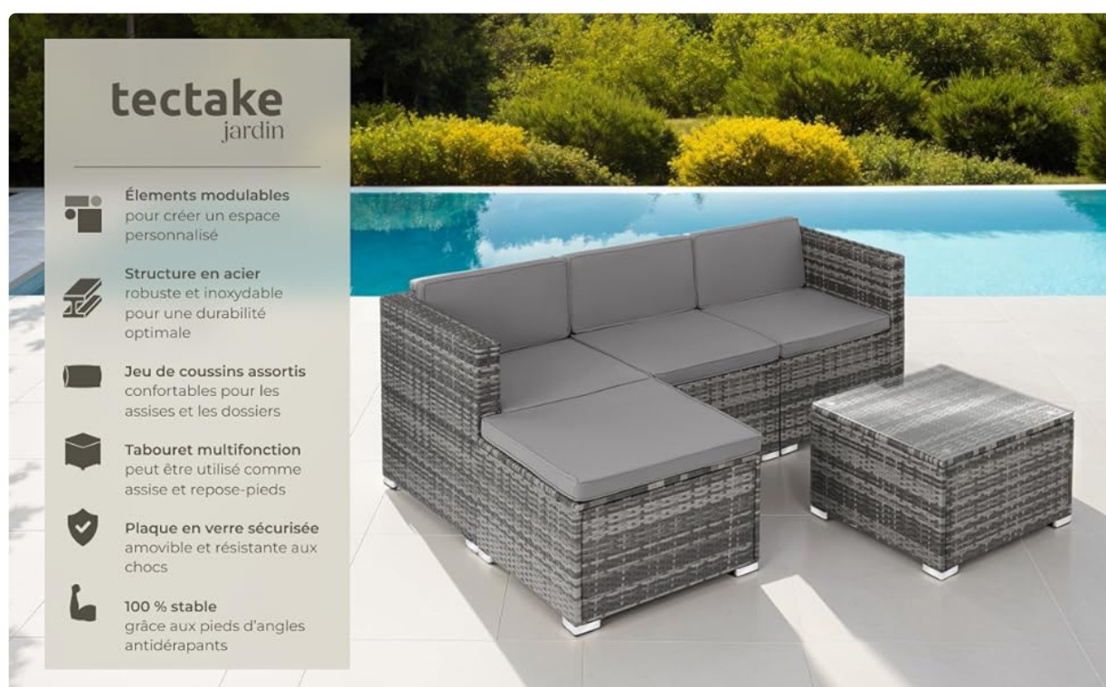
Image: The tectake modular garden lounge set arranged as a sofa with a chaise lounge extension, a separate stool, and a coffee table, set on a patio next to a swimming pool. This image highlights the modularity and aesthetic appeal of the set.