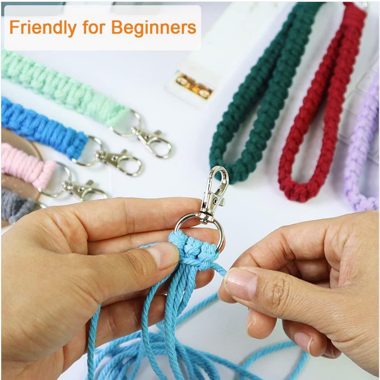
Figure 4.1: Demonstrating a basic macrame knot.