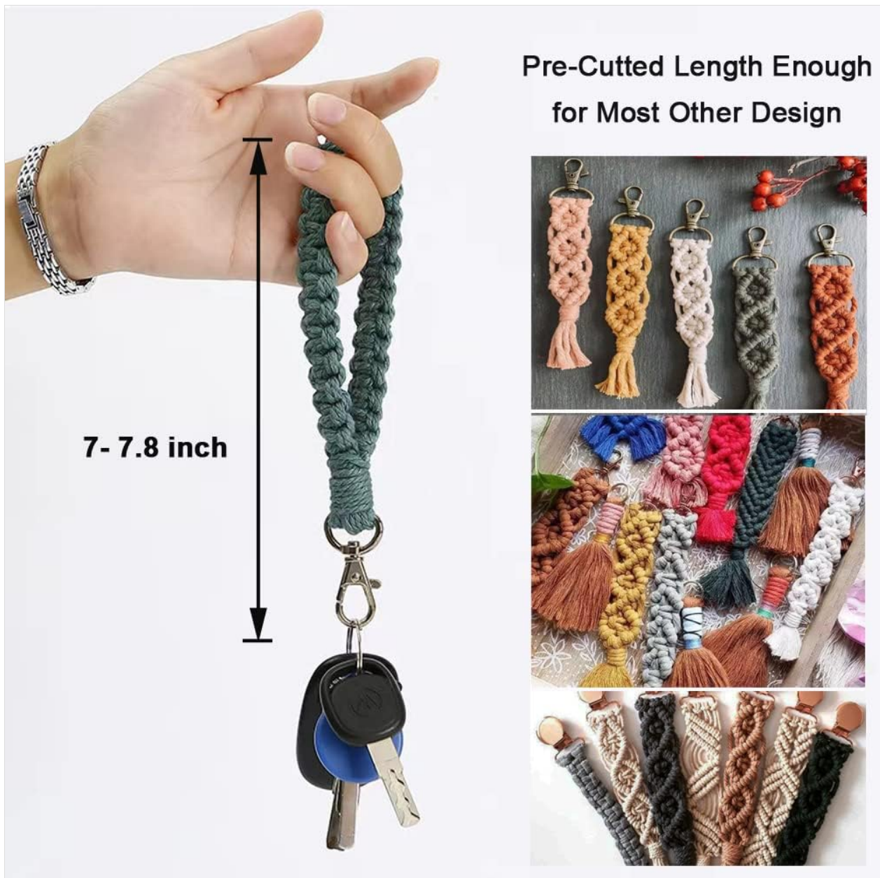
Figure 5.2: A finished macrame keychain in use.