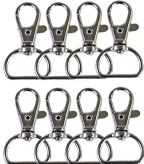
Figure 2.2: Detailed view of yarn and key ring specifications.