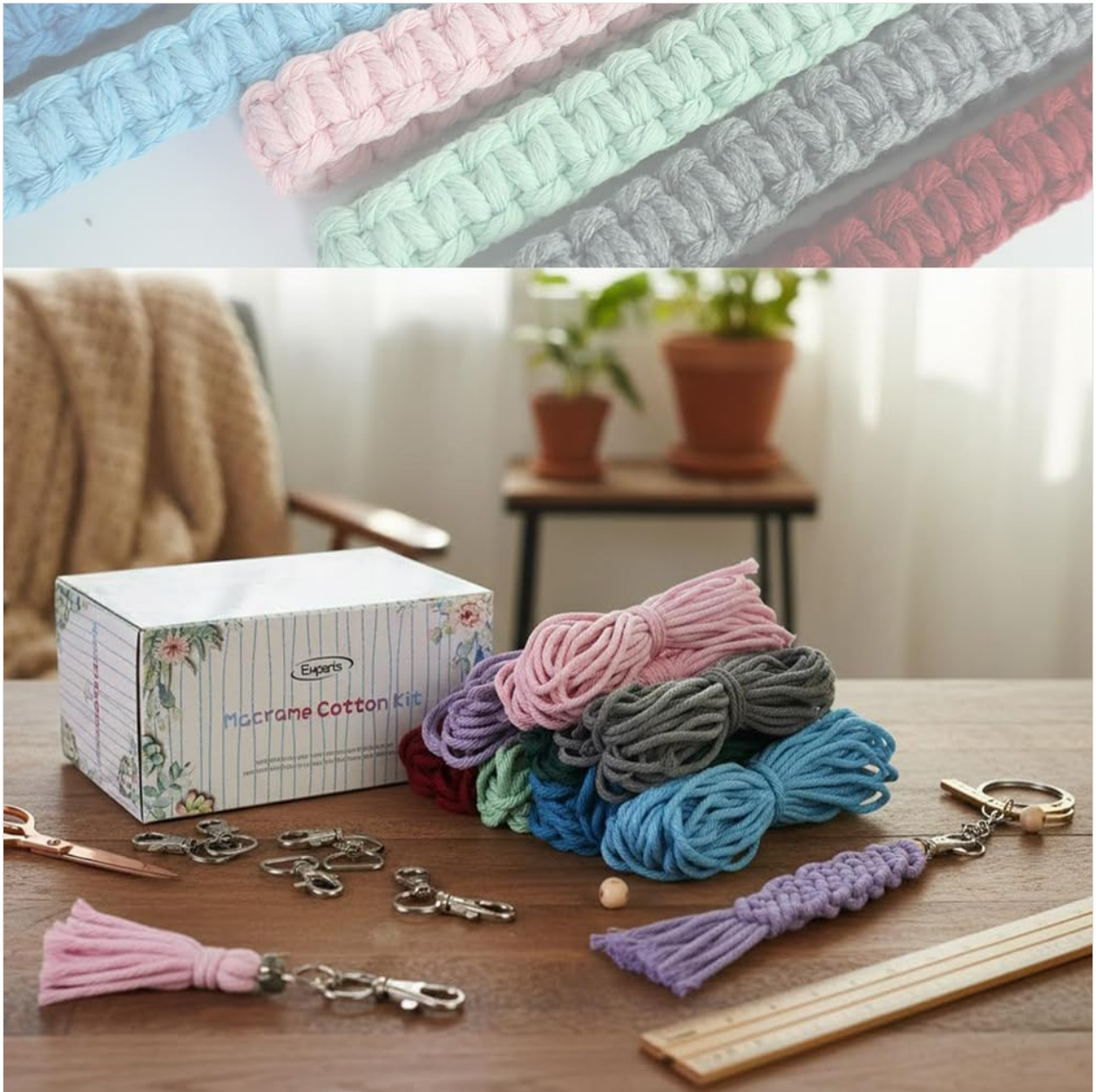
Figure 2.1: Overview of Macrame Keychain Kit contents.