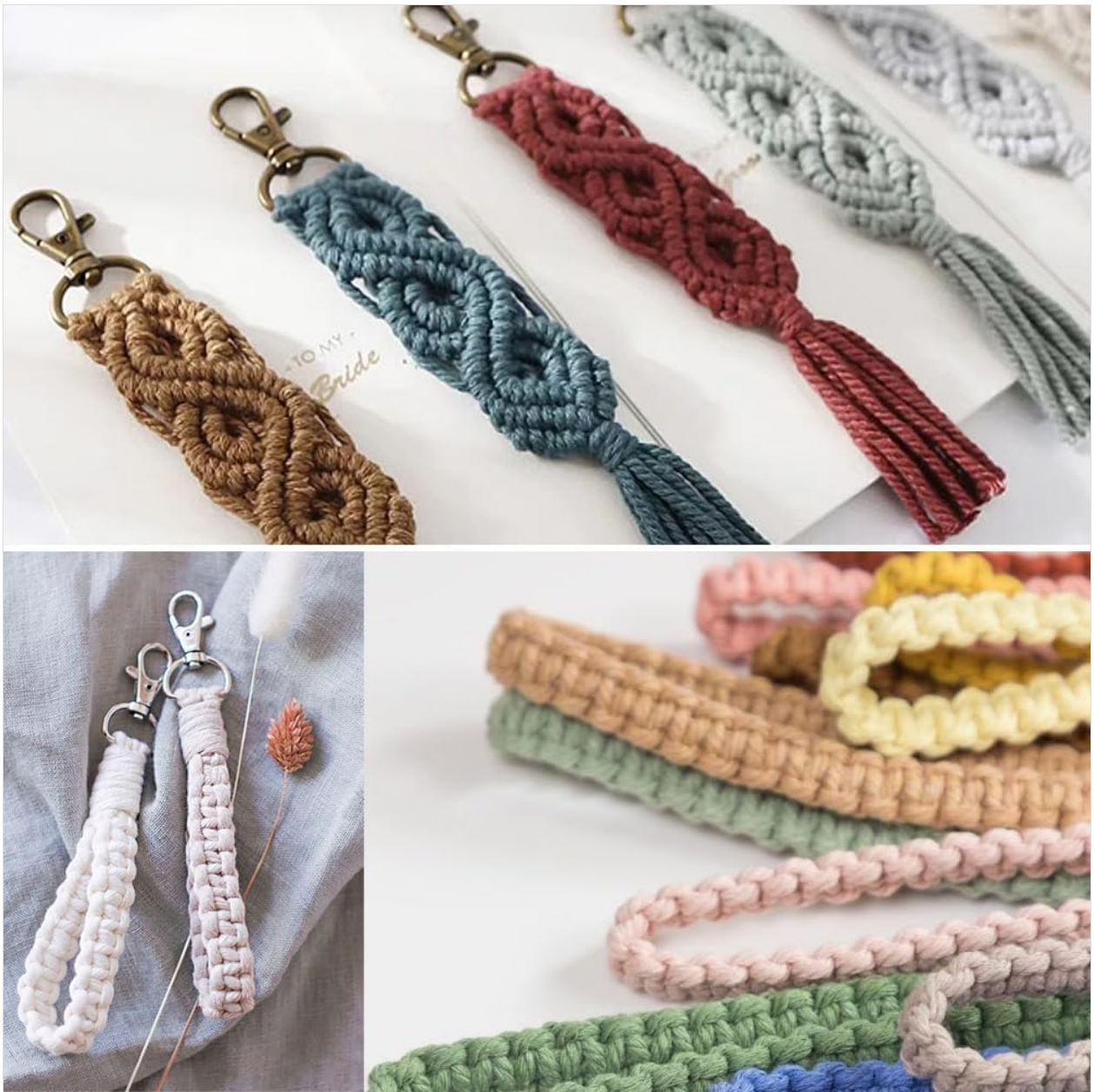
Figure 5.1: Examples of finished macrame keychains.