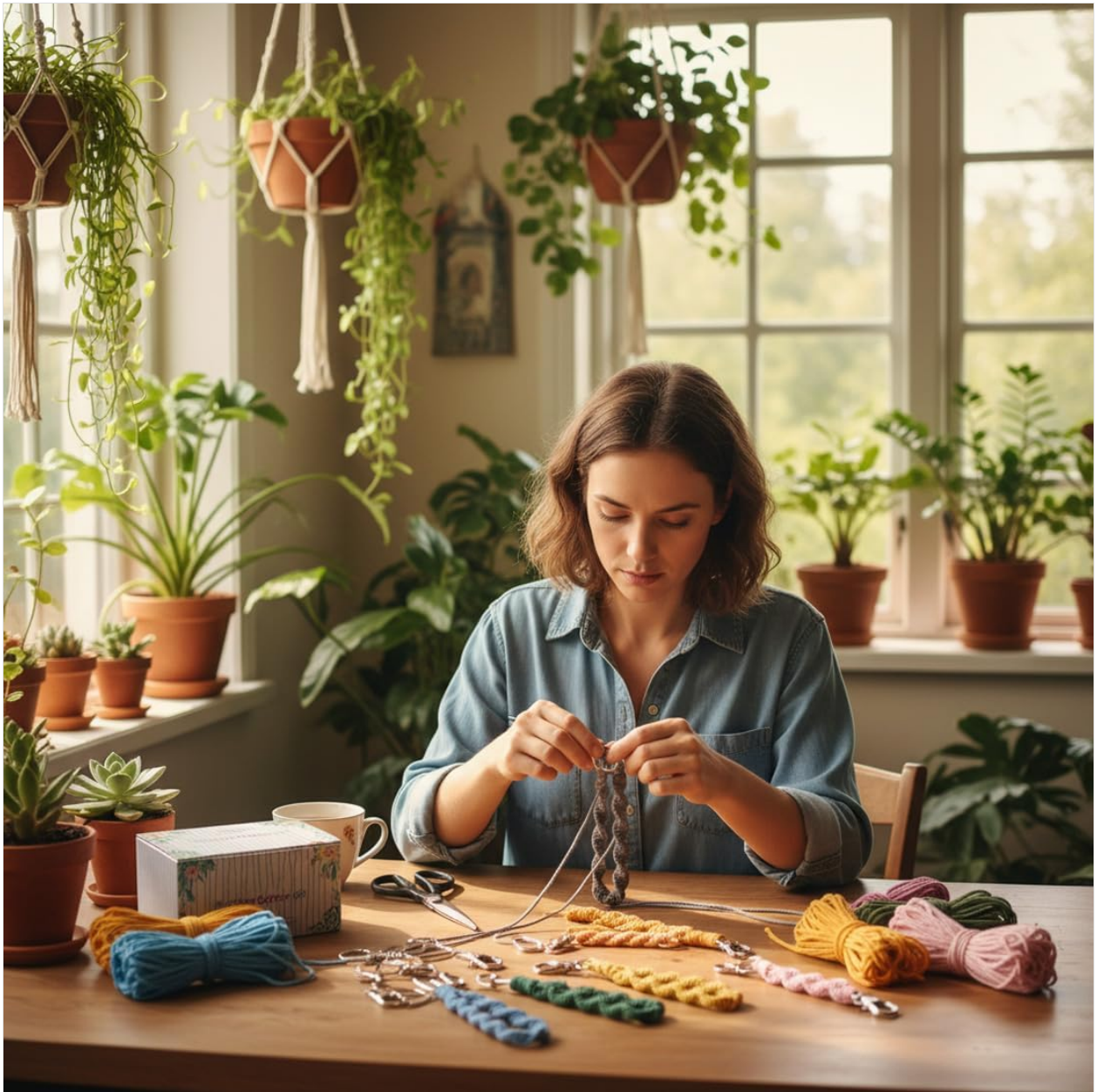
Figure 3.1: Preparing your workspace for macrame crafting.