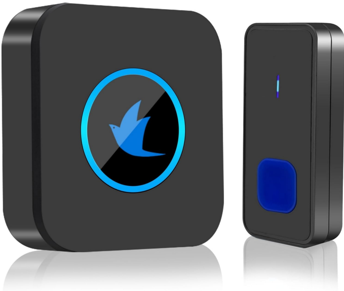
Image: The Nestling Wireless Doorbell Kit, featuring the plug-in receiver and the push-button transmitter.