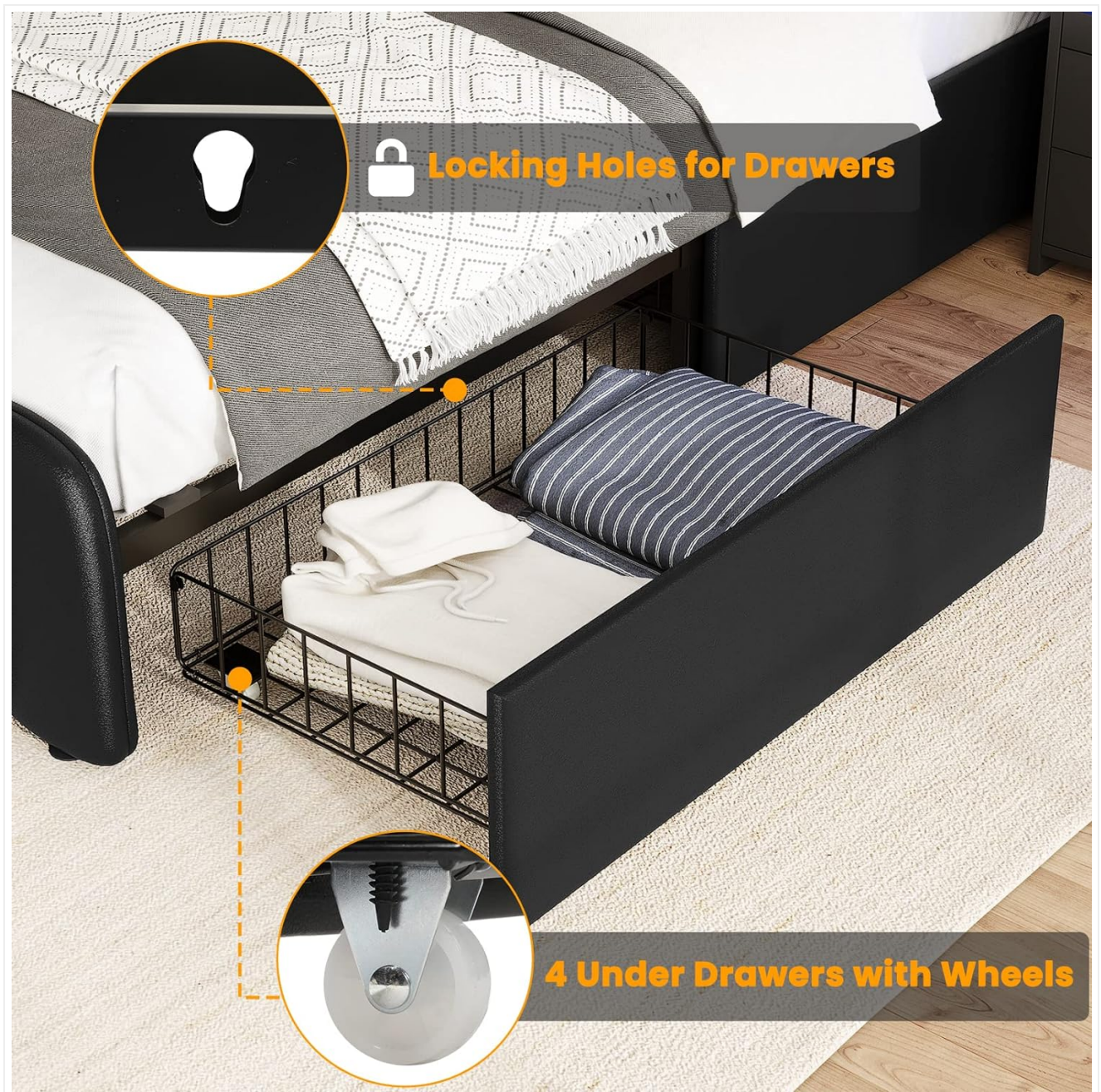
Image 4.2: Detail of a storage drawer showing its wheels and the locking hole mechanism.