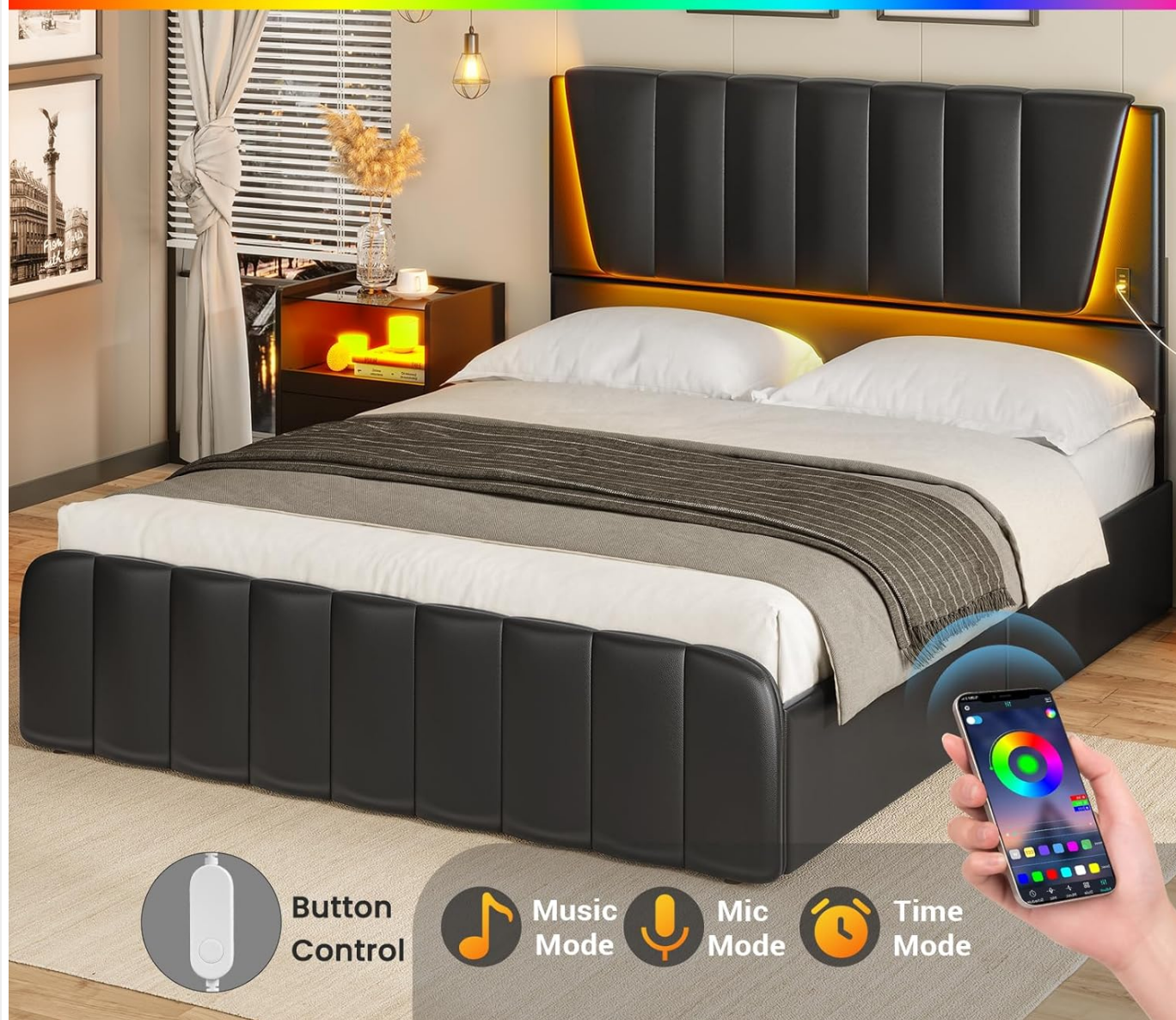
Image 5.1: The LED lighting system can be controlled via a smartphone application, offering various colors and modes.