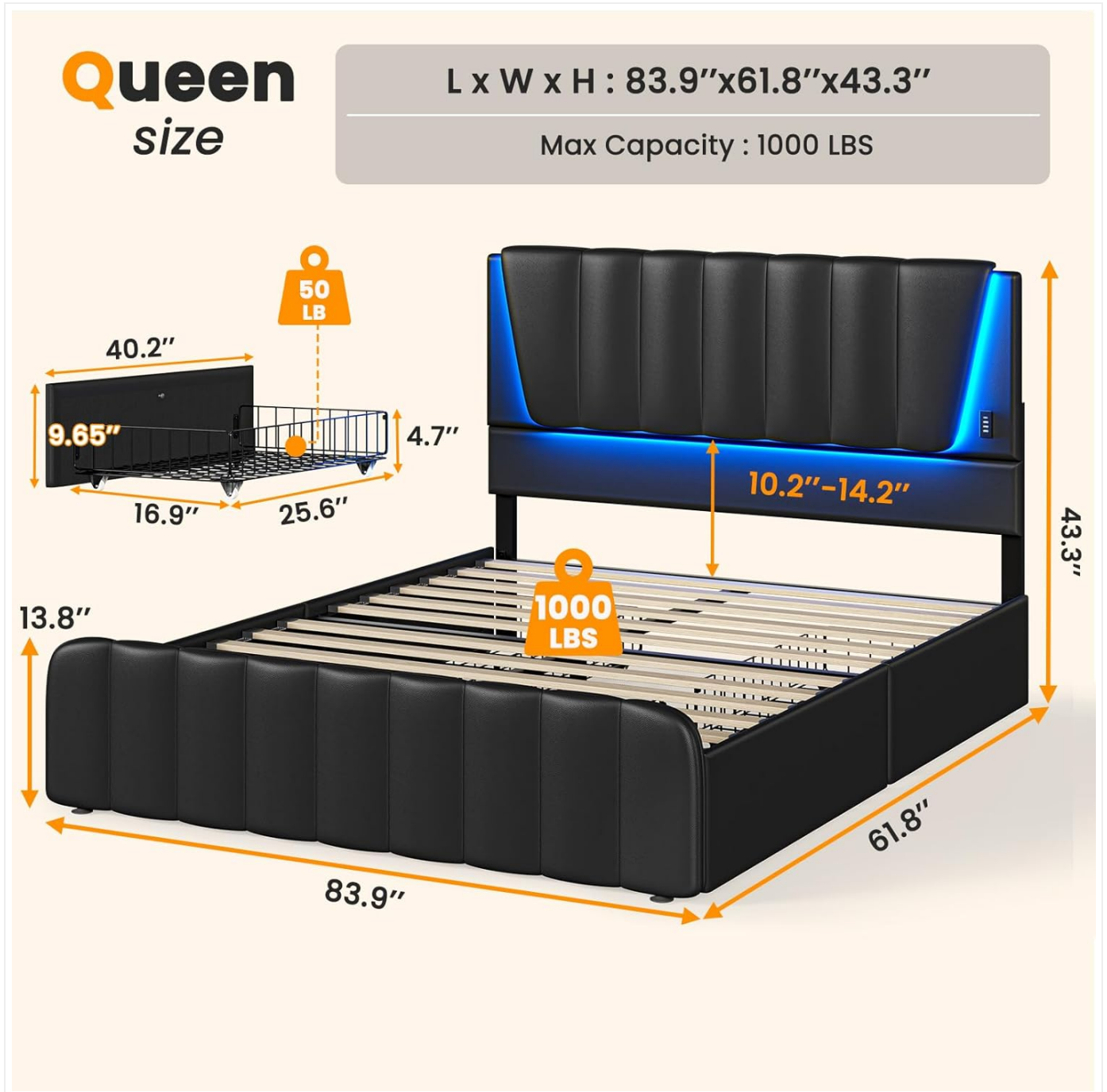
Image 8.1: Detailed dimensions of the Queen size bed frame, including headboard and storage drawer measurements.