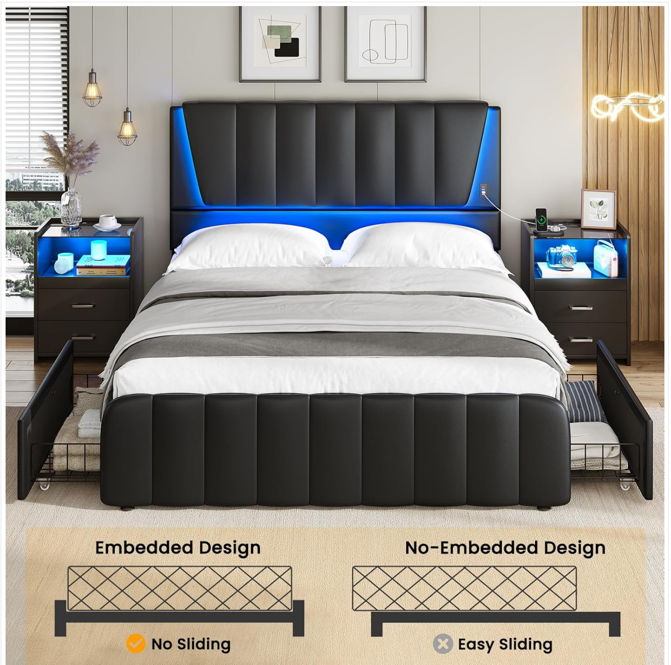
Image 4.1: Illustration of the embedded design for mattress stability, preventing sliding.

5. Assemble Storage Drawers: Assemble the four storage drawers. Attach the wheels to the bottom of each drawer.