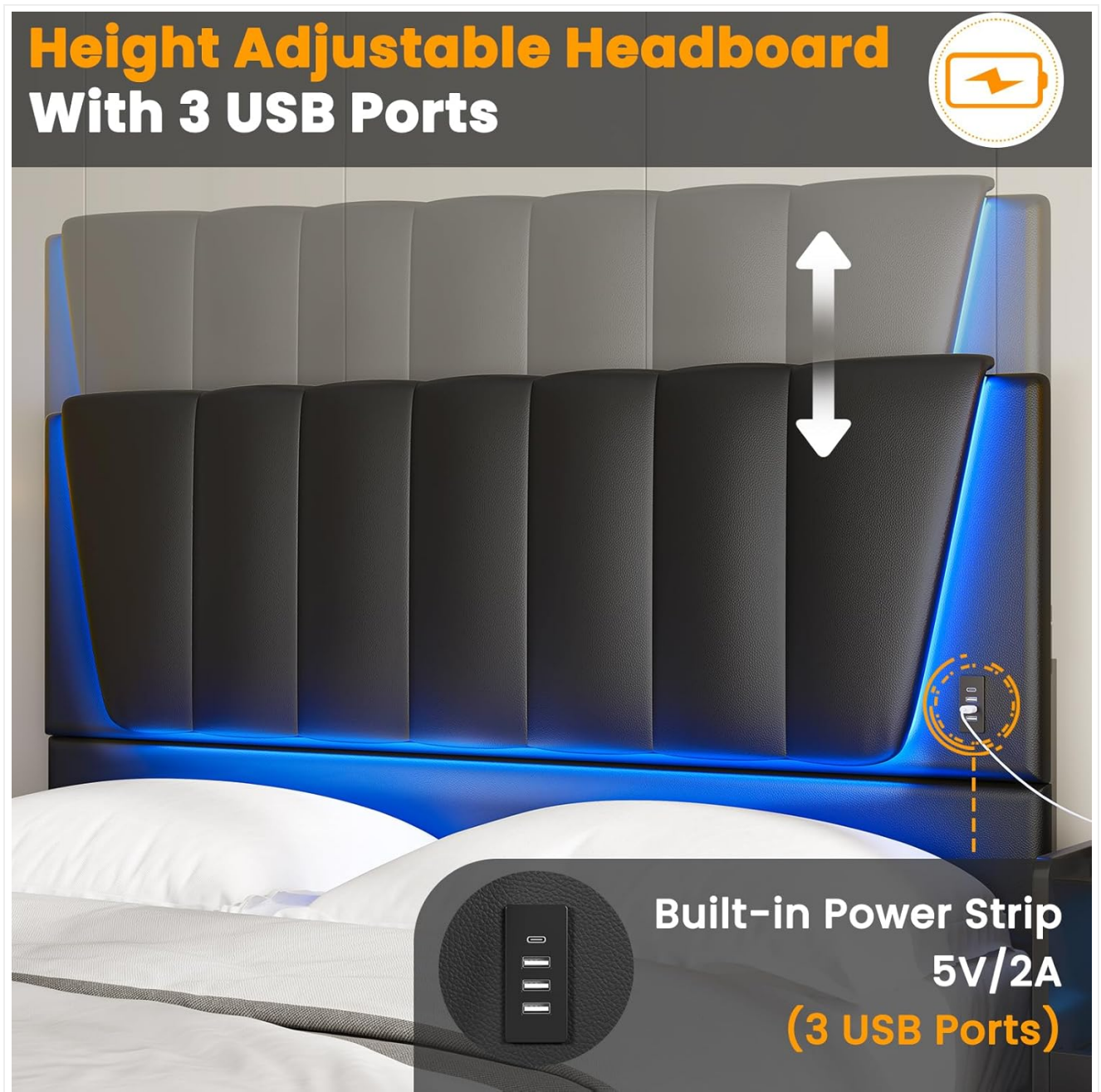
Image 4.3: The headboard can be adjusted to two different heights, featuring built-in USB ports for convenience.