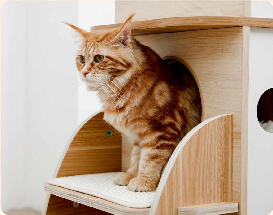
Figure 4: The soft, machine-washable cushions provide comfort and are easy to clean.