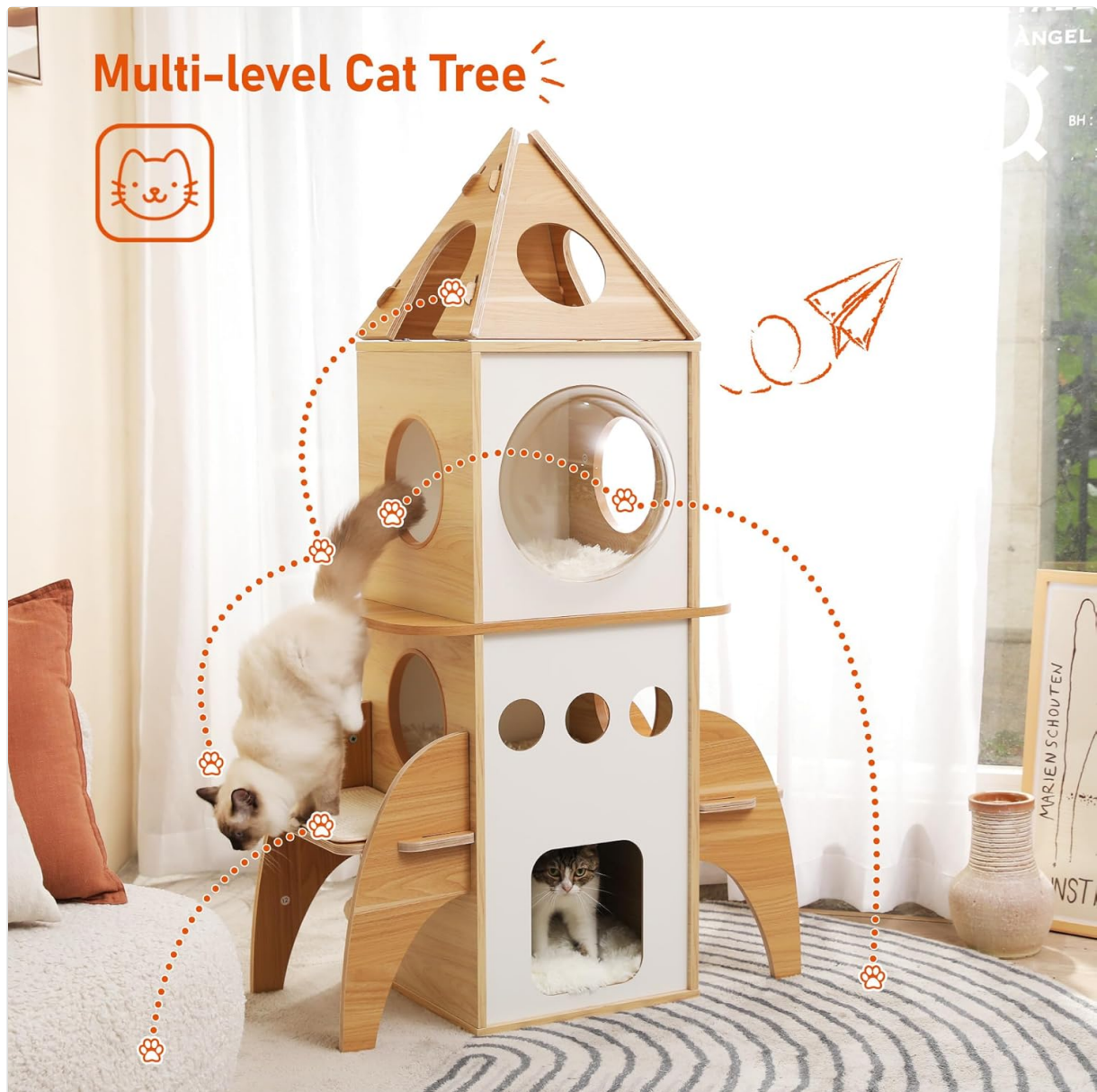
Figure 3: A cat utilizing the multi-level design of the cat tree for climbing and resting.