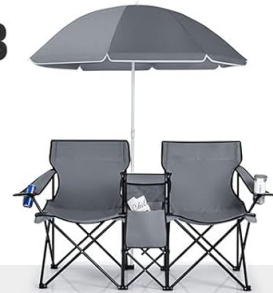
Image: Visual guide for folding and unfolding the chairs, and storing them in the carrying bag.