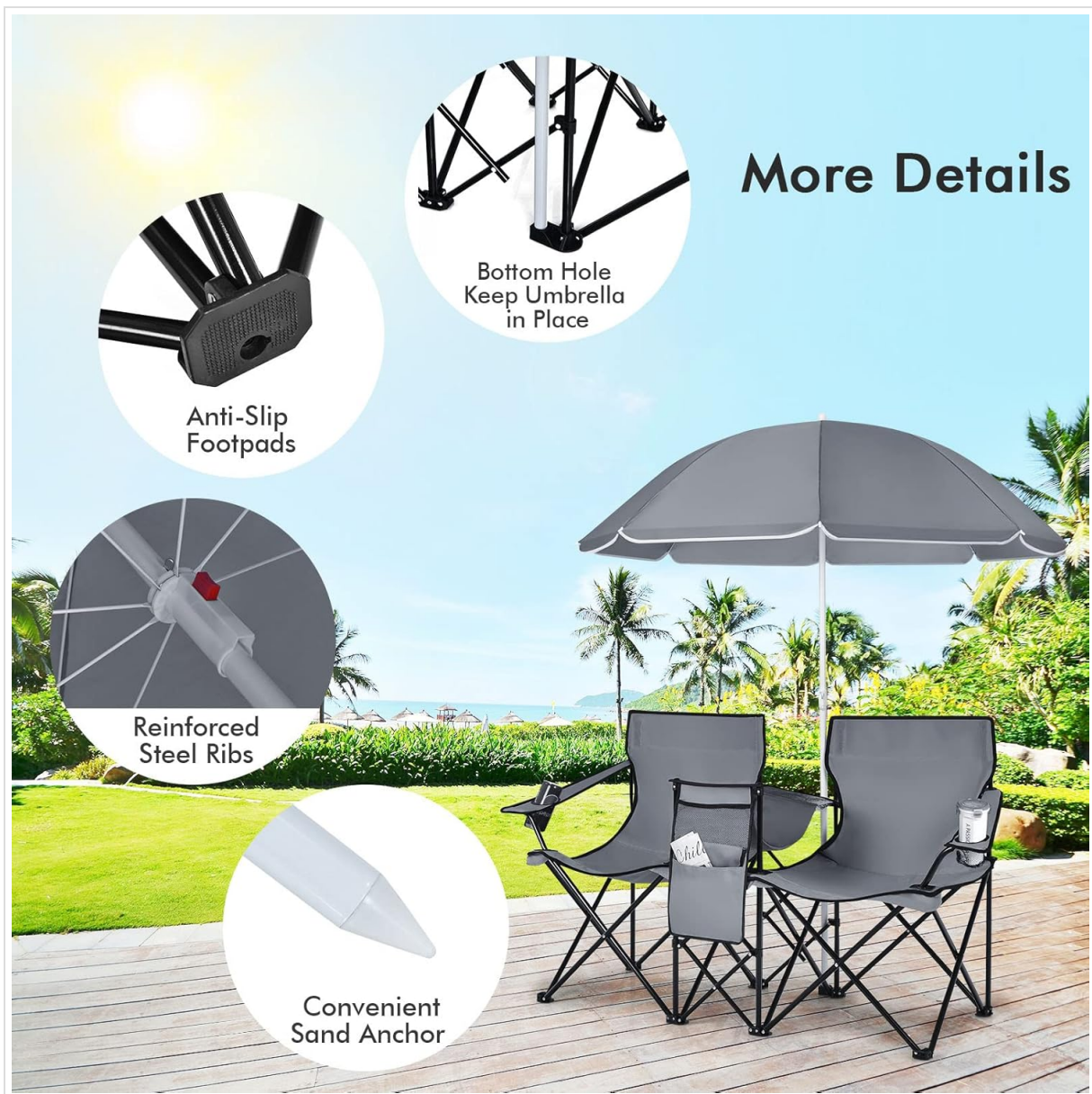
Image: Close-up of anti-slip footpads, reinforced steel ribs, and sand anchor, relevant for stability and durability troubleshooting.