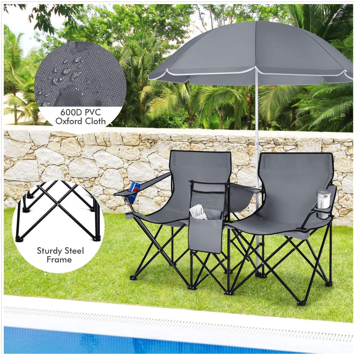
Image: The double picnic chairs in use by a lake, demonstrating their application for outdoor leisure.