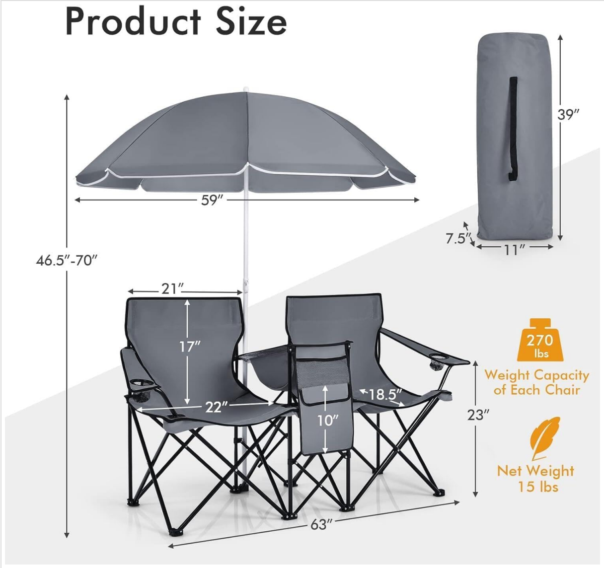
Image: Product dimensions and key specifications diagram.

Note: Slight variations in weight and capacity may occur between product descriptions and diagrams. Refer to the higher value for safety.