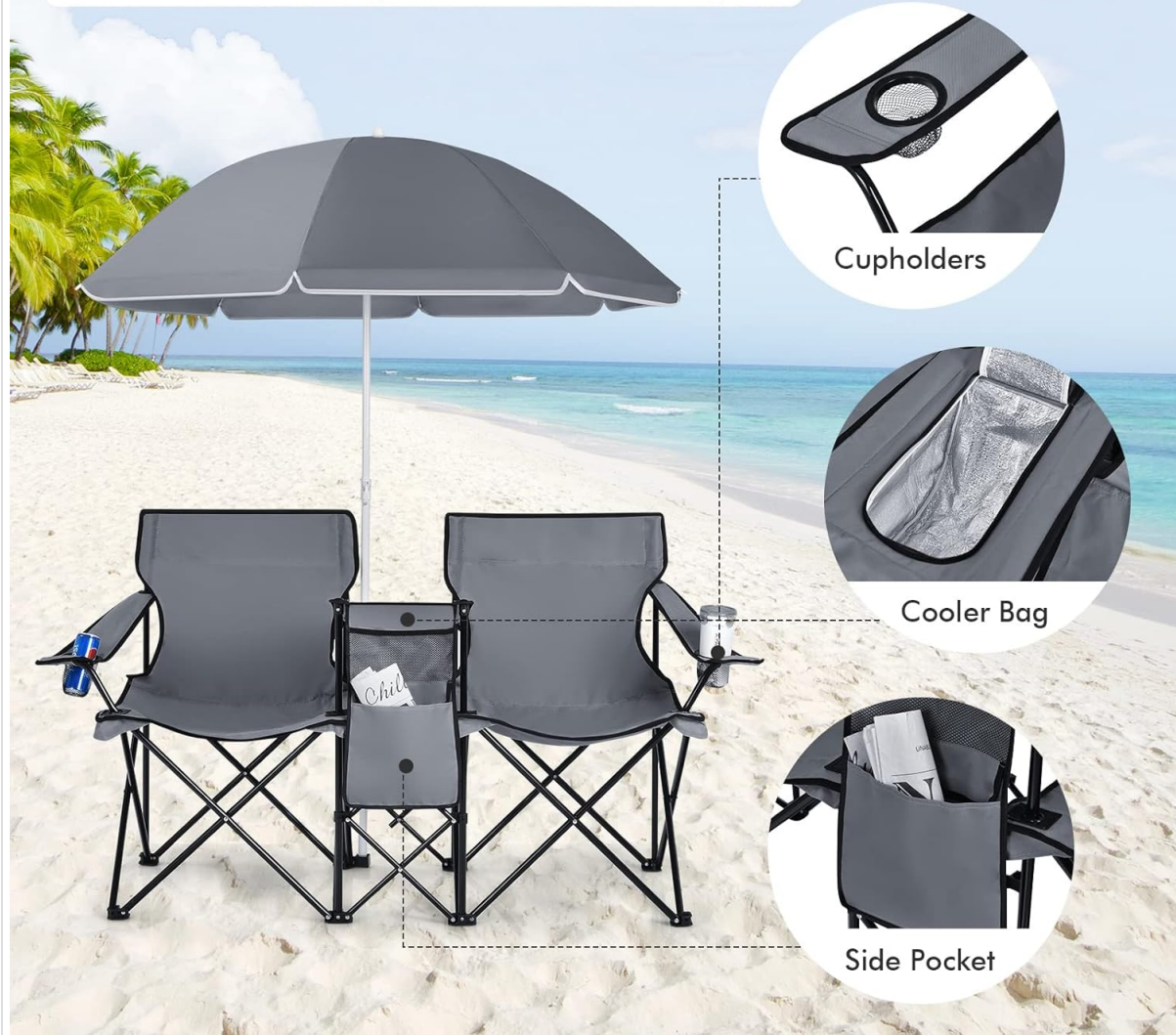
Image: Detailed view of the integrated storage features: cup holders, cooler bag, and side pocket.