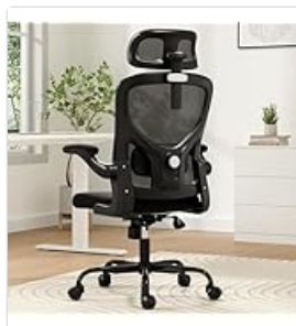
Image: Illustration of the seat height adjustment mechanism, indicating the lever for raising and lowering the chair.

To adjust the seat height, locate the lever on the right side beneath the seat. While seated, pull the lever up to lower the seat. To raise the seat, stand up slightly and pull the lever up. Release the lever at the desired height.