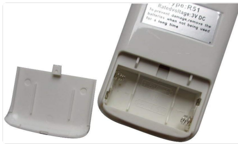
Figure 2: Rear view of the remote control with the battery compartment open, revealing two slots for AAA batteries.