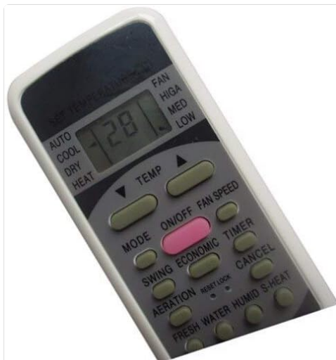
Figure 1: Front view of the remote control, showing the LCD display at the top and an array of control buttons below, including power, mode, temperature, and fan speed controls.

The remote control is a direct replacement, offering full functionality for your compatible KELVINATOR air conditioner unit. It operates using infrared (IR) communication.