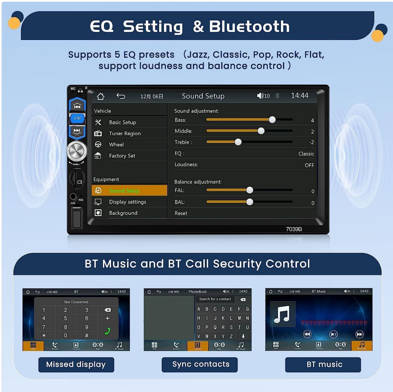
Image 7.1: Screenshot of the Hikity 7039B's interface for Bluetooth music playback, phonebook synchronization, and call management.

Once paired, you can stream audio from your phone to the car stereo. Select "BT Music" from the Bluetooth menu to control playback.