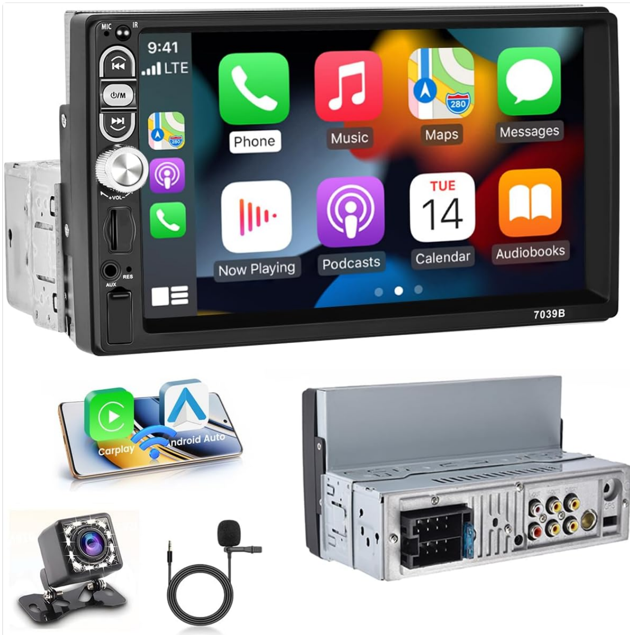
Image 3.1: Front view of the Hikity 7039B car stereo displaying the CarPlay interface, along with the included rear camera, microphone, and a view of the unit's rear connections.