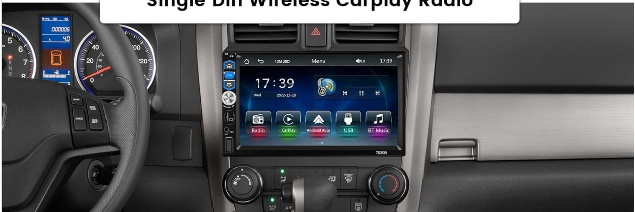
Image 6.1: Visual representation of wireless Apple CarPlay and Android Auto interfaces working with the Hikity 7039B car stereo.

Once connected, you can control compatible apps directly from the car stereo's touchscreen or via voice commands.