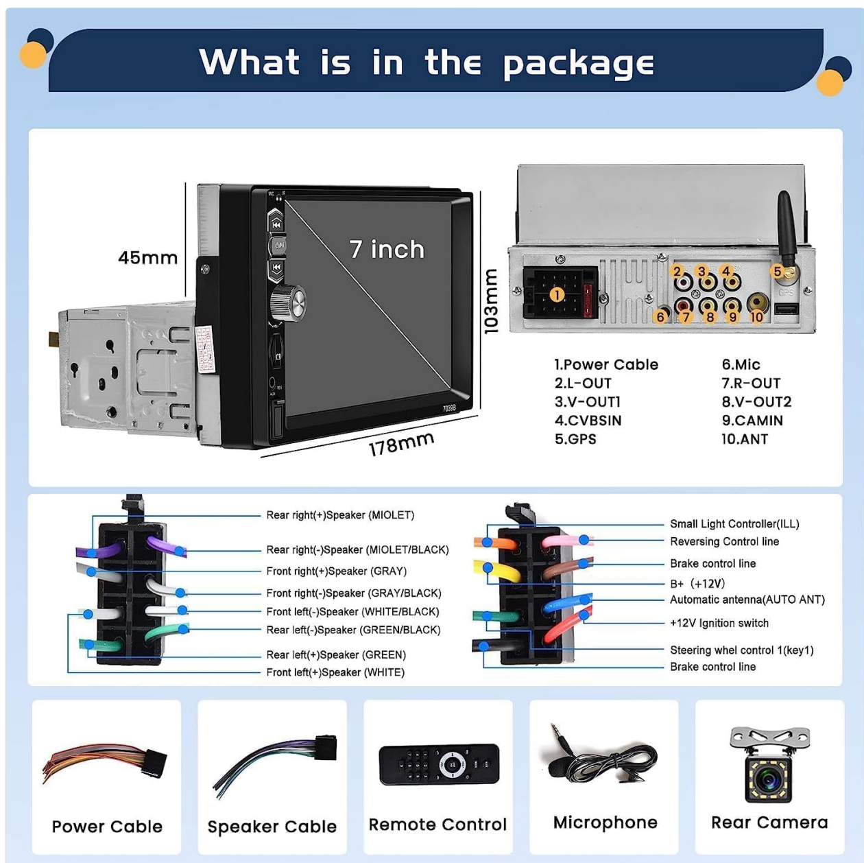
Image 4.1: Detailed wiring diagram for the Hikity 7039B car stereo, showing connections for power, speakers, microphone, camera, and other inputs/outputs.

The following diagram illustrates the connections for power, speakers, and other accessories. Match the wires carefully according to their labels.