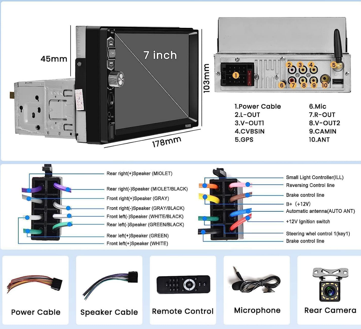
Image 2.1: Illustration of the Hikity 7039B car stereo unit, its dimensions, and included accessories such as the power cable, speaker cable, remote control, microphone, and rear camera.