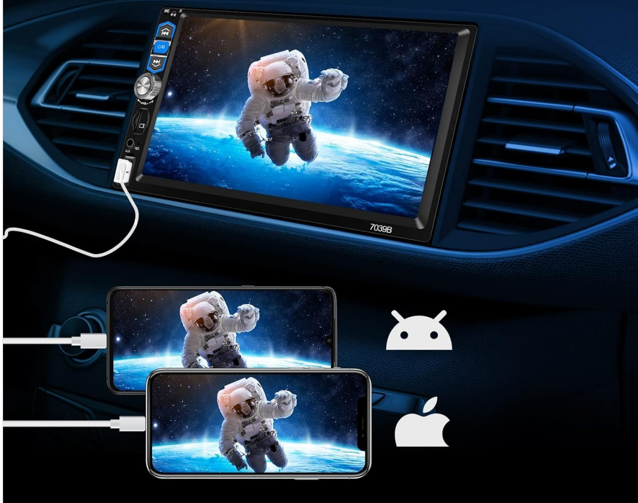
Image 11.1: The Hikity 7039B display showing a mirrored smartphone screen via USB connection, illustrating the Mirror Link feature for both Android and iOS devices.

Connect your phone via the original USB cable and sync your phone's pages to the large screen of the radio. iPhone supports one-way:sync and Android phones supports two-way control.