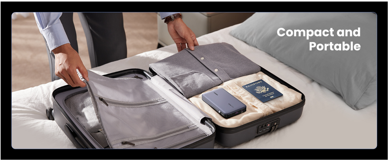
Image: The UGREEN Power Bank is compact and portable, fitting easily into luggage for travel.