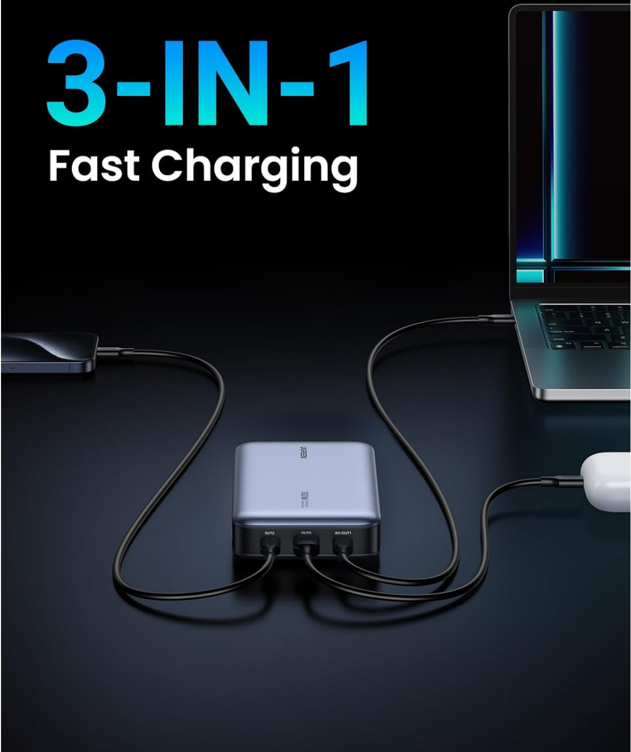
Image: The 3-in-1 fast charging capability allows multiple devices to be charged simultaneously.