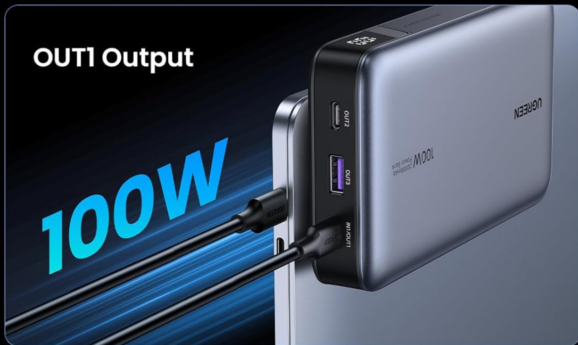
Image: The power bank supports two-way fast charging, with 65W input and 100W output.