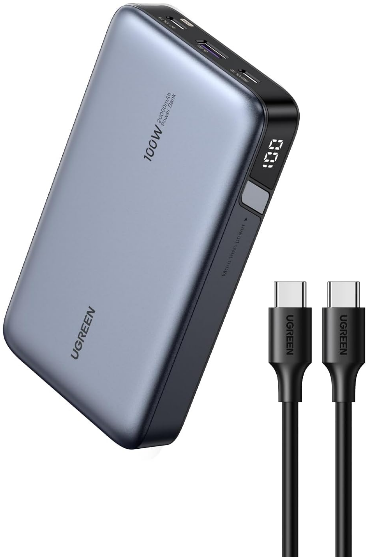
Image: The UGREEN 20000mAh 100W Power Bank shown with its two included USB-C to USB-C charging cables.