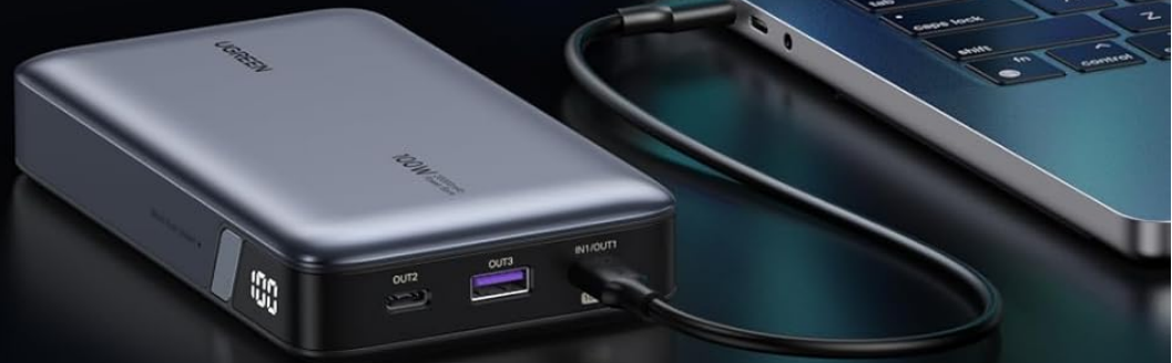
Image: The power bank provides fast charging for laptops, such as a MacBook Pro 16 inch.