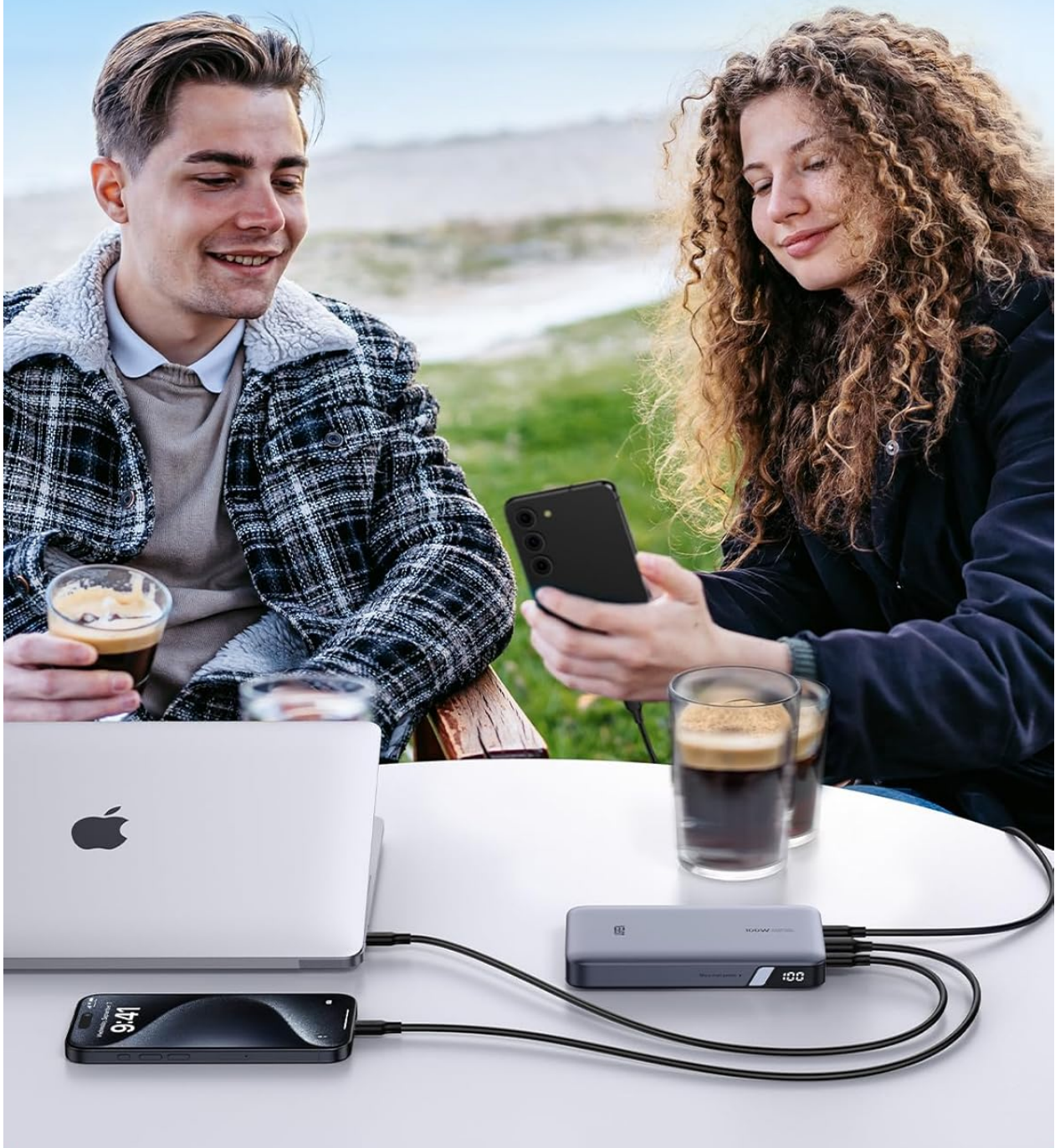
Image: The power bank can charge three devices simultaneously, ideal for shared use.