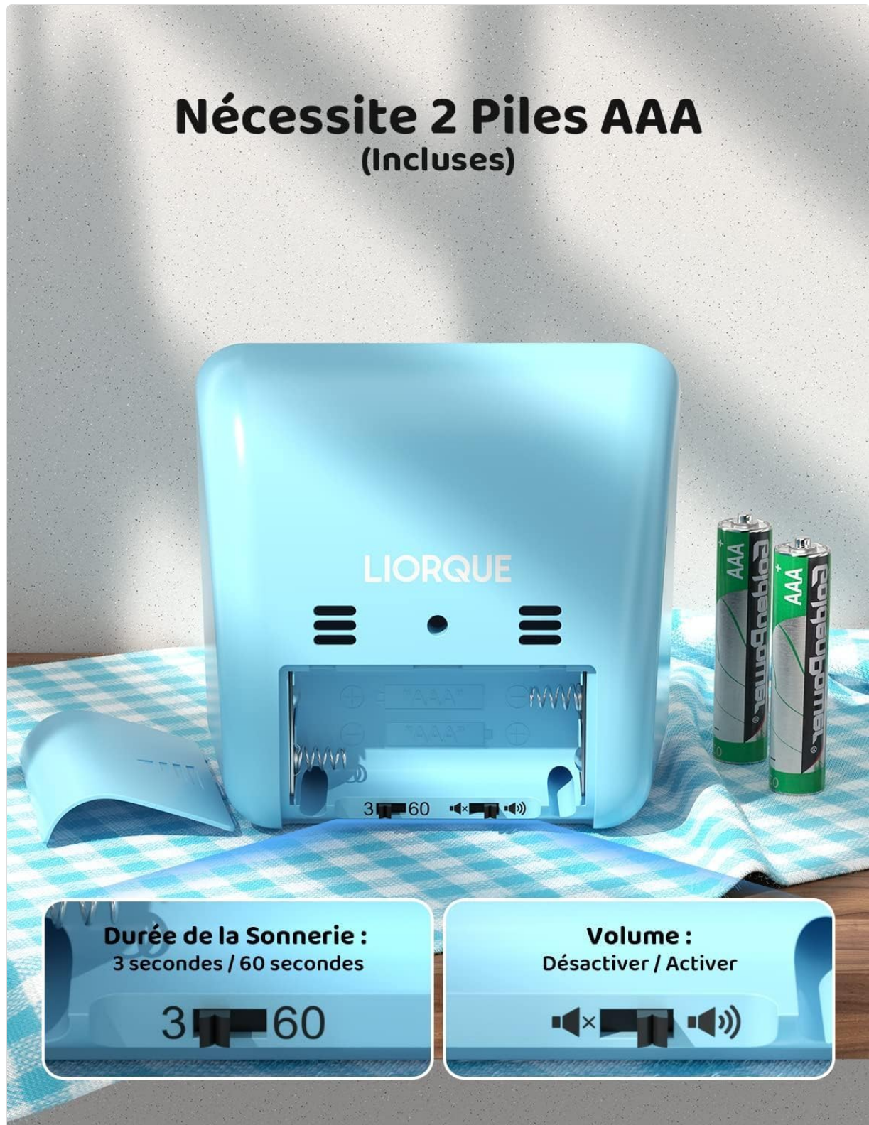
Figure 2: Battery Installation and Alarm Settings