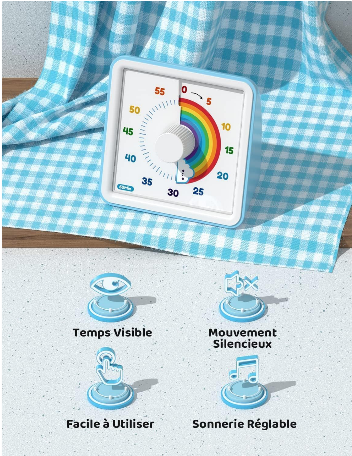
Figure 4: Visual representation of key features