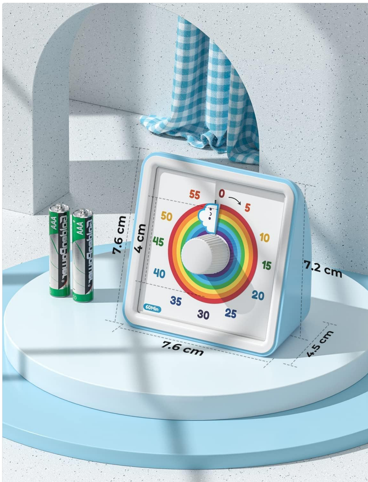
Figure 6: Product Dimensions