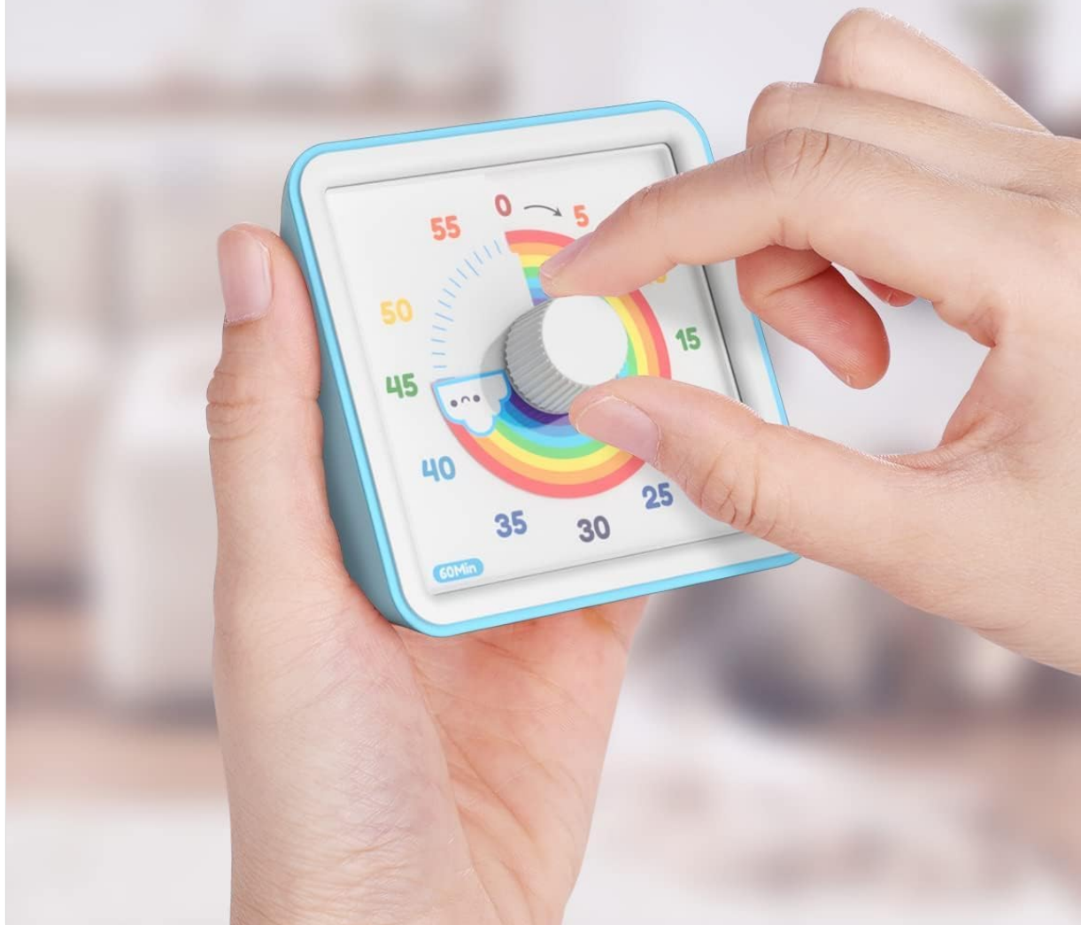
Figure 3: Setting the Timer

Note : Pour faire taire la sonnerie, tournez dans le sens des aiguilles d'une montre et revenez à zéro