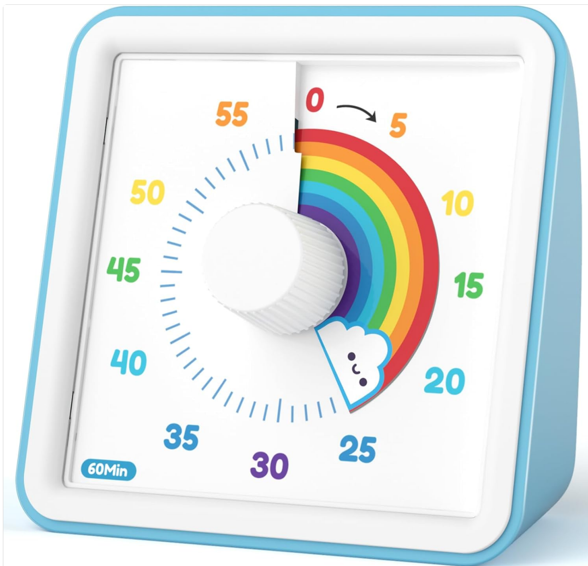
Figure 1: LIORQUE Visual Timer (Blue model)