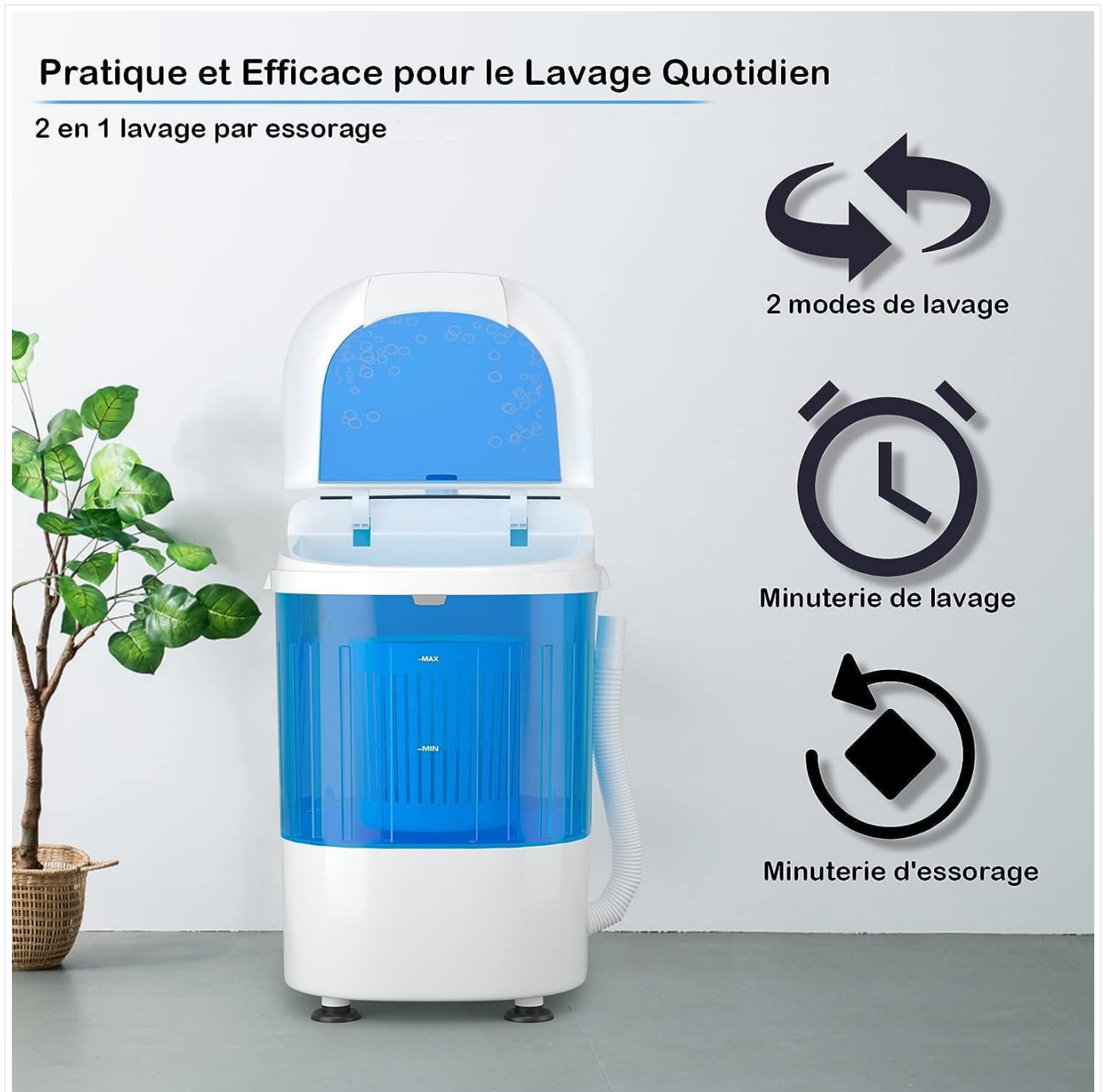
Figure 3: Washing Process. This image shows the machine in action, illustrating its dual wash modes and timer functions for both washing and spinning.