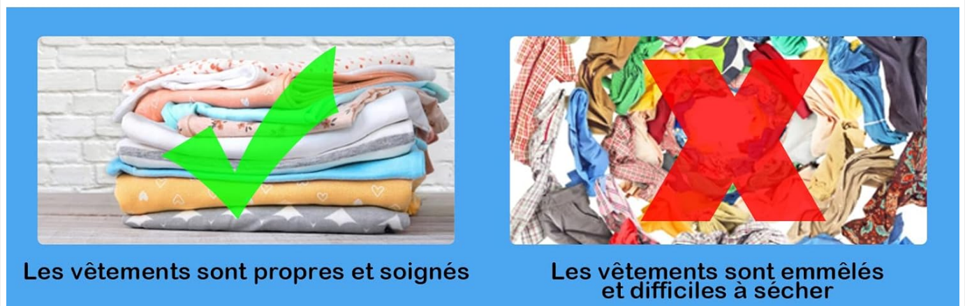
Figure 4: Spin Basket and Load. This image demonstrates the proper loading of clothes into the spin basket to prevent tangling and ensure effective spinning.