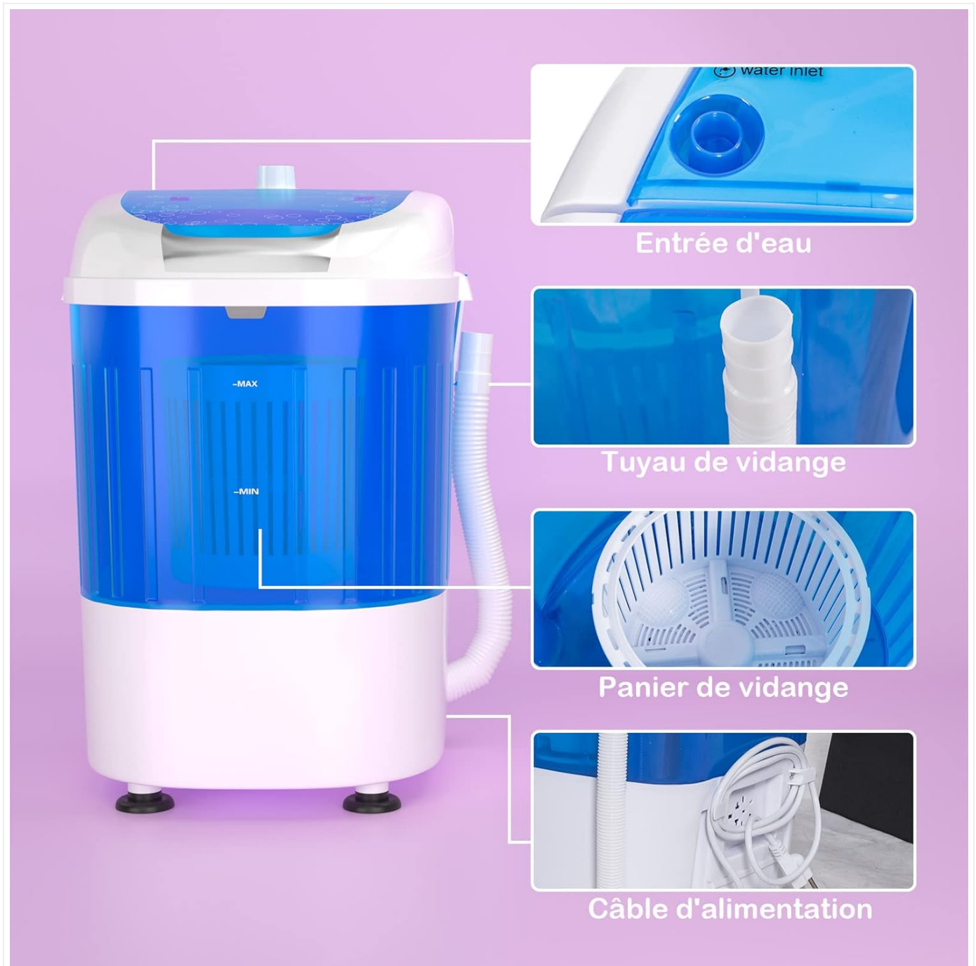
Figure 1: Key Components of the Washing Machine. This image illustrates the water inlet, drain hose, spin basket, and power cable, highlighting their locations on the appliance.