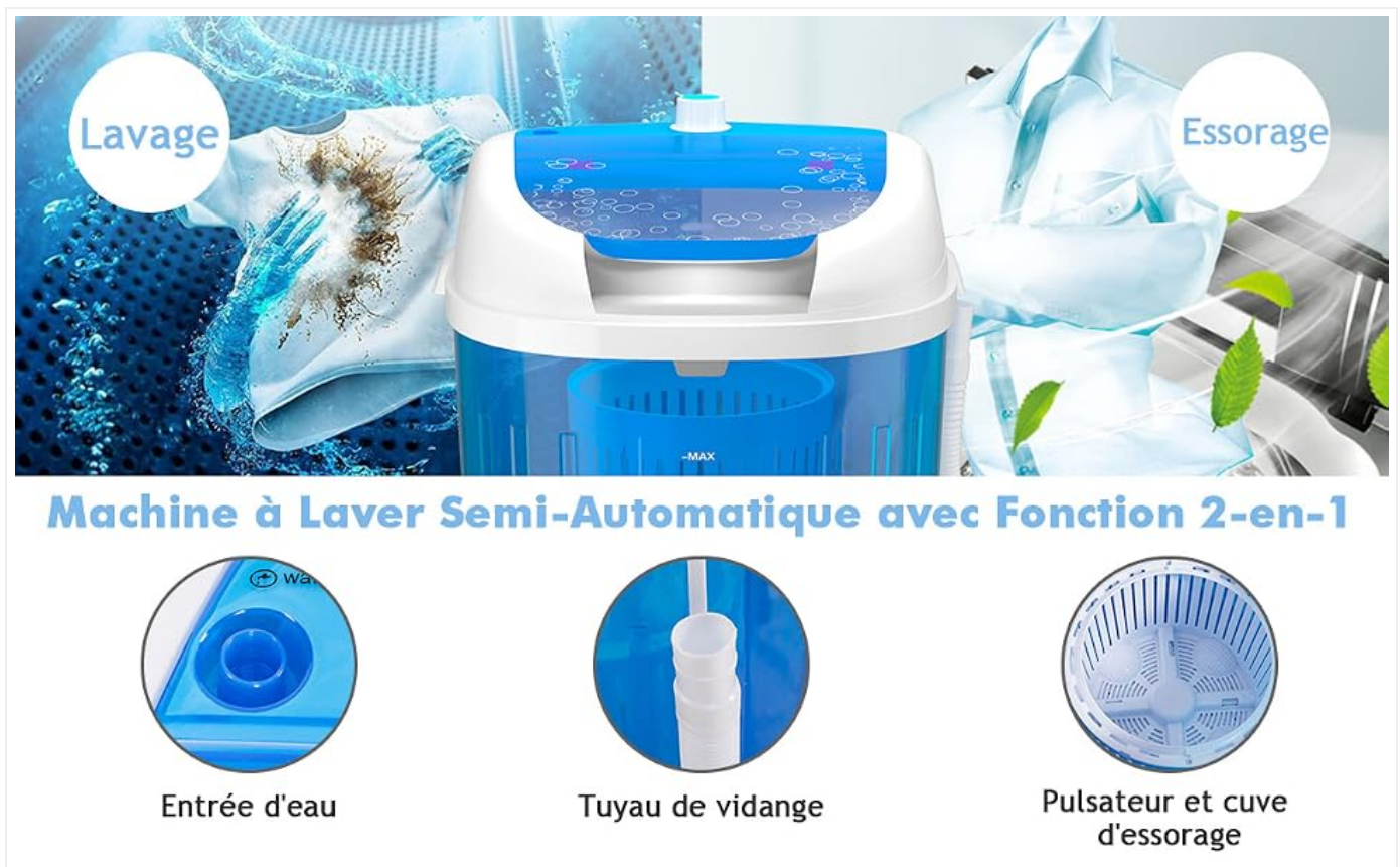
Figure 2: Setup Overview. This image highlights the water inlet, drain hose, and the pulsator with spin basket, demonstrating the machine's readiness for use.