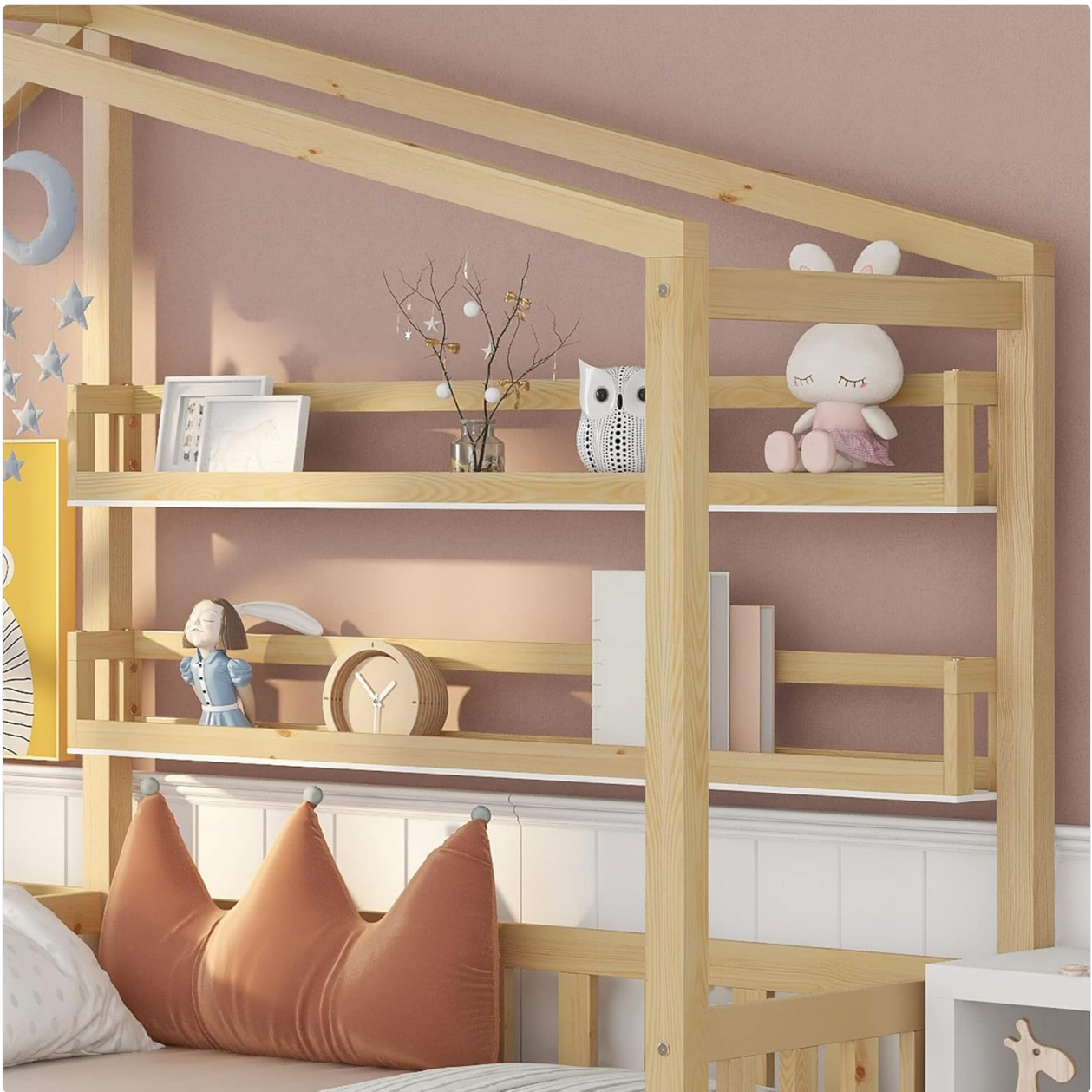
Image: An assembled view of the Merax L-Shaped House Bed frame, showing its structure before mattresses are added.