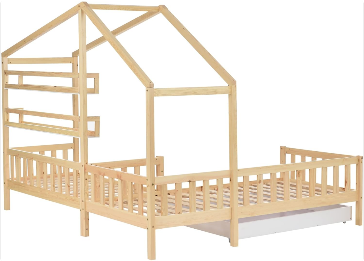
Image: A close-up view of the Merax L-Shaped House Bed, highlighting the integrated storage drawer pulled out from beneath the bed frame.