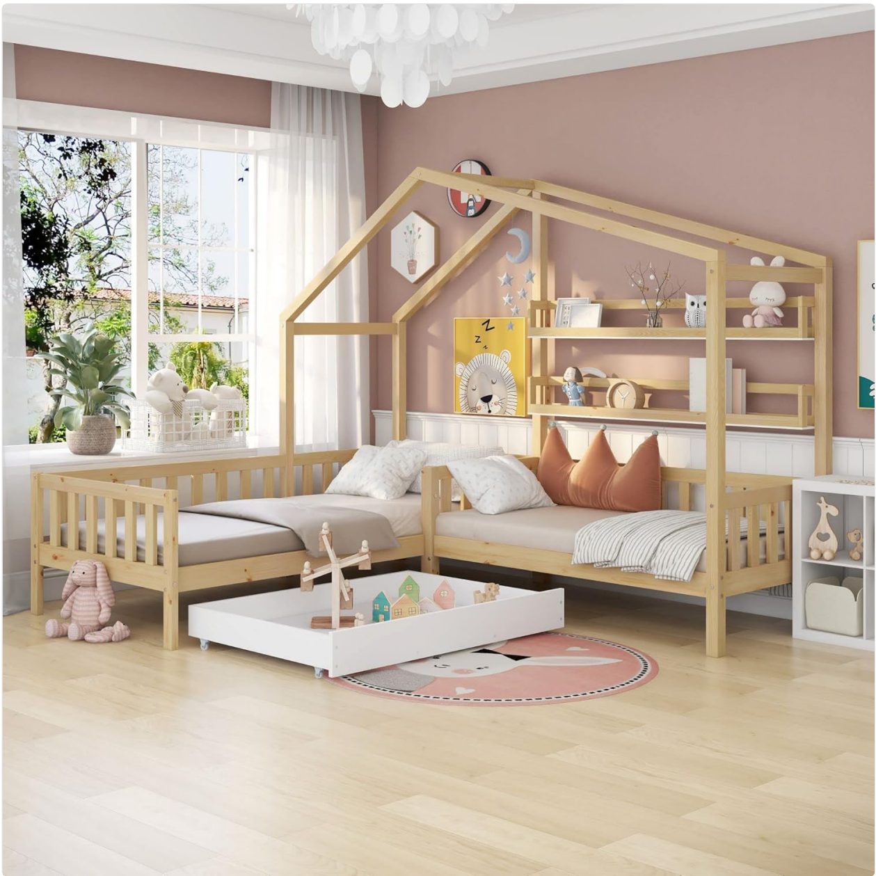
Image: The Merax L-Shaped House Bed, showcasing its design with integrated shelves and a pull-out drawer, set up in a child's bedroom.