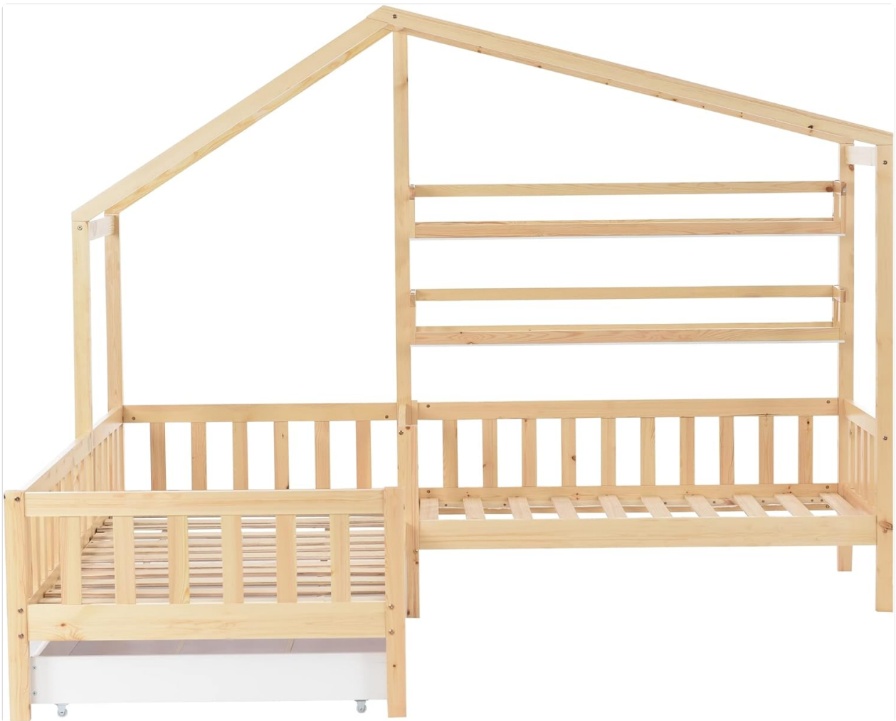
Image: A detailed view of the Merax L-Shaped House Bed's integrated shelves, showing space for books and decorative items.