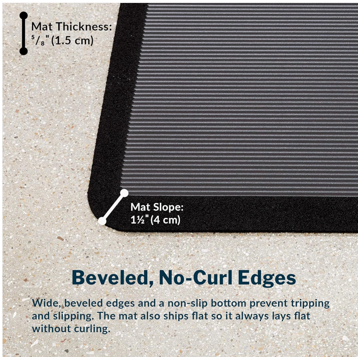
Image: A detailed shot of the mat's edge, highlighting its beveled design to prevent curling and tripping.