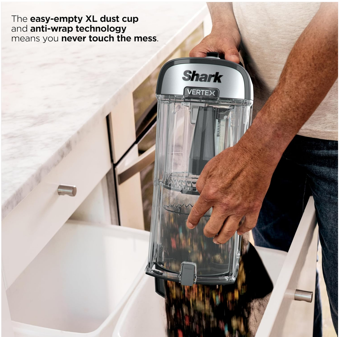
Image: A person demonstrating how to easily empty the XL dust cup of the Shark Vertex vacuum into a waste receptacle.

The easy-empty XL dust cup and anti-wrap technology means you never touch the mess .