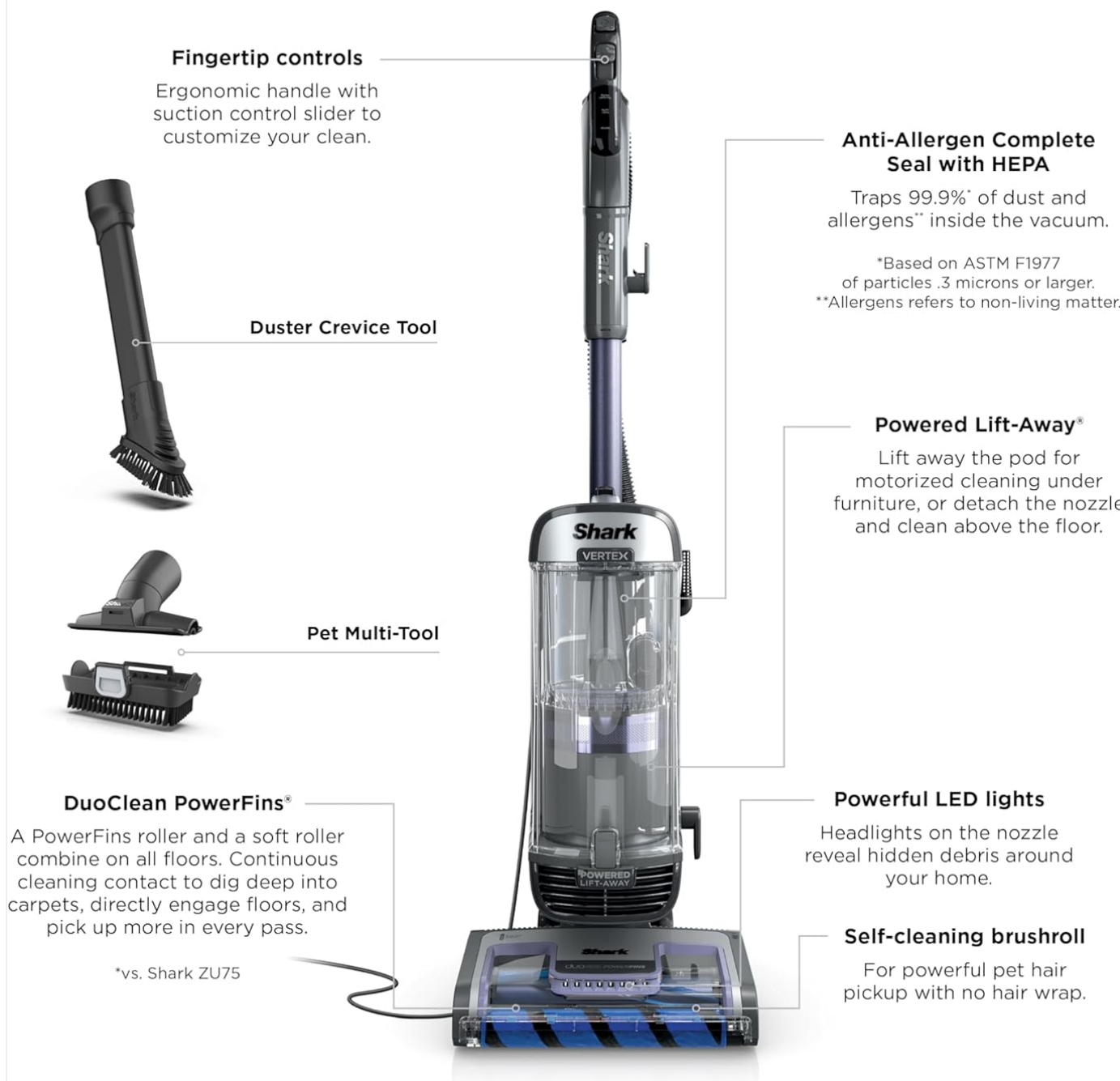
Image: All components included with the Shark Vertex DuoClean PowerFins Upright Vacuum, including the main unit, duster crevice tool, and pet multi-tool.