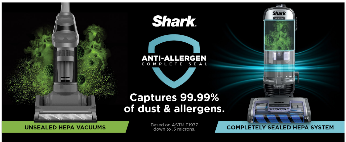
Image: A diagram illustrating the Shark Anti-Allergen Complete Seal system, which captures 99.99% of dust and allergens with its HEPA filter.