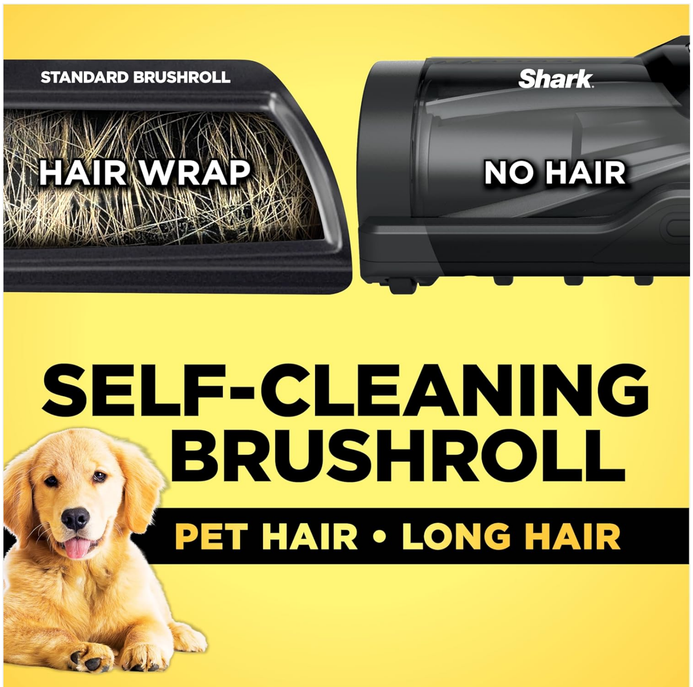
Image: A visual comparison showing a standard brushroll tangled with hair versus the self-cleaning brushroll with no hair wrap.