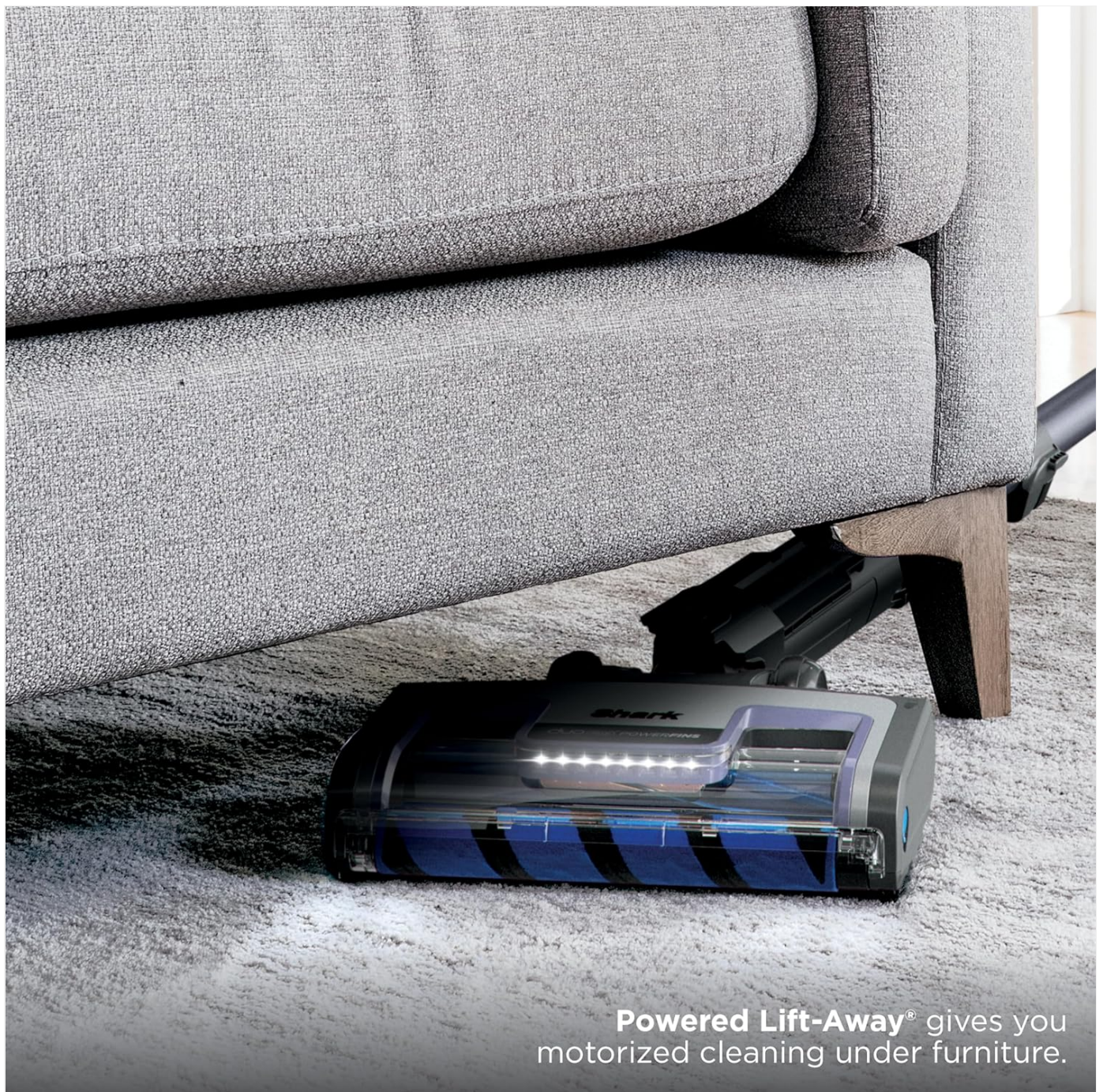
Image: The vacuum pod detached in Powered Lift-Away mode, allowing the motorized nozzle to clean effectively under a sofa.