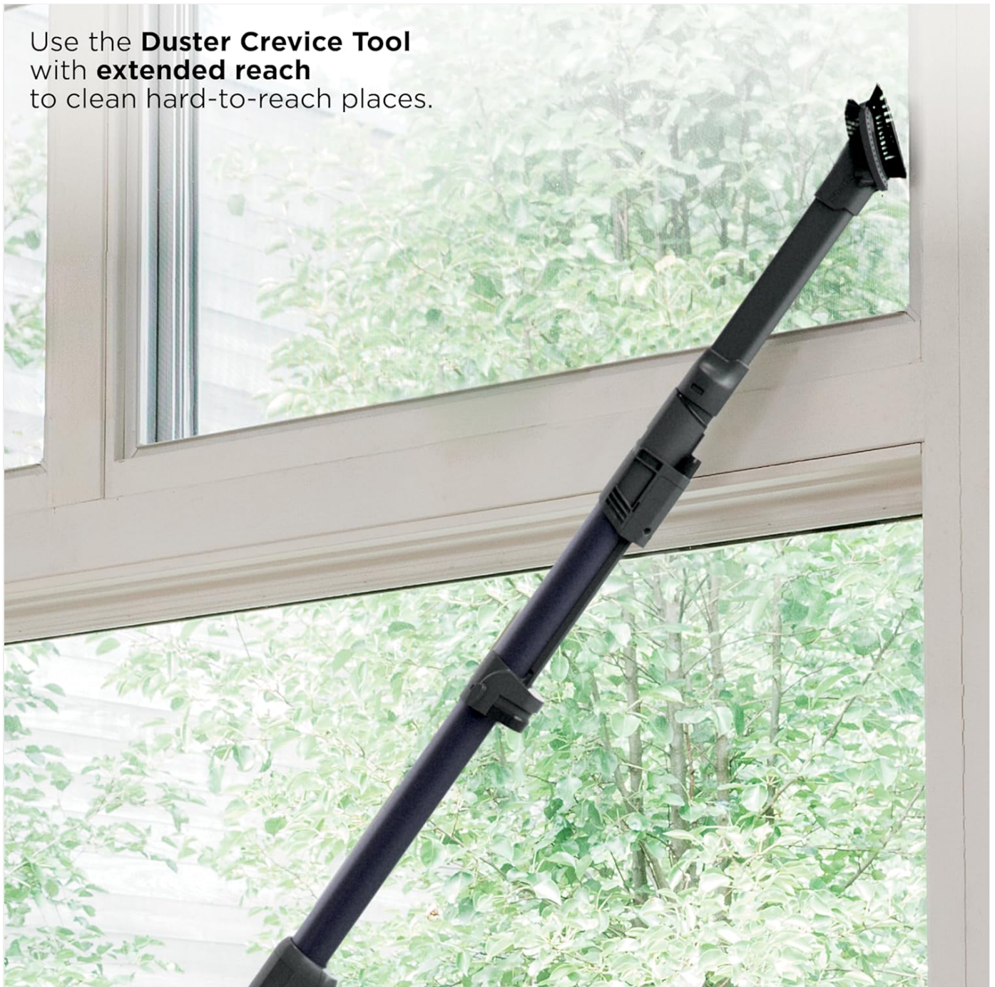
Image: A person using the Duster Crevice Tool attached to the wand to clean high, hard-to-reach areas.

Use the Duster Crevice Tool with extended reach to clean hard-to-reach places.