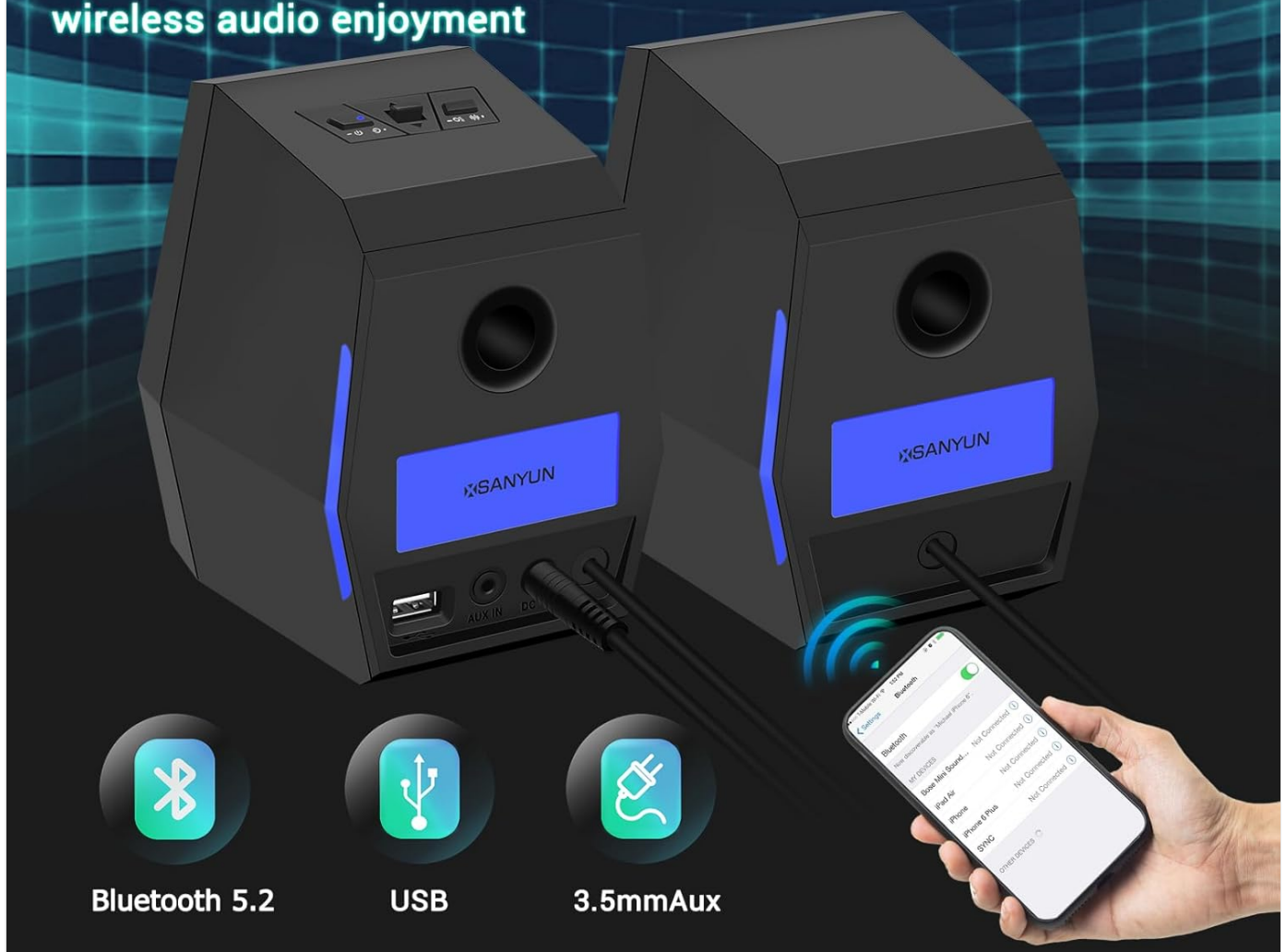
Figure 3: Rear view of the main speaker unit, illustrating the Bluetooth 5.2, USB, and 3.5mm Aux input options for broad compatibility.

Engineered for both wired & hassle-free wireless audio enjoyment