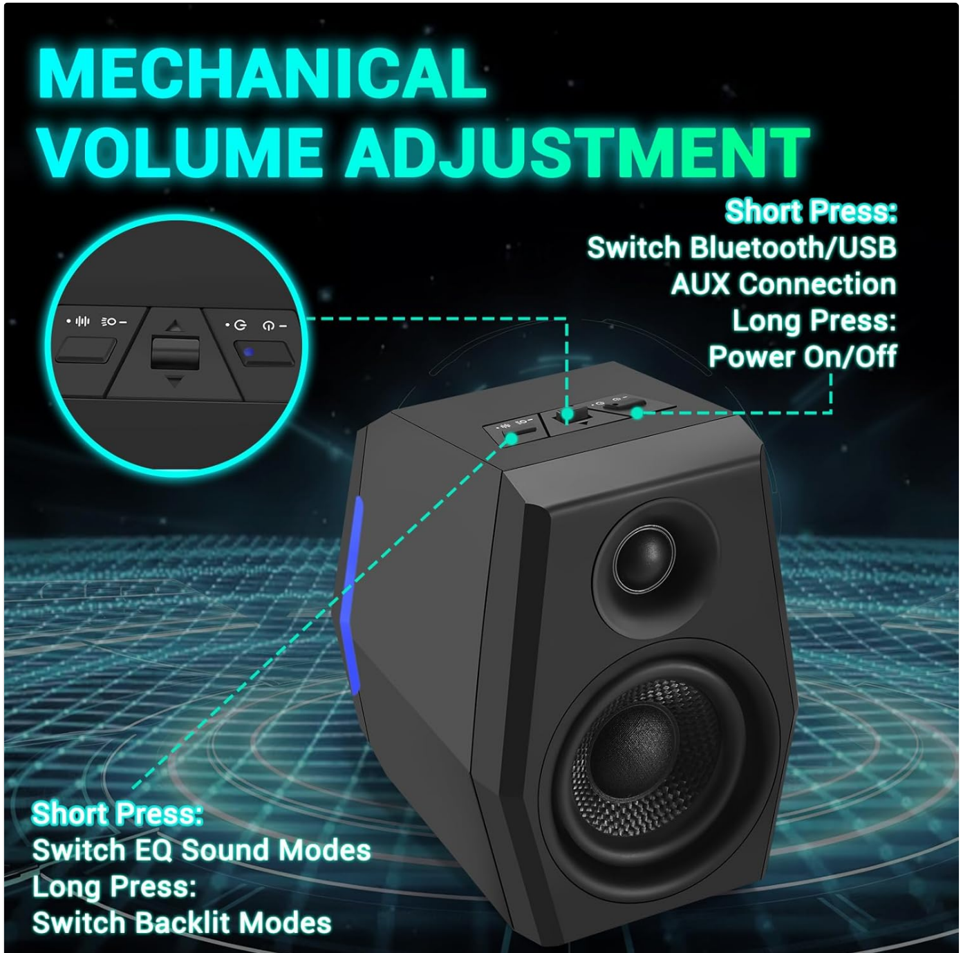
Figure 4: Top panel controls for volume, EQ modes, RGB backlight, and input selection.

The main speaker unit features control buttons on its top panel: