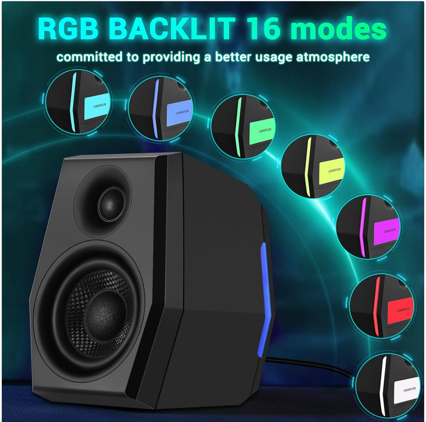
Figure 5: The speakers feature 16 RGB backlit modes to customize your ambiance.

Your browser does not support the video tag.