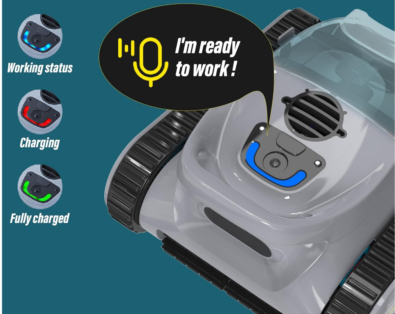
Image: Close-up of the robotic pool cleaner's control panel showing LED indicators for working status (blue), charging (red), and fully charged (green), along with an audio alert for 'I'm ready to work!'.