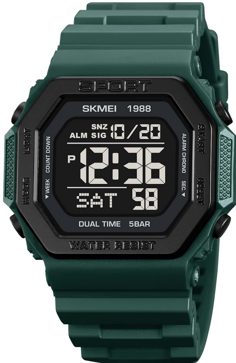
Image: Front view of the SKMEI 1988 Digital Watch in dark green.