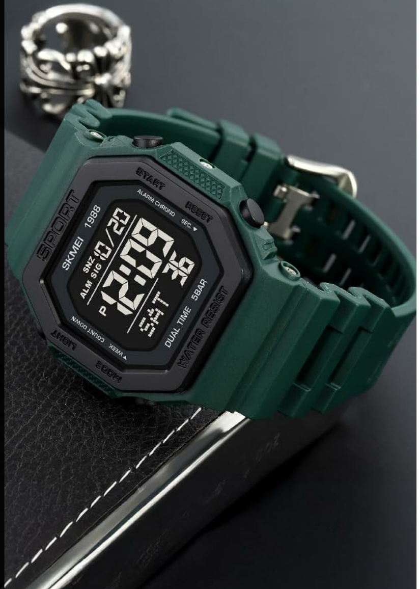
Image: Visual representation of the watch's key features including display type, dial shape, and water resistance.