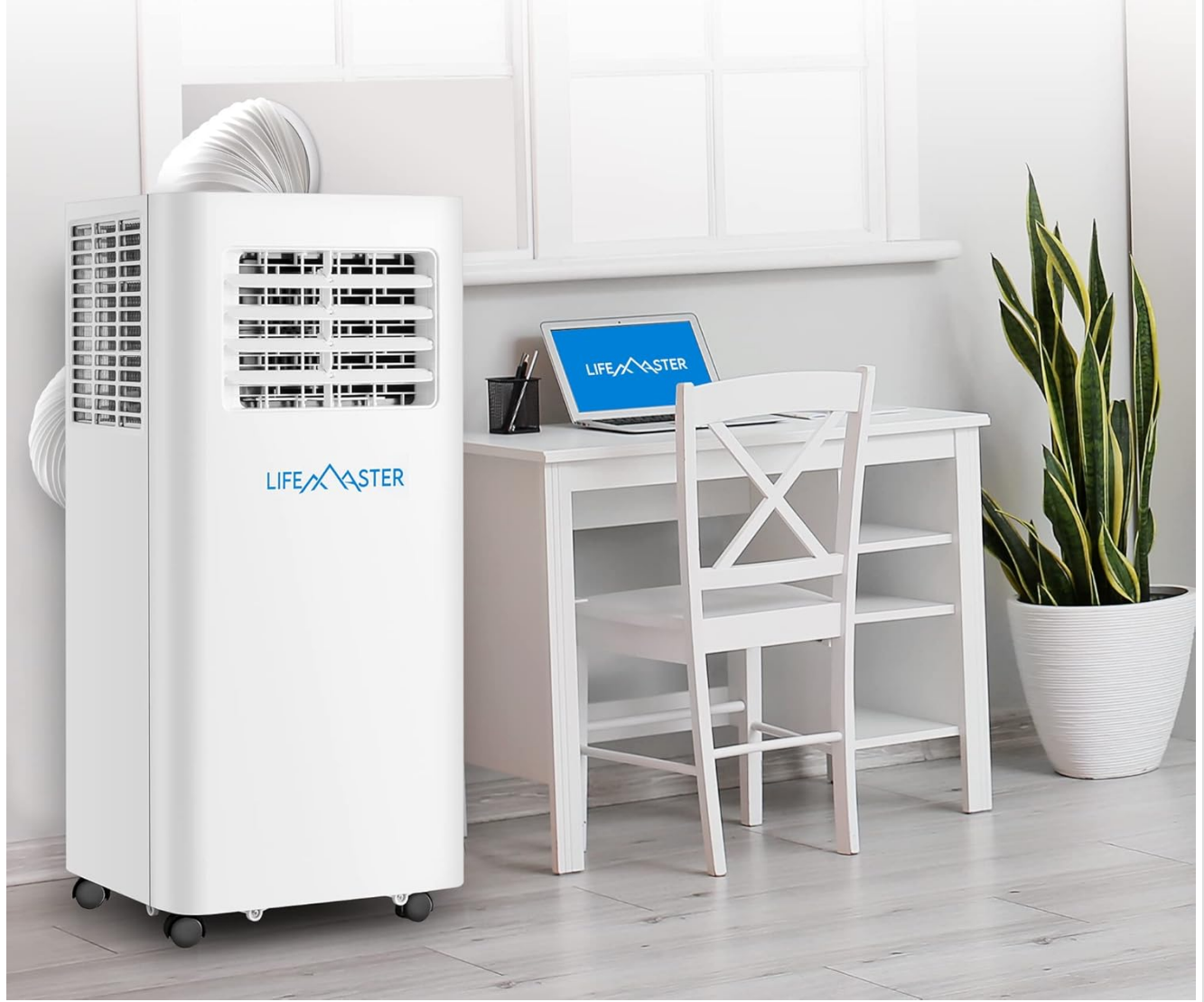
Figure 4: Easy setup and maintenance with an exhaust kit and a removable air filter.

WITH AN EXHAUST KIT AND A REMOVABLE AIR FILTER