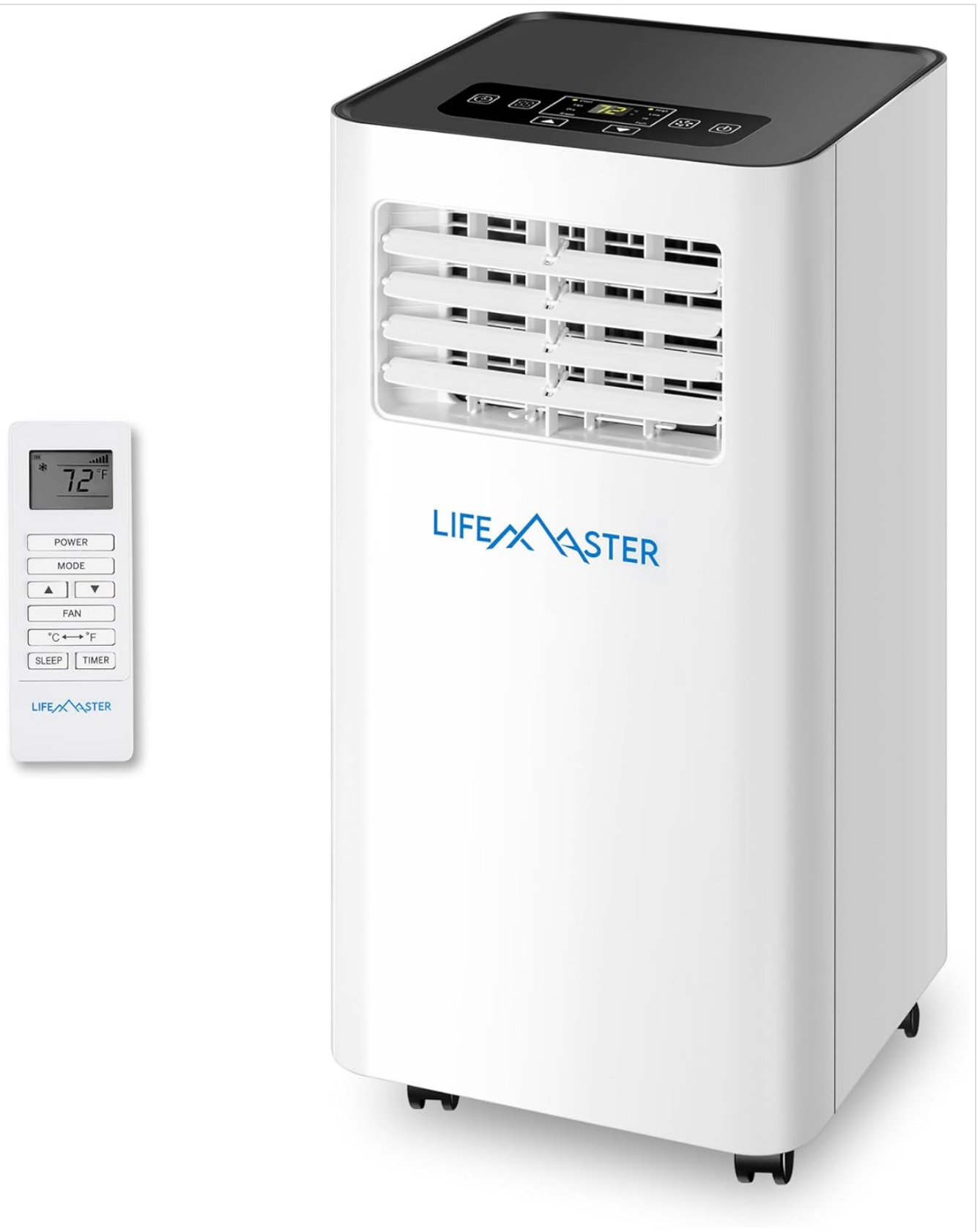
Figure 1: Lifemaster Portable Air Conditioner and its remote control.