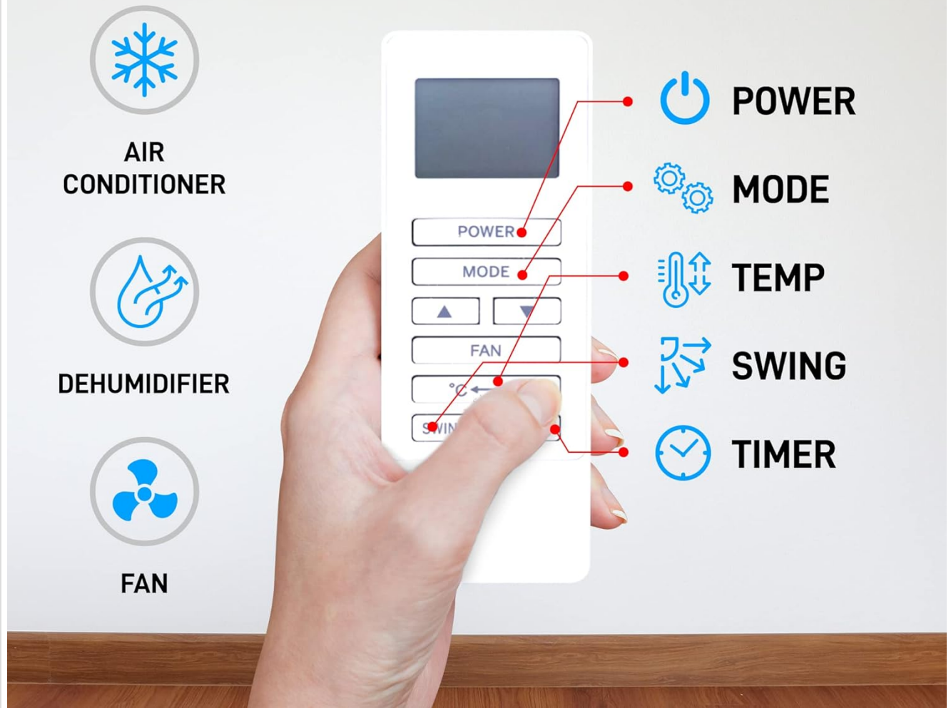
Figure 3: Overview of the 3-in-1 operations and remote control access.