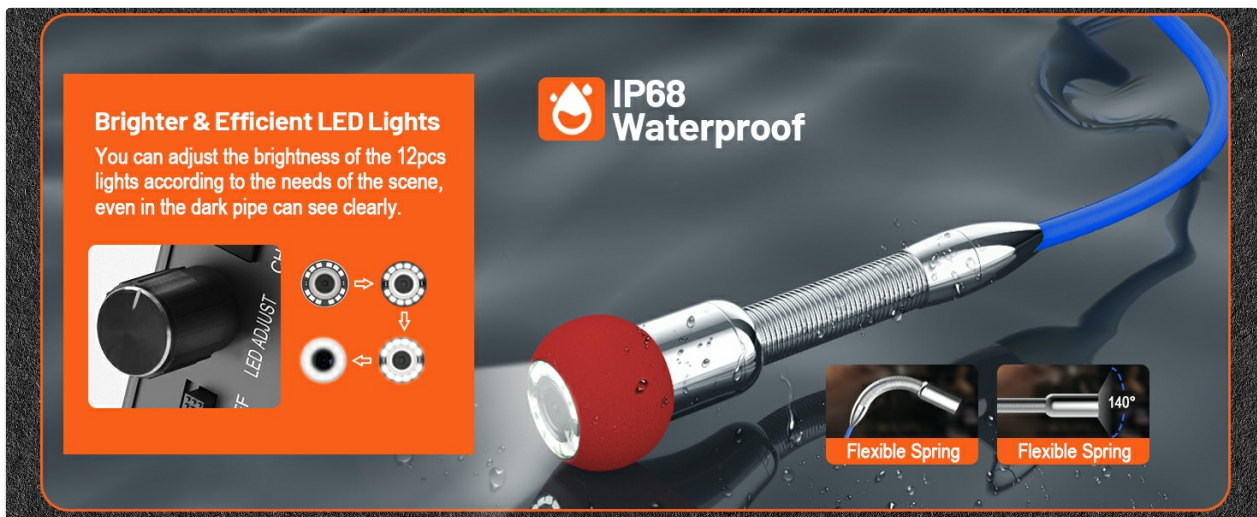
Figure 2: Key components of the inspection system