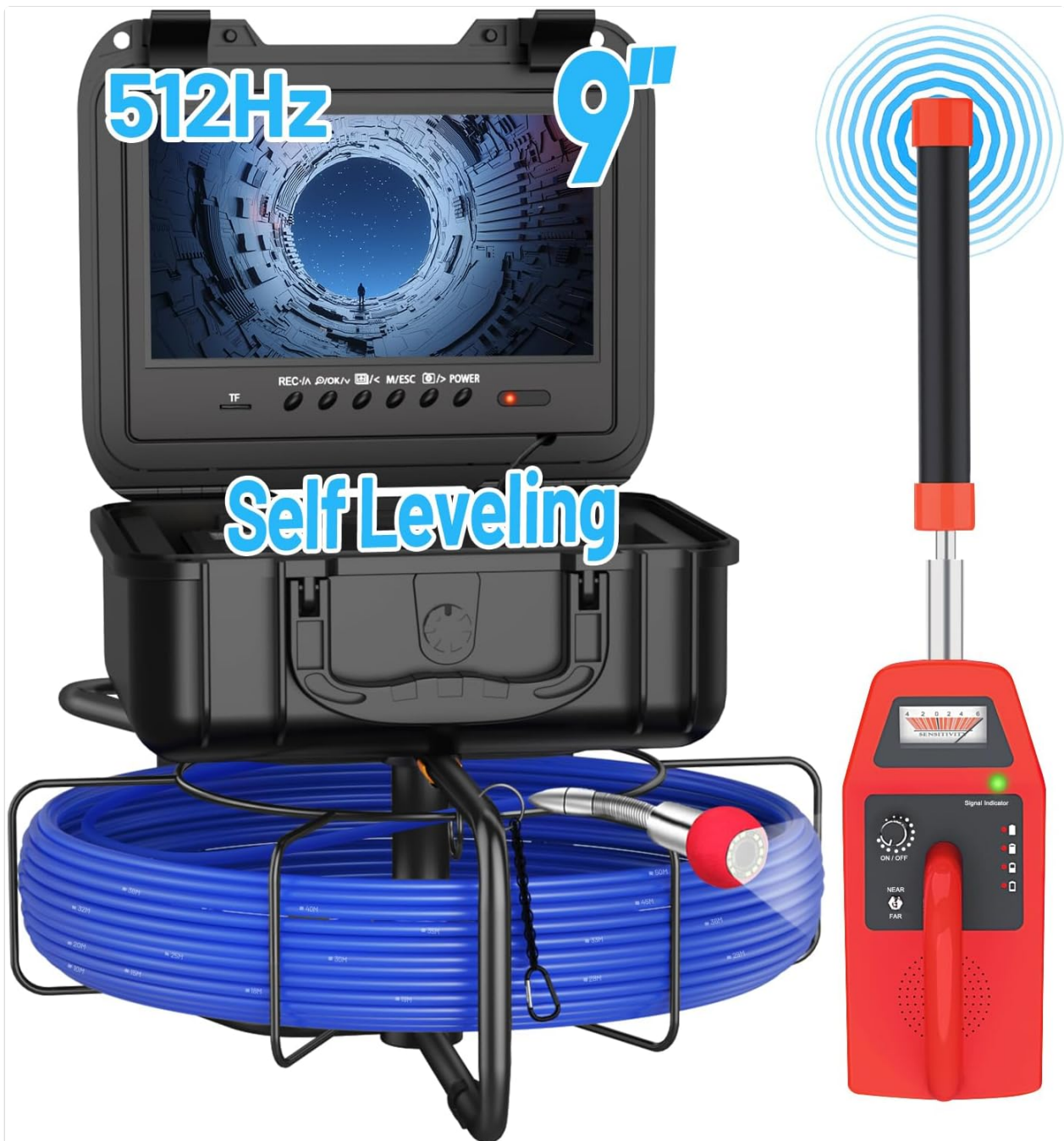
Figure 1: Anysun Sewer Inspection Camera System Overview