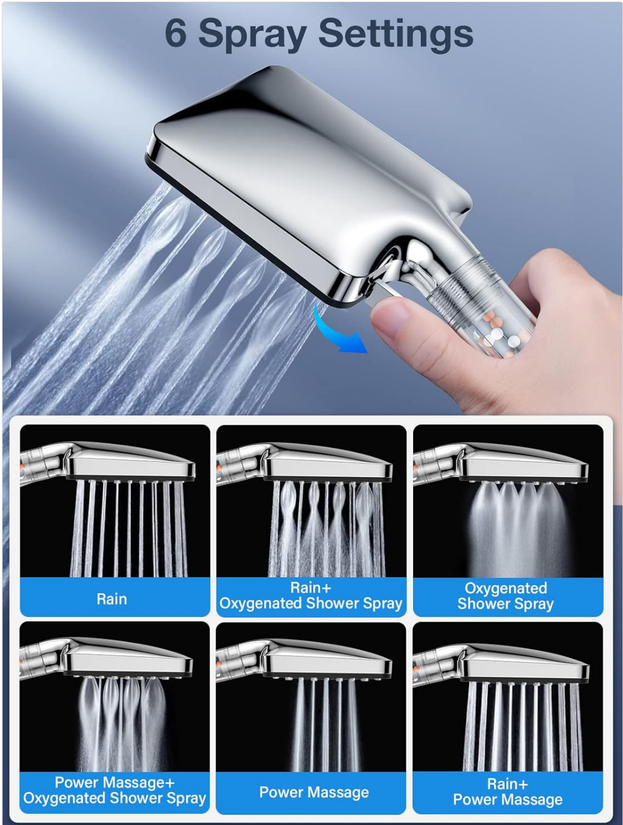
Figure 3: Visual representation of the 6 adjustable spray settings available on the shower head.