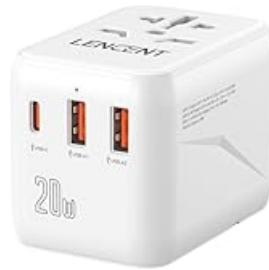
Image: The adapter's safety features, including the dual 10A fuse, are highlighted.