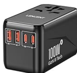
Image: The LENCENT Universal Travel Adapter plugged into a wall socket, demonstrating its use for charging a

The universal AC socket accepts various plug types (Type A, B, C, O, E/F, G, I, J, L, N). Insert your appliance's plug into the front universal socket. Ensure the adapter's pins are correctly configured for the wall outlet you are using.