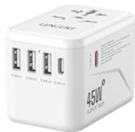
Image: A close-up view of the adapter's USB-A and USB-C ports, illustrating how multiple devices can be connected for charging.

This adapter does NOT convert voltage. It is compatible with input voltages from 100-250V. Ensure your devices are compatible with the local voltage before plugging them into the AC socket. Using devices that are not voltage compatible may cause damage to the device or the adapter.