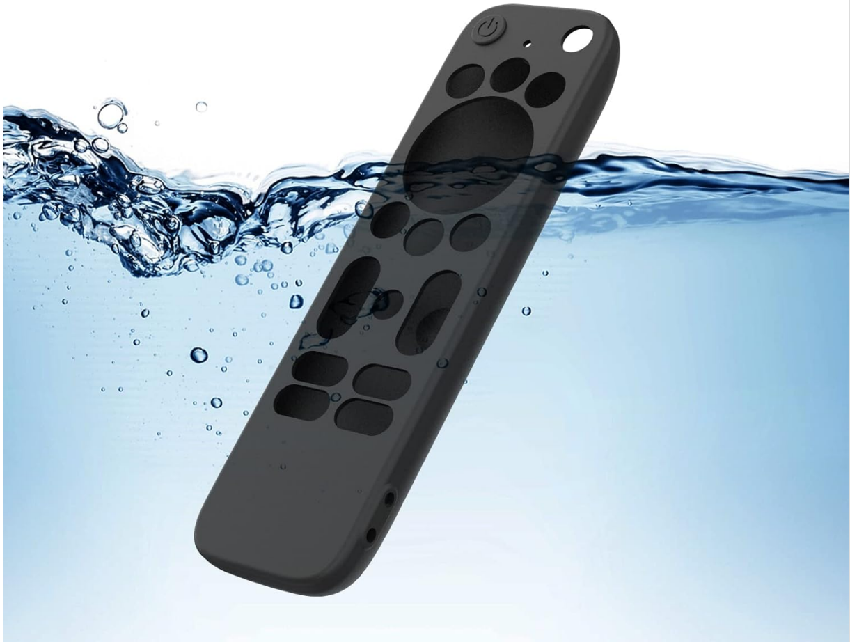
Figure 6: The silicone case is fully washable, allowing for easy cleaning and maintenance.

The whole body can be washed, no yellowing and no discoloration, long use as new.