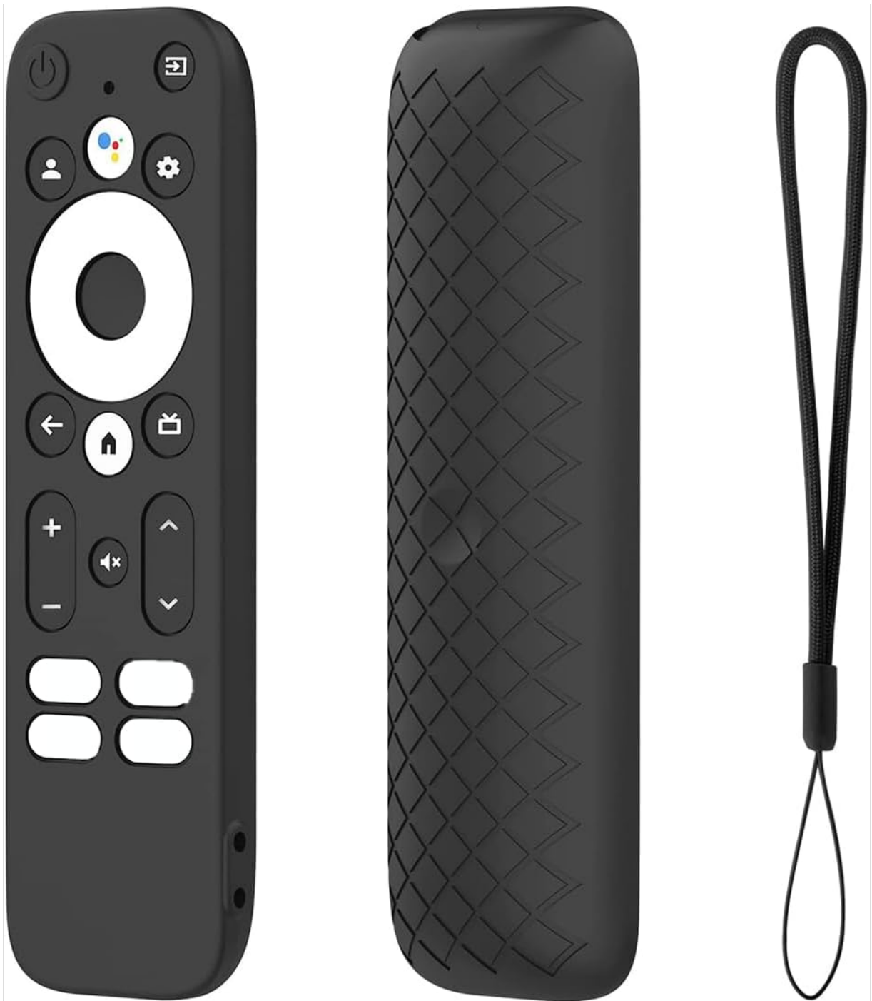
Figure 3: Overview of the USTIYA Silicone Protective Case, compatible remote control, and included lanyard.