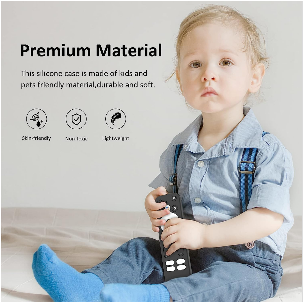
Figure 1: The case is made from premium, child-friendly silicone material that is skin-friendly, non-toxic, and lightweight.