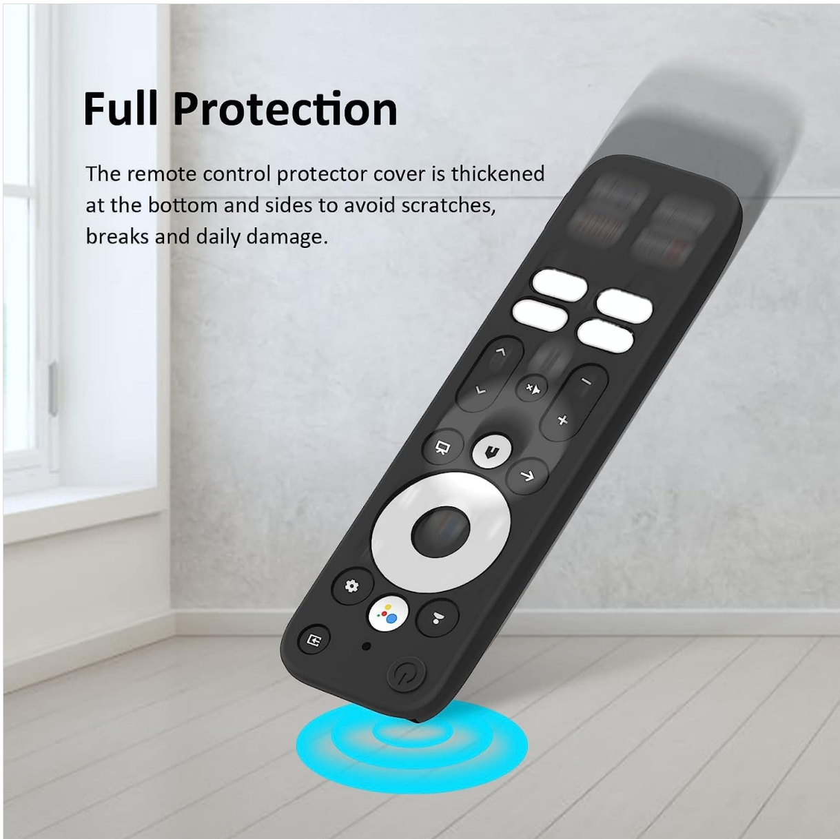
Figure 5: The silicone case provides full protection, absorbing impacts from accidental drops.

The remote control protector cover is thickened at the bottom and sides to avoid scratches, breaks and daily damage.