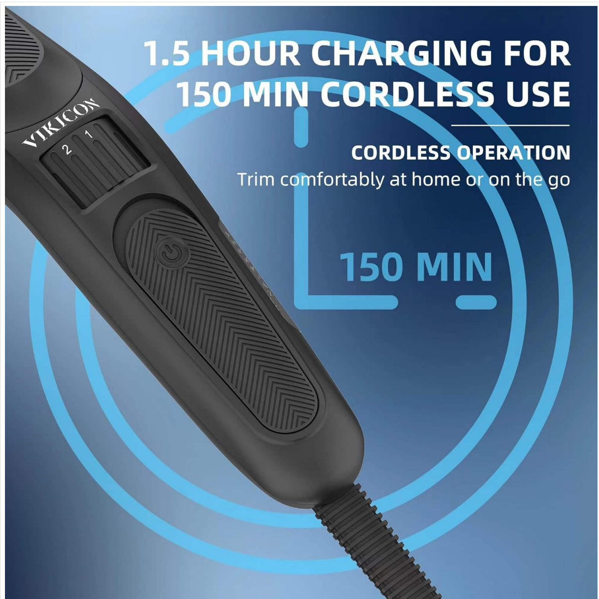
Figure 5.1: The trimmer requires approximately 1.5 hours of charging to provide 150 minutes of cordless operation.