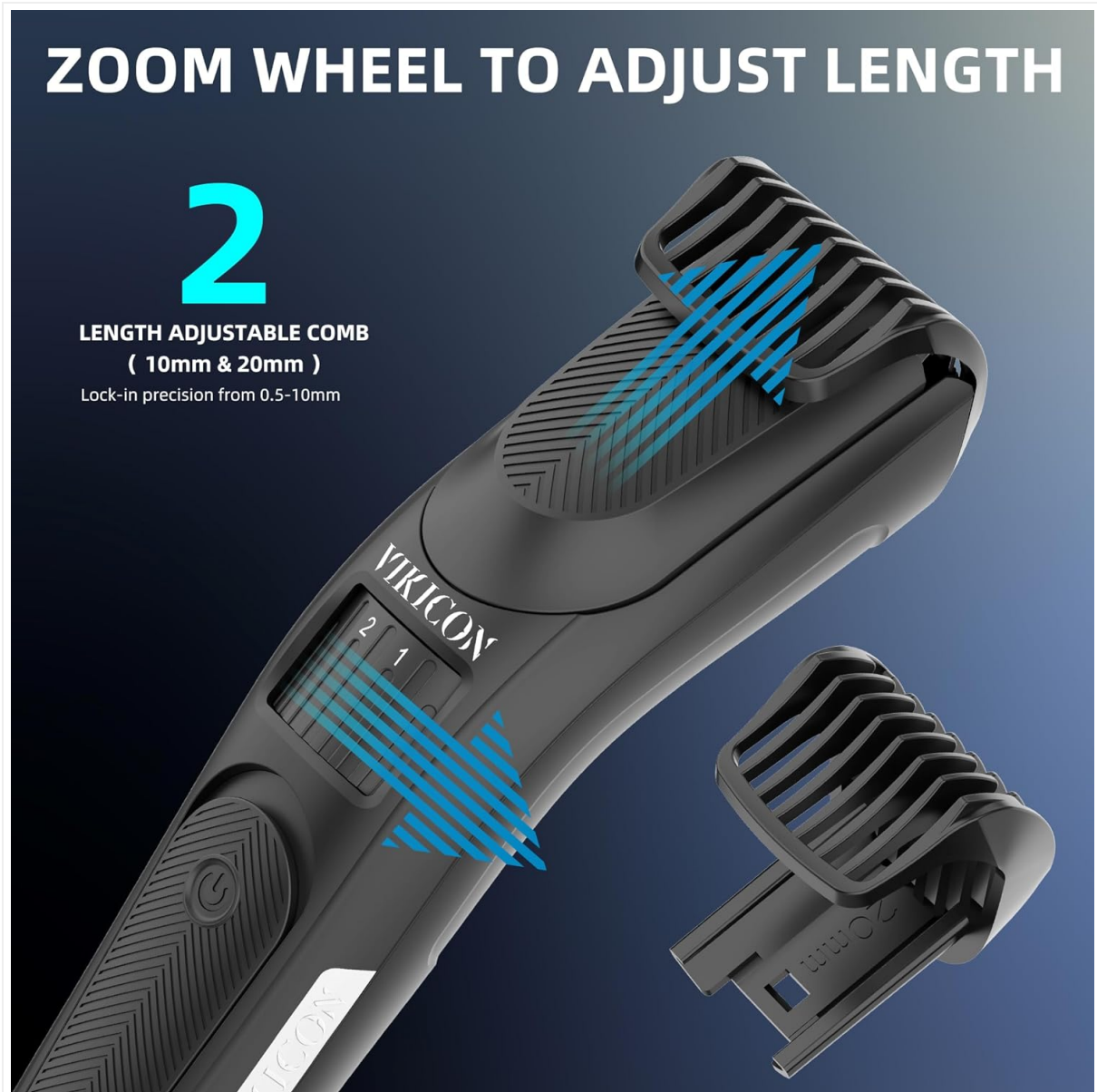
Figure 4.1: Overview of the VIKICON G-264L Beard Trimmer with its adjustable comb attachment.

The VIKICON G-264L is a cordless, rechargeable beard trimmer designed for precision grooming. It features an ergonomic design for comfortable handling and ultra-sharp stainless steel blades for efficient cutting.