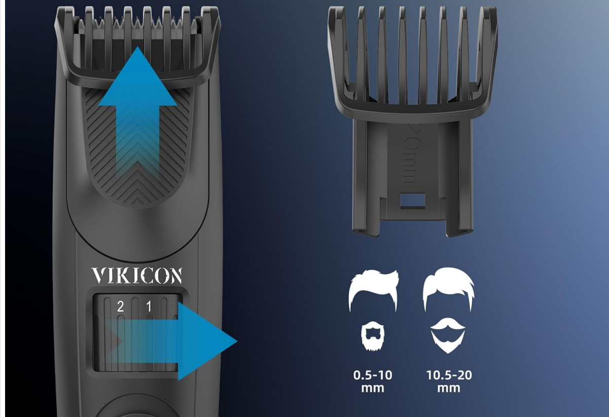
Figure 6.1: The zoom wheel allows for precise length adjustments, complemented by two interchangeable combs for different trimming needs.