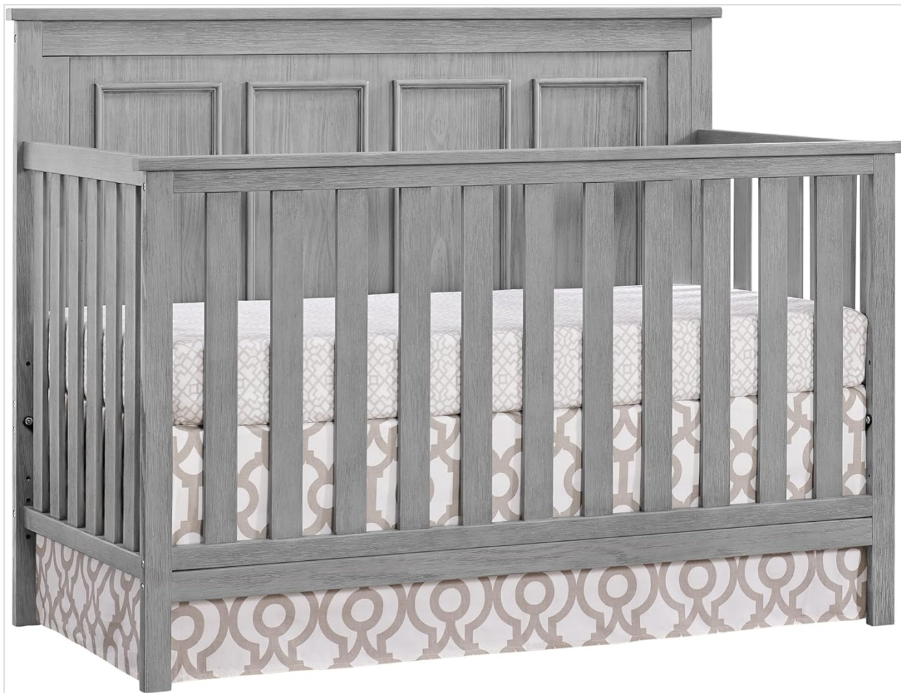
Image: The fully assembled Oxford Baby Bennett 4-in-1 Convertible Crib in Rustic Gray, ready for use.

via the link provided with your purchase.