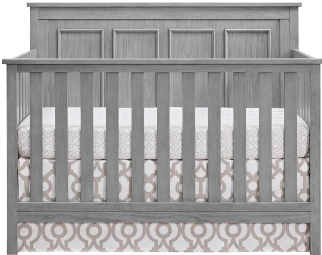
Image: The Oxford Baby Bennett crib displaying the GREENGUARD Gold Certified logo, indicating low chemical emissions for improved indoor air quality.

Bennett 4 in 1 Convertible Crib is Greenguard Gold Certified, meaning that it has been screened for over 15,000 VOC's and contributes to cleaner indoor air for you and your little one.