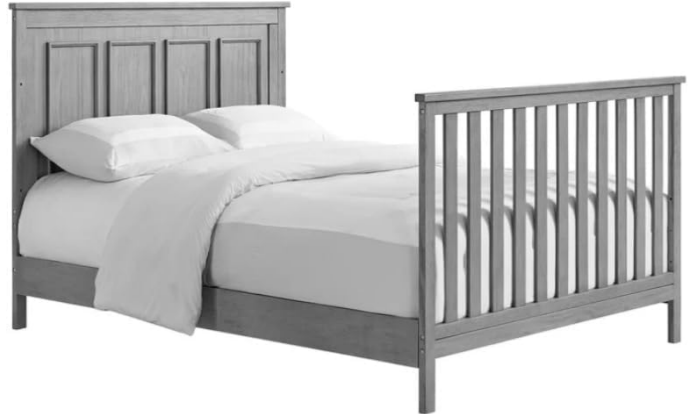
FULL SIZE BED

Image: A visual representation of the crib's 4-in-1 functionality, illustrating its transformation from a crib to a toddler bed, daybed, and full-size bed.