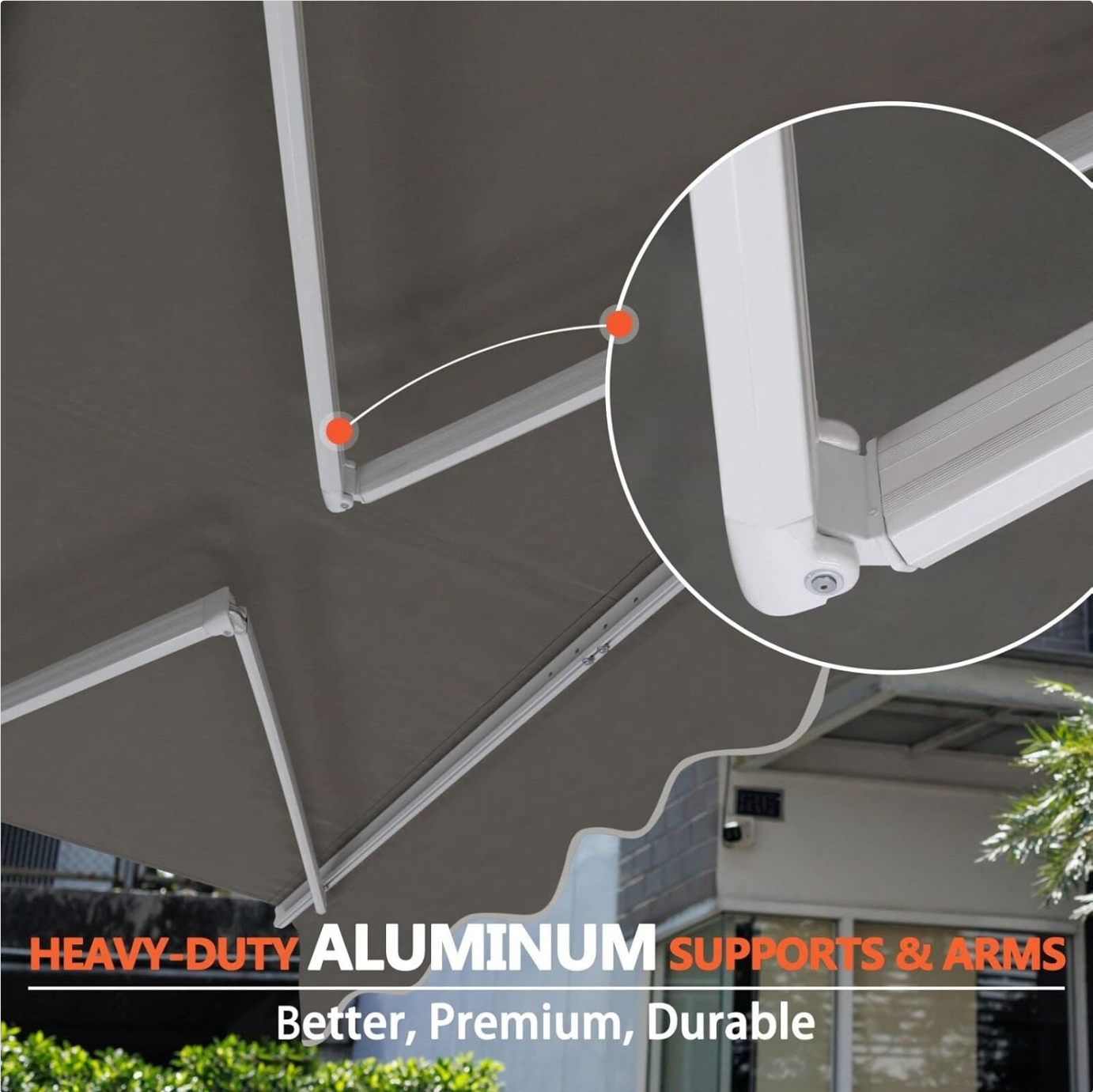
Image: A detailed view of the heavy-duty aluminum supports and arms of the awning, highlighting their robust construction for better durability.