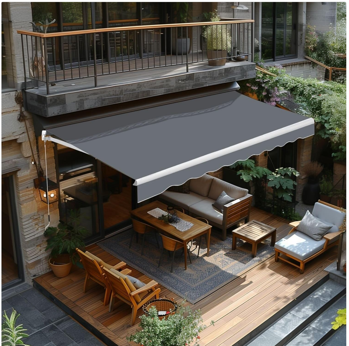
Image: The VEIKOUS 10'x8' Outdoor Retractable Patio Awning providing shade over a patio seating area.