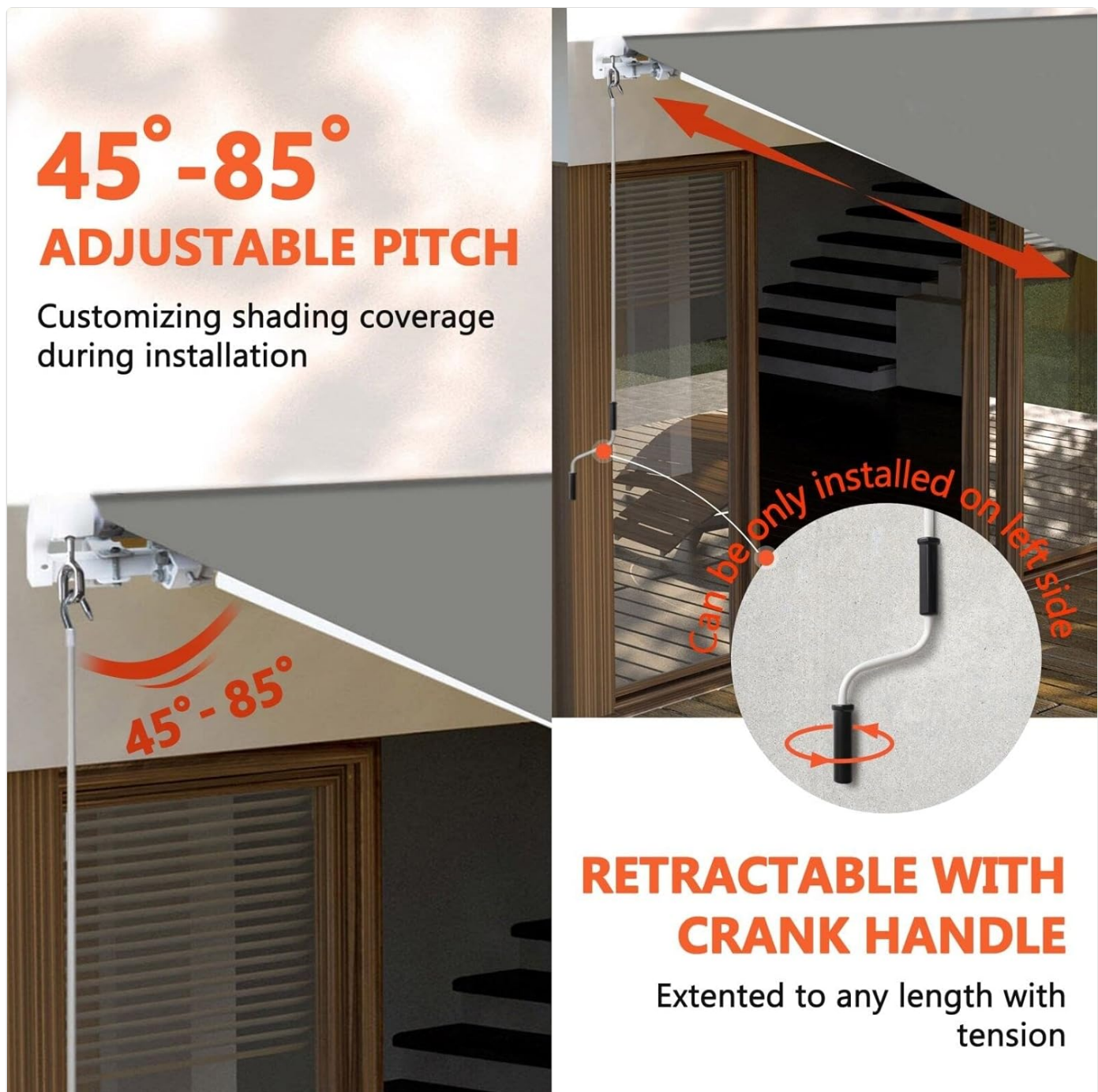
Image: A visual guide demonstrating the 45°-85° adjustable pitch mechanism for customizing shading coverage and the hand crank for retraction, noting it can only be installed on the left side.