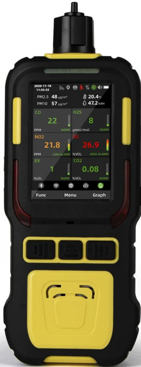
Image: The front view of the K-600M Gas Detector with its display screen active, showing real-time readings for various gas concentrations and environmental parameters.