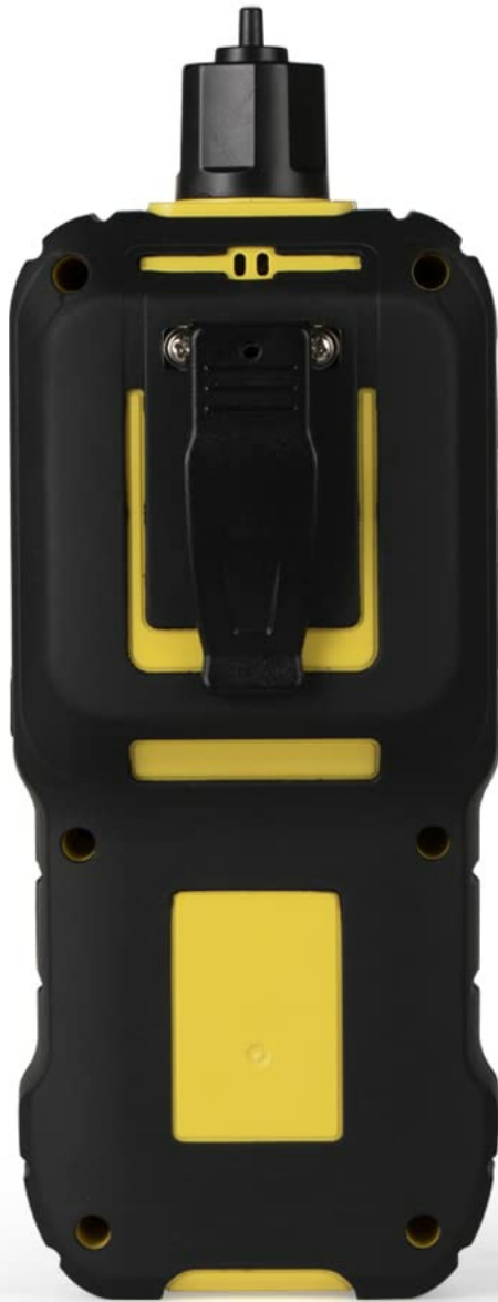
Image: The rear view of the K-600M Gas Detector, clearly showing the integrated belt clip for convenient portability and attachment.