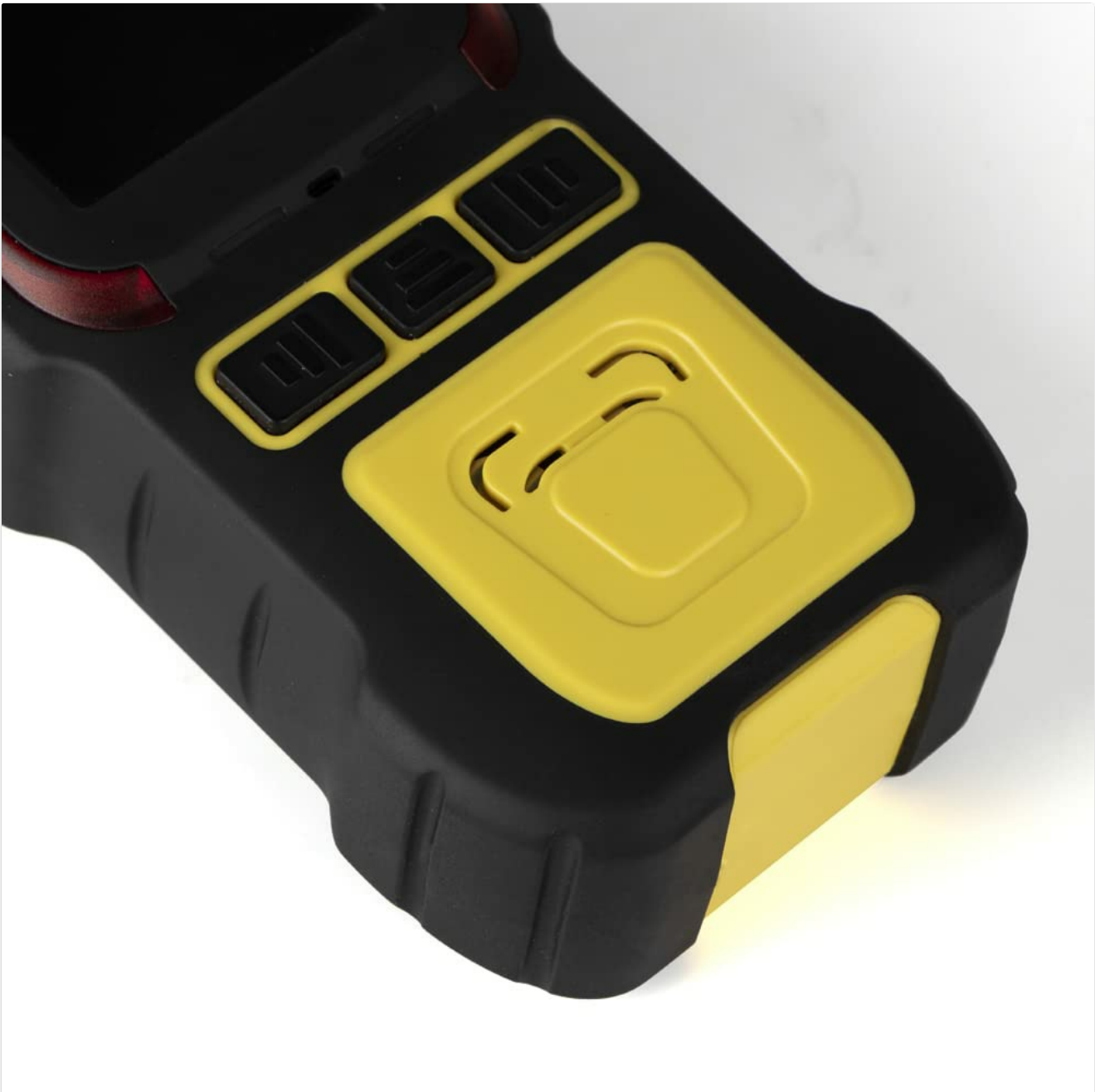
Image: A detailed view of the control buttons located on the front panel of the K-600M Gas Detector, used for navigation and function selection.