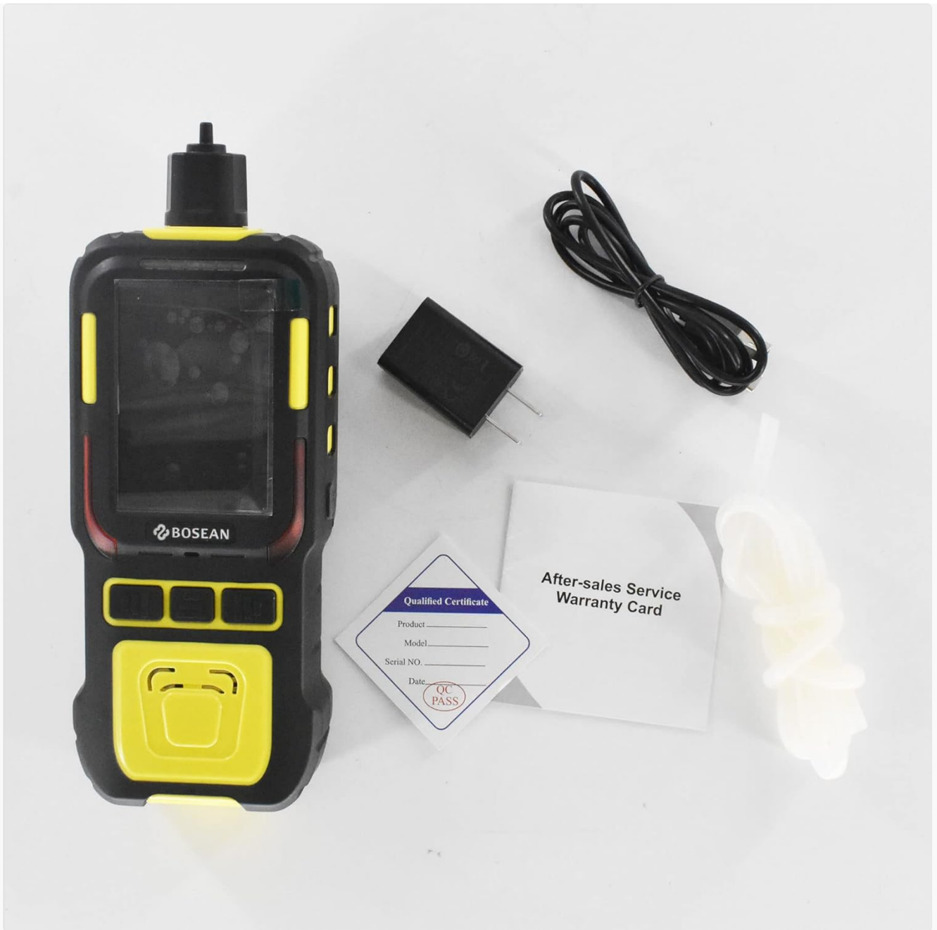
Image: A complete view of the K-600M Gas Detector and its individual accessories, including the main unit, USB cable, power adapter, warranty card, and qualified certificate, laid out on a flat surface.