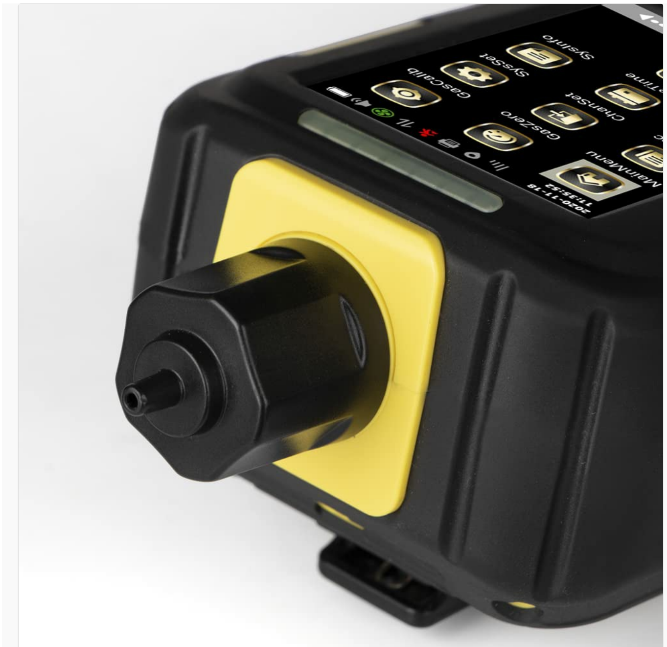
Image: A close-up view of the top section of the K-600M Gas Detector, highlighting the gas sampling inlet where air is drawn in for analysis.