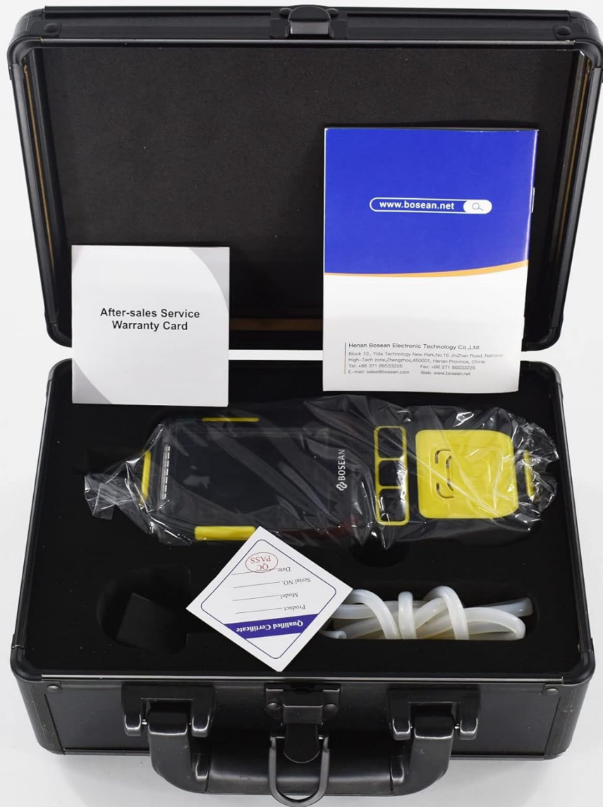
Image: The K-600M Gas Detector, along with its accessories including a manual, warranty card, and charging components, neatly organized within its protective carrying case.