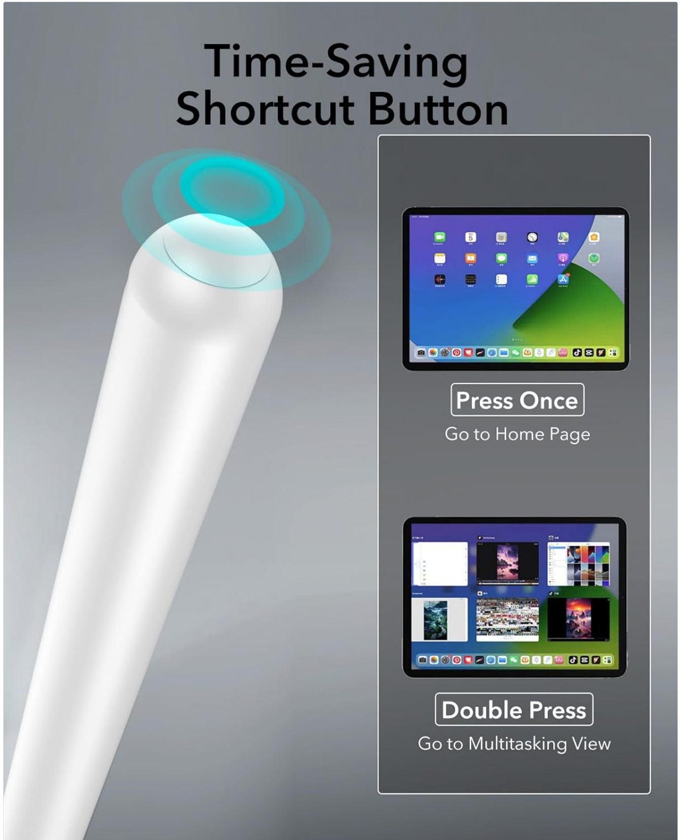
Image: A close-up of the stylus tip illustrating the single-press action for Home Page and double-press action for Multitasking View.