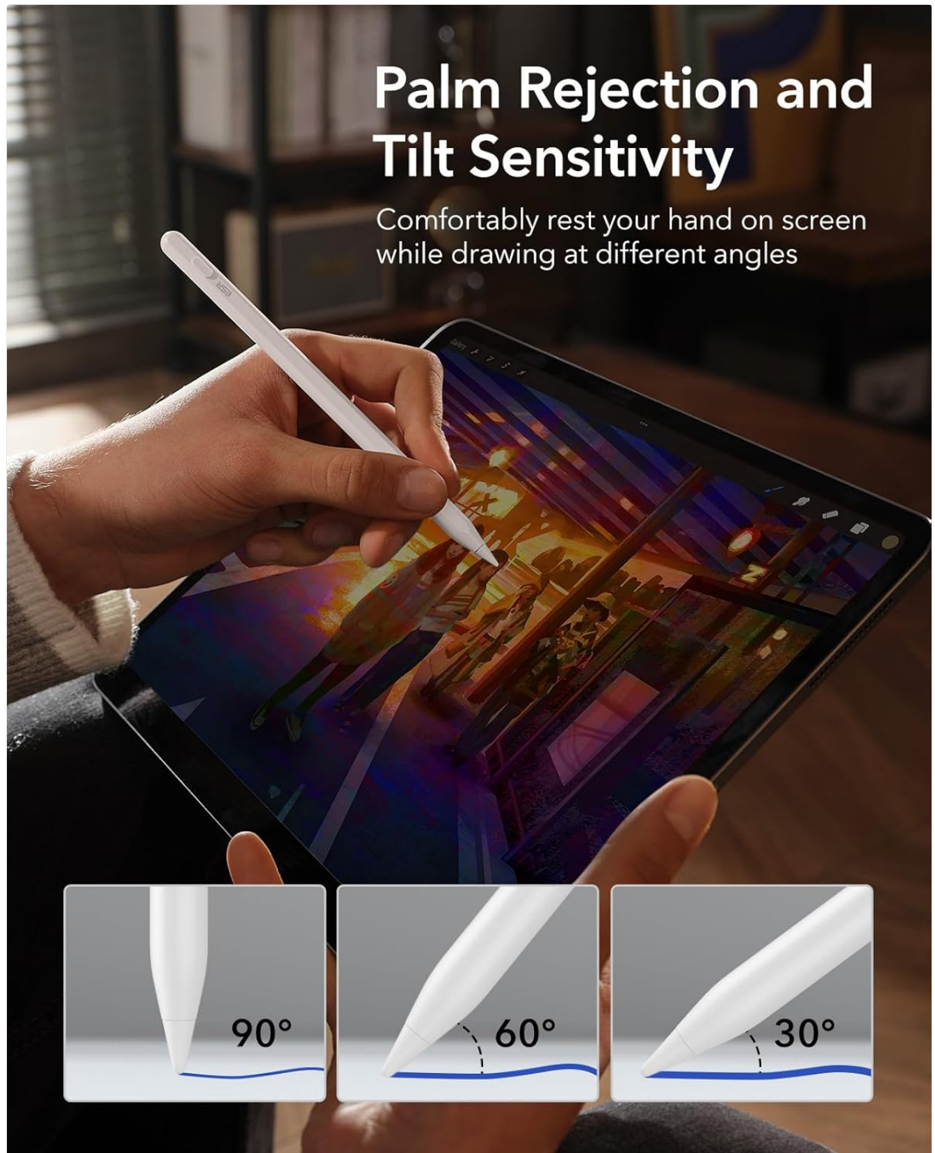
Image: Visual explanation of palm rejection, showing a hand resting on the screen while the stylus is in use, and examples of tilt

With full palm rejection support, you can comfortably rest your hand on the iPad screen while writing or drawing without unintended marks or interference.