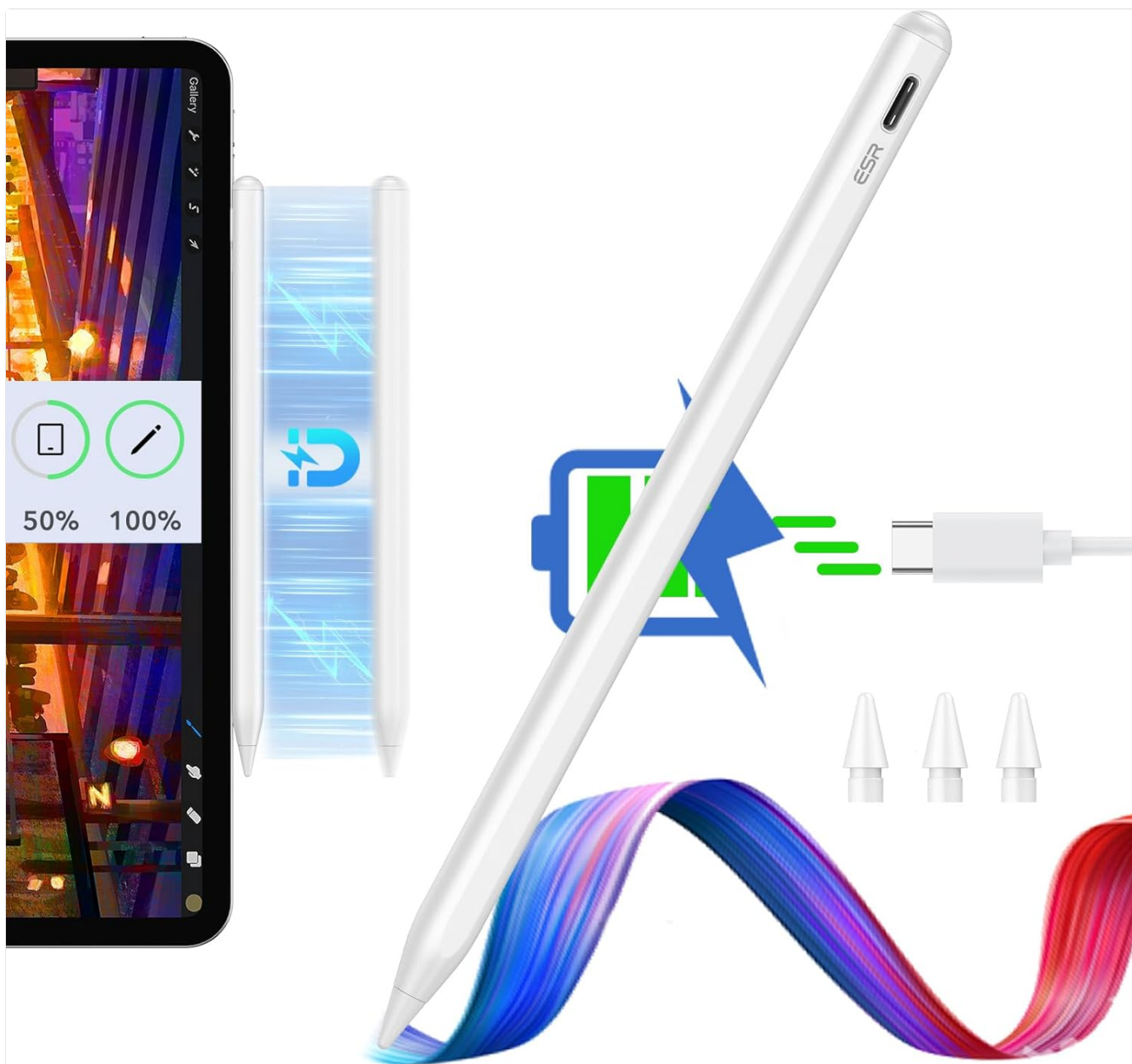
Image: The ESR Stylus Pen, showcasing its magnetic wireless charging capability, USB-C charging port, and included replacement nibs.

The ESR Stylus Pen for iPad is a versatile digital pen designed for seamless interaction with compatible iPad models. It features magnetic wireless charging, tilt sensitivity, palm rejection, and convenient shortcut functions to enhance your digital drawing, writing, and navigation experience.