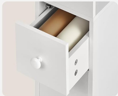
2. Cajón pequeño para cachivaches