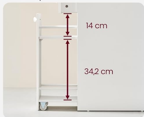
3. Cajón inferior para objetos grandes

Image: Close-up of the cabinet's storage compartments, showing the adjustable shelf, small drawer, and large bottom drawer.