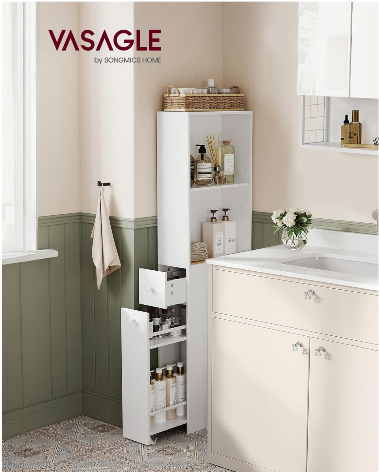
Image: The VASAGLE BBK567T14 cabinet positioned next to a sink, showcasing its slim design and storage capabilities.