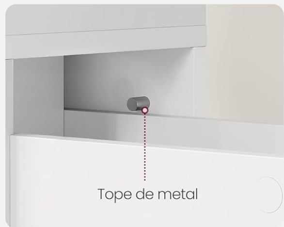
Tope de metal

2 formas de evitar que se caigan los cajones