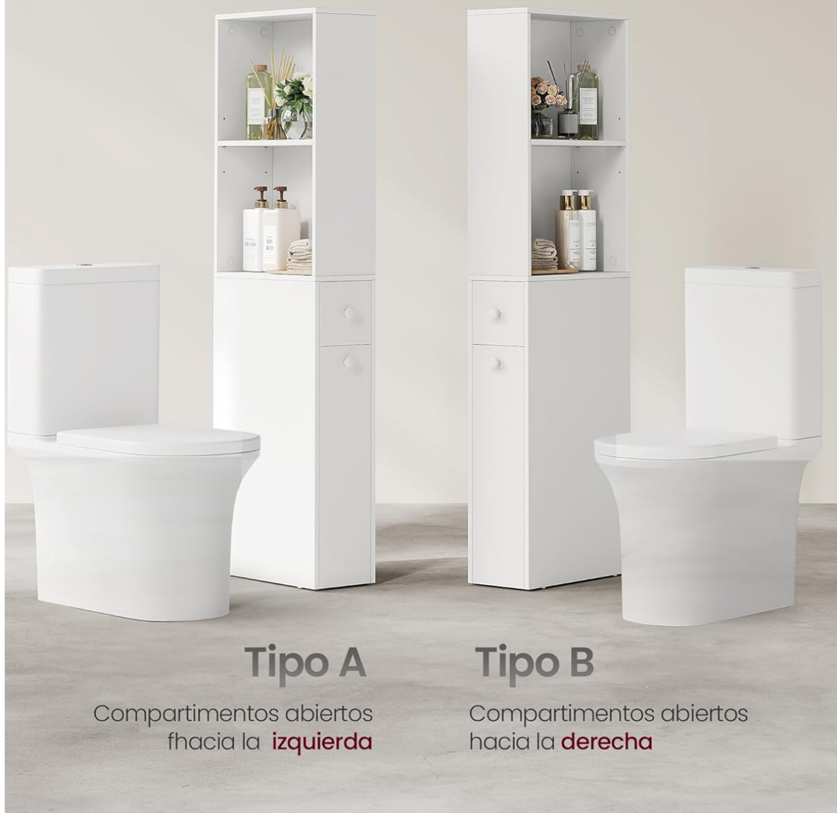
Image: Two configuration options for the cabinet, allowing the open compartments to face left or right.

Elige la que mejor se adapte a tu espacio