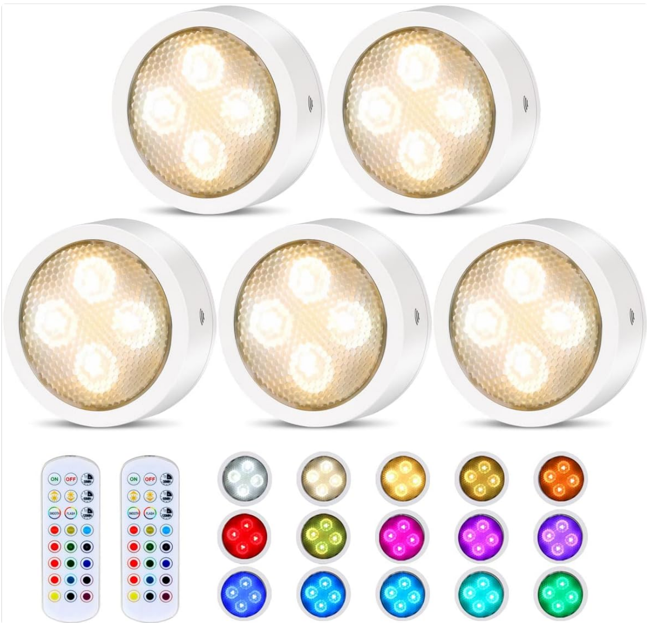
Image: A set of five Onumii puck lights and two remote controls. The lights are shown with various color options, highlighting the RGB and tunable white features. This image provides a comprehensive view of the product and its control accessories.