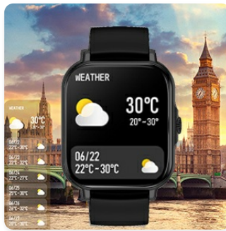
Image: A smartwatch displaying current weather (30°C, cloudy) and a 7-day forecast, with a city skyline in the background.