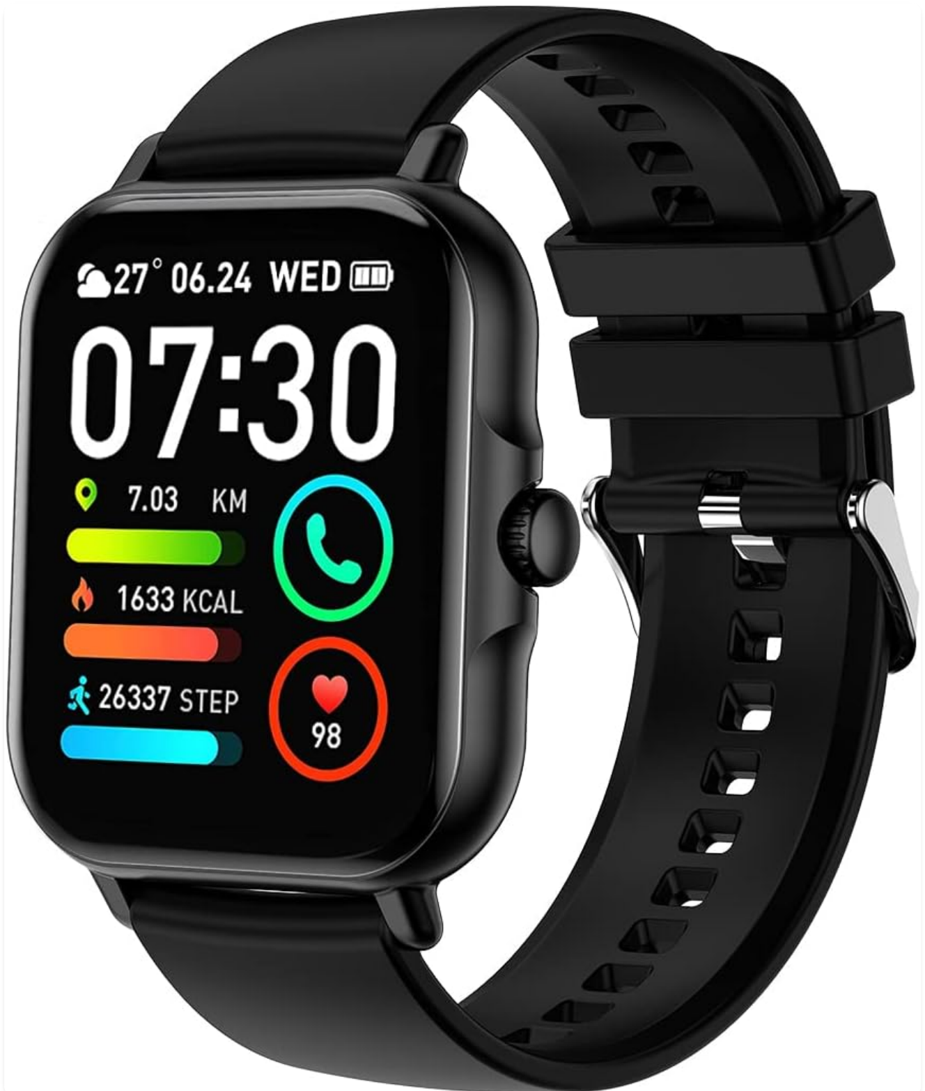
Image: The VANTUO Smartwatch LY736, a sleek black smartwatch with a square display showing time, date, steps, calories, distance, and heart rate.