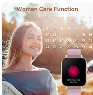
Image: A woman smiling outdoors, with a smartwatch displaying "MENSTRUATION BEGINS" and a calendar overlay, indicating the women's care function.