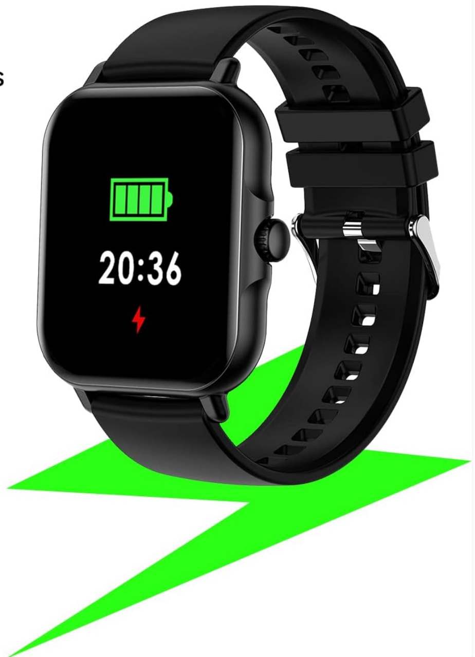
Image: An illustration showing the smartwatch connected to a charger, with icons indicating 2 hours charging time, 2-3 days usage time, and 5-7 days standby time.