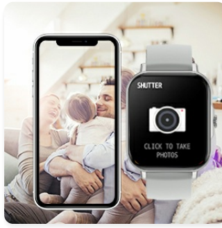
Image: A smartwatch displaying a camera shutter icon, next to a smartphone showing a family photo, indicating remote camera control.