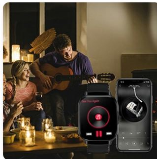
Image: A smartwatch displaying music controls (play/pause, skip) next to a smartphone showing a music player interface.