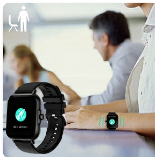
Image: A smartwatch on a wrist vibrating with a "WALK AROUND!" message, indicating a sedentary reminder, with people in an office setting in the background.