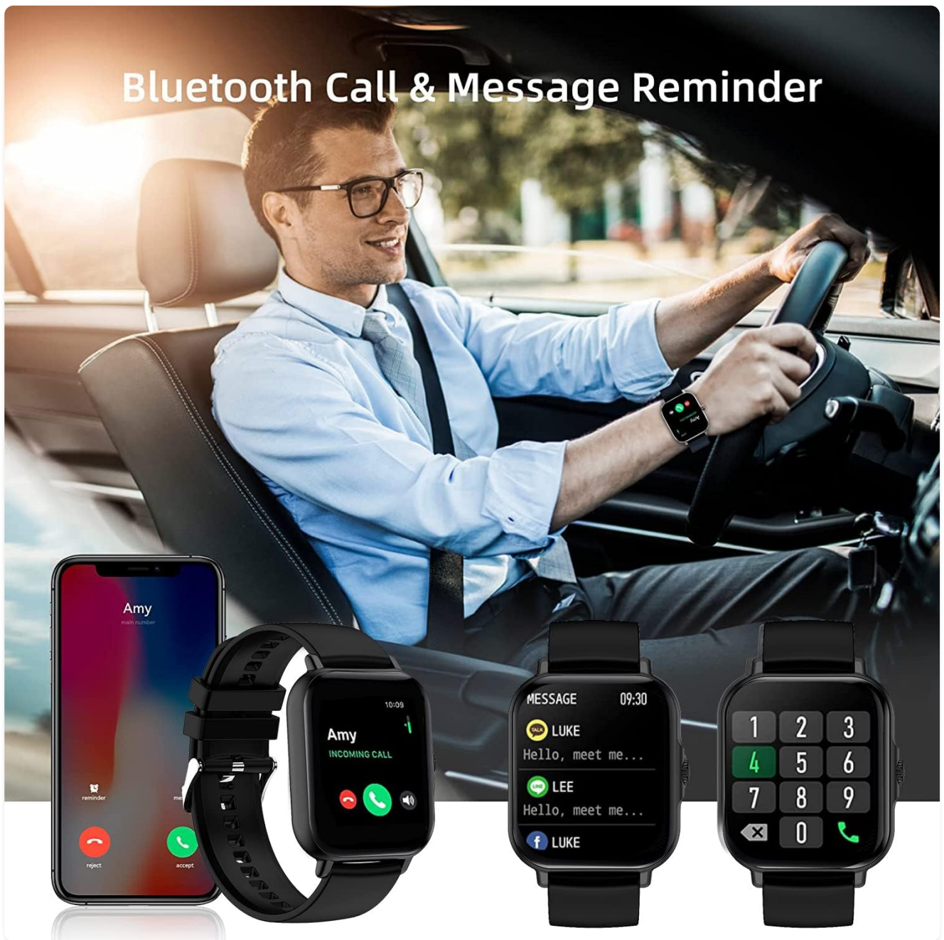
Image: A person driving, wearing the smartwatch, with an incoming call notification on the watch. Below, images show the smartwatch displaying an incoming call, a message notification, and a dial pad.