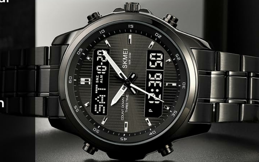
Image 2.1: Visual summary of the watch's key features, highlighting its display type, functions, and materials.