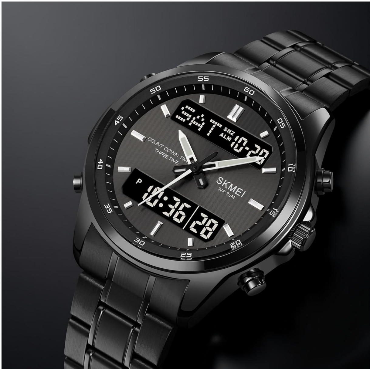
Image 3.1: Detailed view of the watch face and side buttons, indicating their positions.