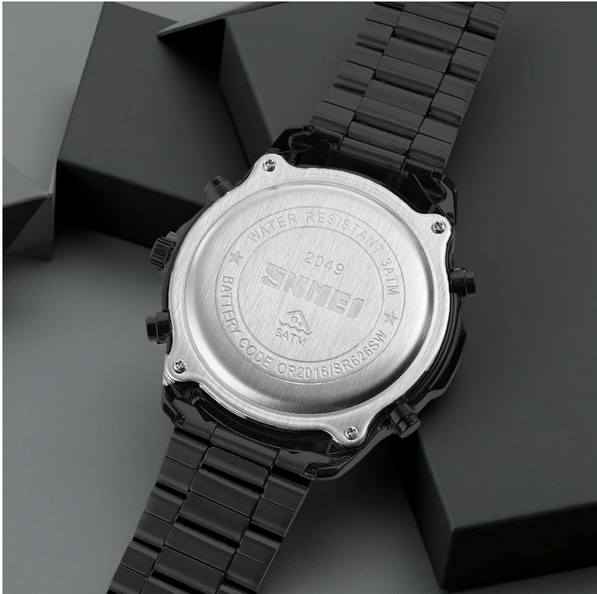
Image 6.1: Rear view of the watch, confirming its water resistance rating and model number.

Your SKMEI 2049 watch is water-resistant to 30 meters (3ATM). This means it is suitable for daily use, such as accidental splashes, rain, and brief immersion in water like light swimming. It is not suitable for showering with hot water, diving, or prolonged underwater activities. Do not operate buttons while the watch is wet or submerged.