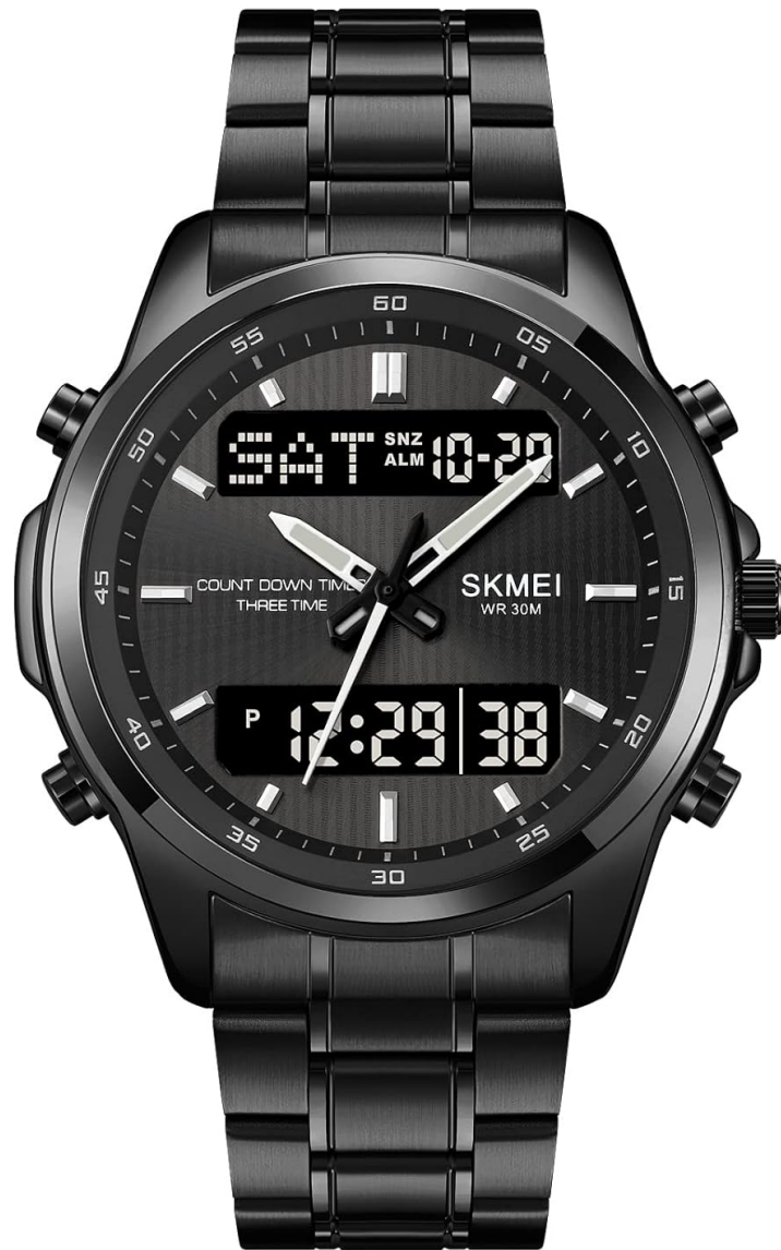
Image 1.1: Front view of the SKMEI Model 2049 watch, showcasing its dual display and overall design.