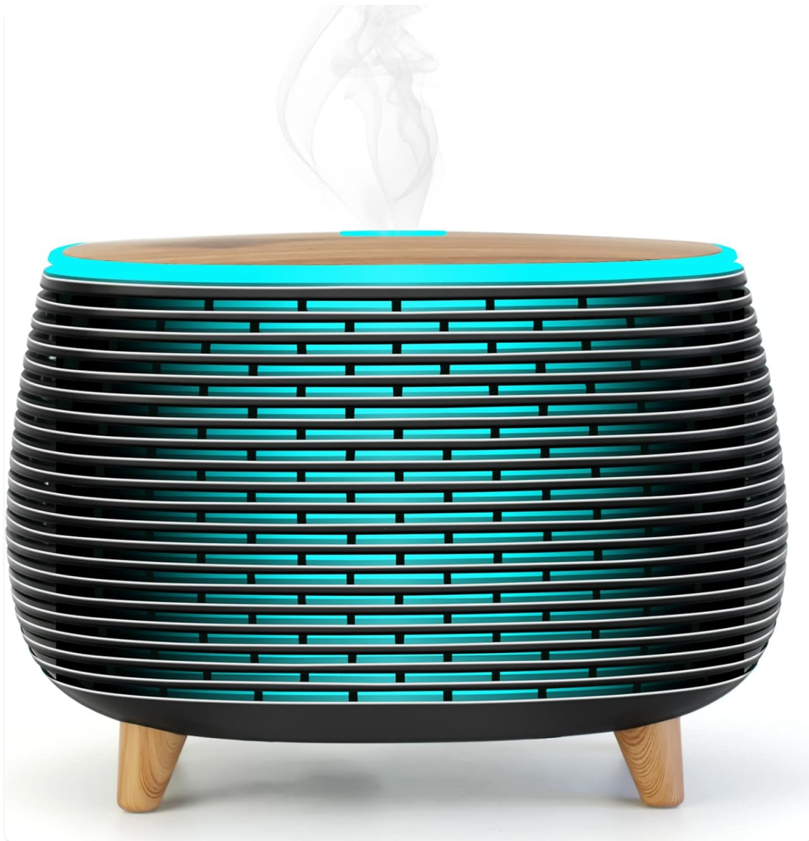
Image: The Diffuserlove 400ML Essential Oil Diffuser, showcasing its sleek design and mist output.