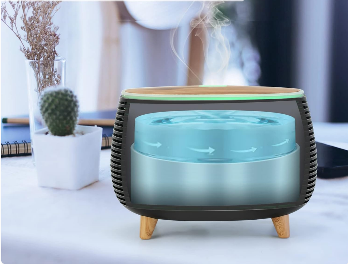
Image: The internal water tank of the diffuser, indicating the 400ML capacity and fill line.