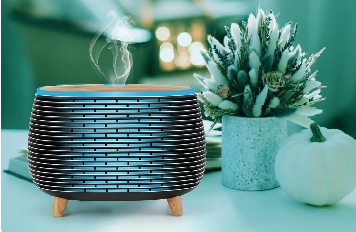
Image: Visual representation of the continuous and intermittent mist settings.