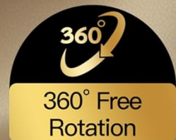
Image: A diagram illustrating the precise dimensions of the mirror, including its width, height, and depth, along with icons for smart touch control, smooth dimming, HD mirror, and 360-degree rotation.