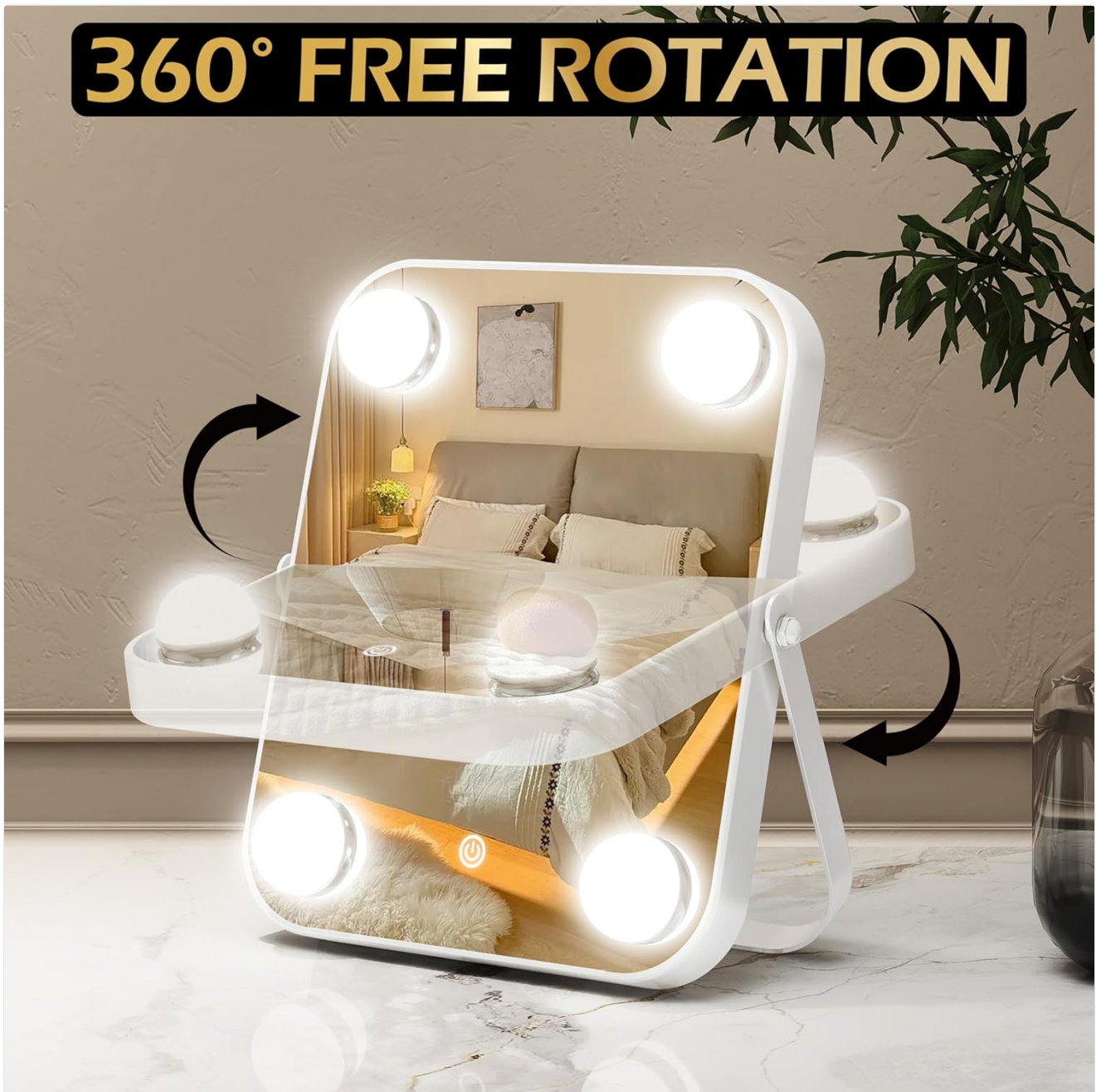
Image: The vanity mirror shown rotating 360 degrees on its stand, illustrating its flexible positioning capability.

Image: A detailed view highlighting the mirror's features, including the HD glass, LED bulbs, USB plug-in port, and the sturdy U-shaped stand.