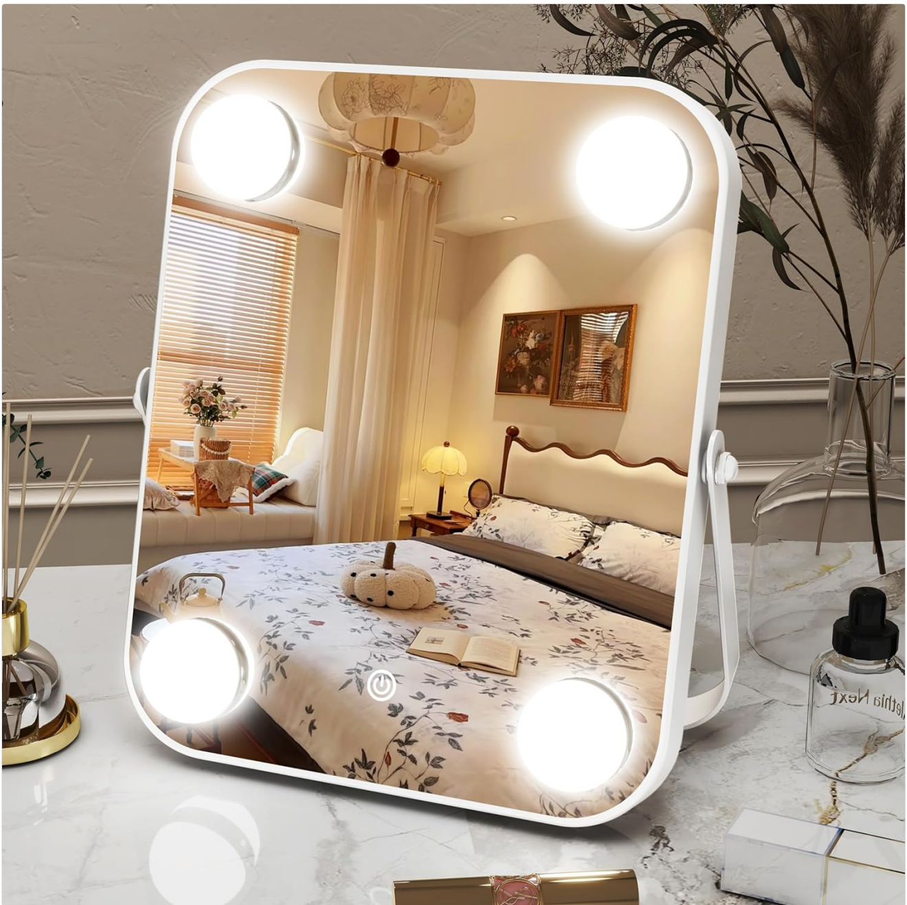
Image: The ROLOVE Hollywood Vanity Mirror, showcasing its rectangular shape and four illuminated LED bulbs, positioned on a vanity table in a bedroom setting.