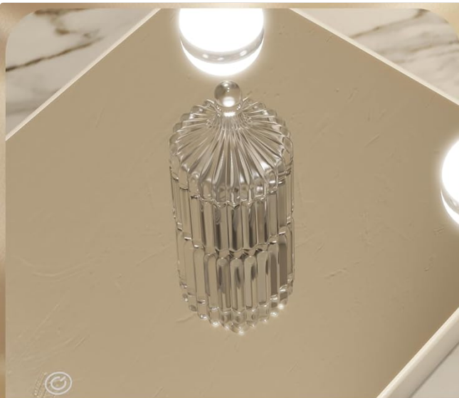
HD Glass Mirror