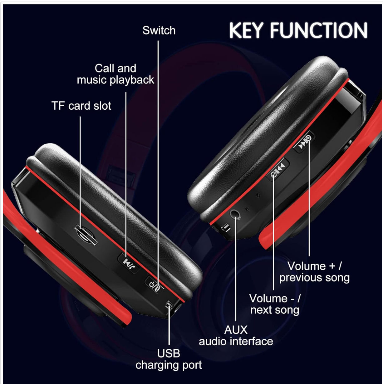
Image 3.1: Diagram illustrating the key functions and ports on the E-Greetshopping B39 headphones. This includes the power switch, call/music playback button, TF card slot, USB charging port, volume controls, and AUX audio interface.