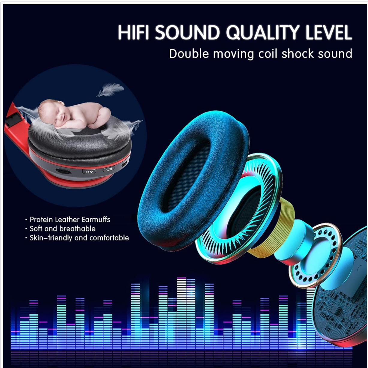
Image 8.1: Illustration highlighting the HiFi sound quality level with double moving coil shock sound, protein leather earmuffs for comfort, and soft, breathable, skin-friendly materials.