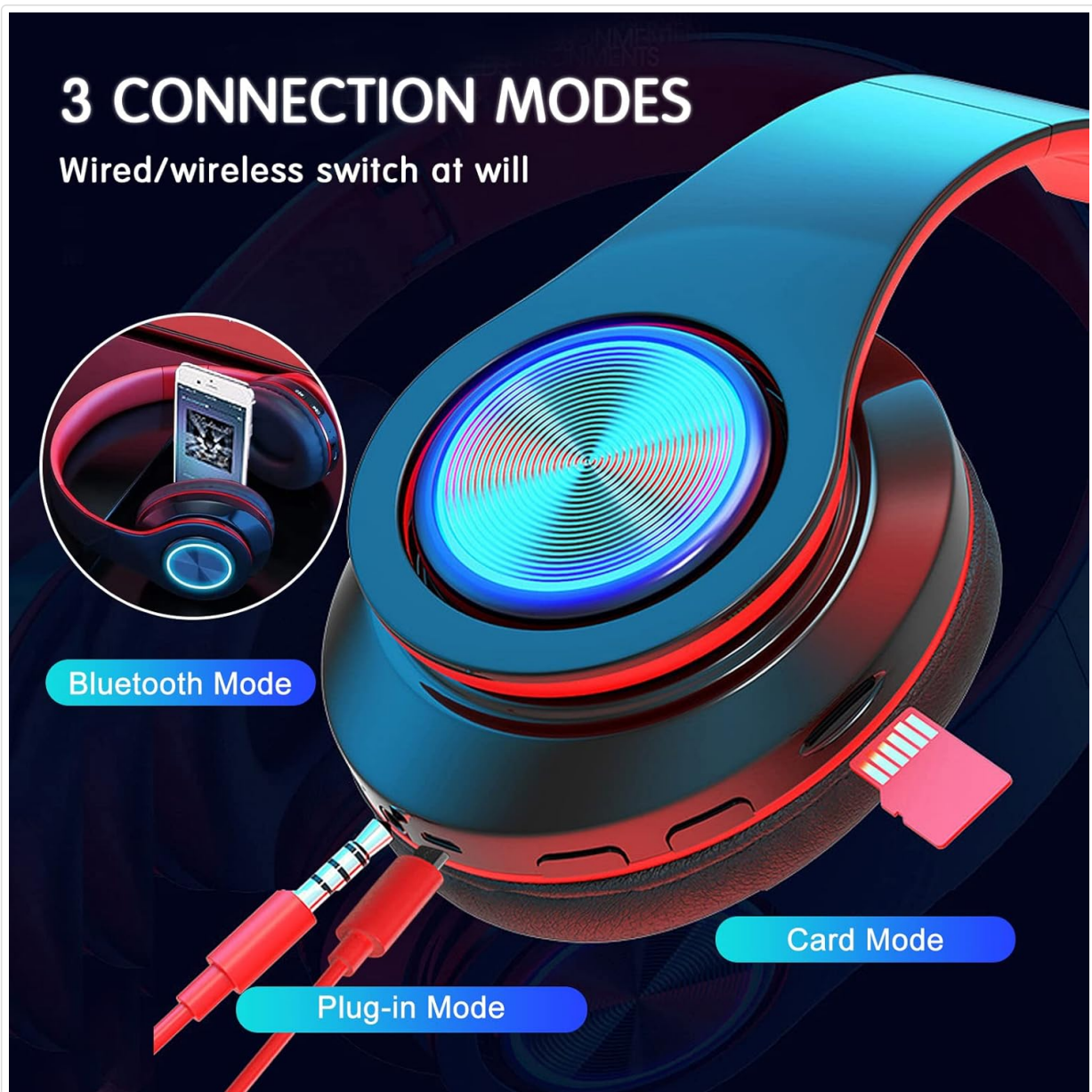
Image 5.1: The headphones support three connection modes: Bluetooth Mode, Plug-in Mode (wired via 3.5mm audio cable), and Card Mode (via TF card).