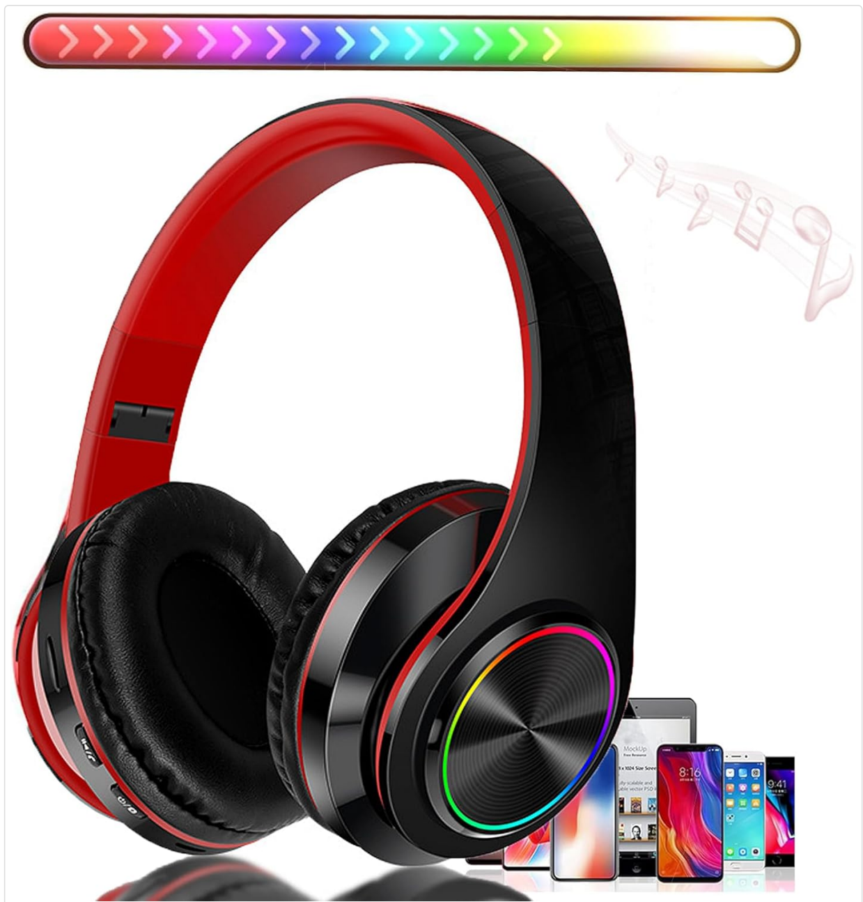
Image 1.1: E-Greetshopping B39 Bluetooth Wireless Over-Ear Headphones. These headphones feature a black and red design with illuminated earcups and a flexible headband.