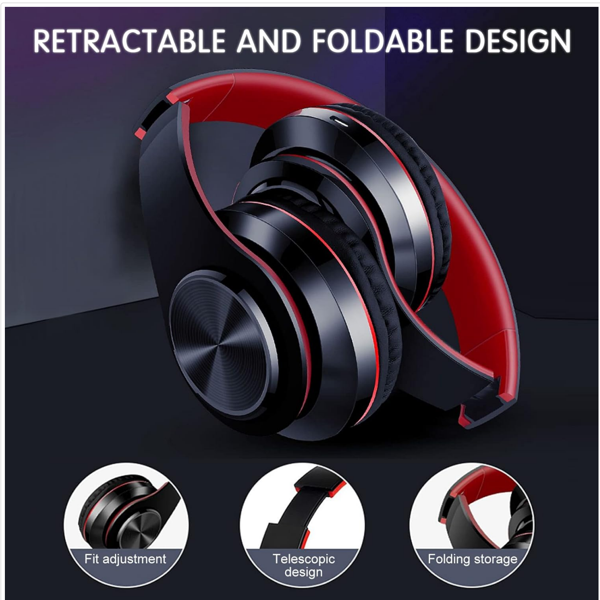
Image 3.2: The headphones feature a retractable headband for fit adjustment, a telescopic design for compact storage, and a foldable mechanism for portability.