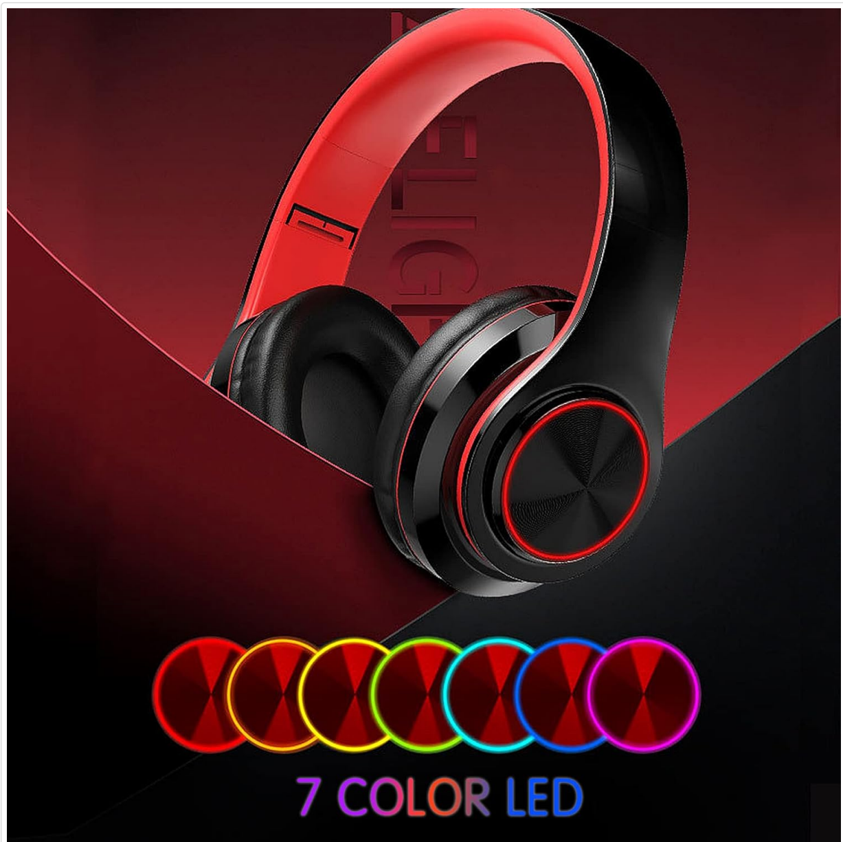
Image 5.2: The headphones display a sequence of 7 different LED colors, indicating the dynamic lighting feature.