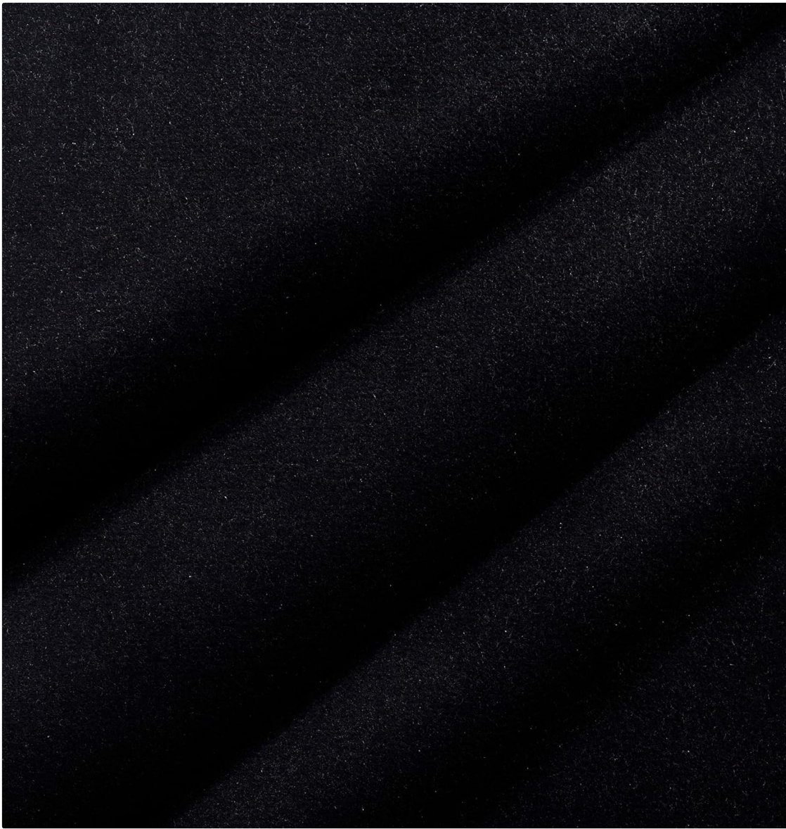
Image: Close-up view of the luxurious black velvet fabric, highlighting its soft texture and sheen.