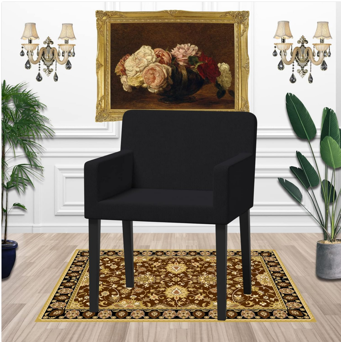
Image: A black velvet chair cover fully installed on a dining armrest chair, showcasing its tailored fit and appearance within a decorative room.