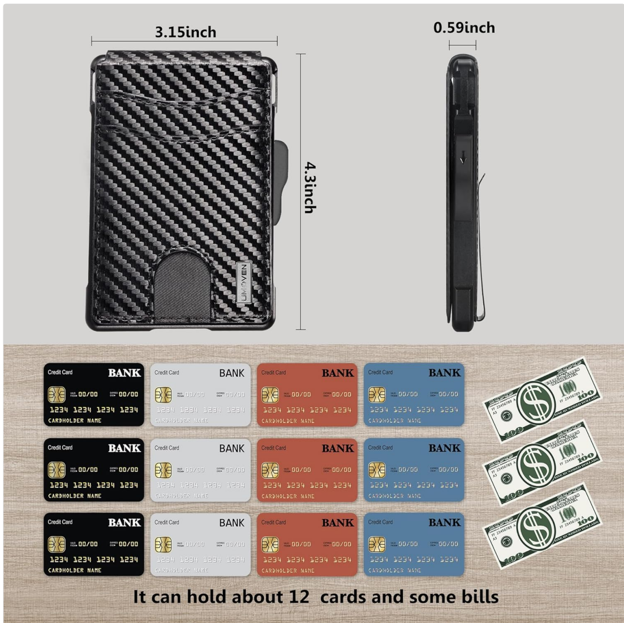
Image: Visual representation of the wallet's dimensions and its capacity for cards and bills.