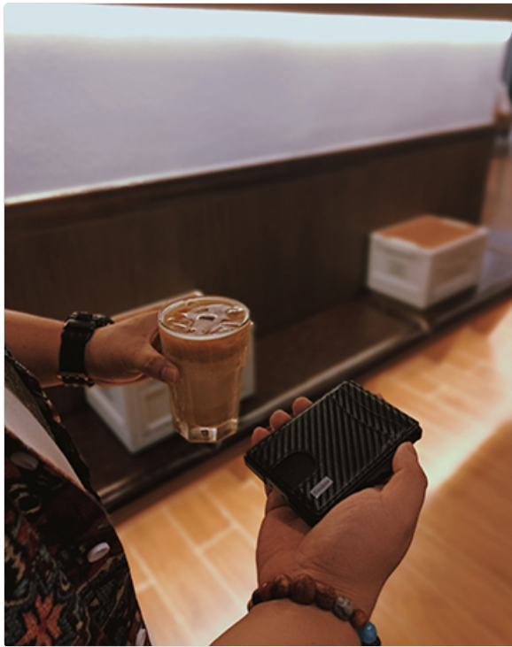
Image: A close-up view of the sturdy metal money clip on the back of the umoven wallet.